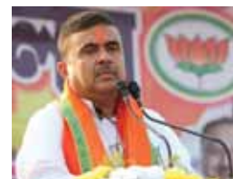
Referring to an earlier speech by Banerjee warning people against communal disturbances that could be provoked by the BJP, he said "a Chief Minister who provokes people into taking part in riots has no right to continue in power."

called out to the people in a massive rally at Chandrakona in East Midnapore district saying, "Let us defeat Pishi (paternal aunt) and Bhaipo (nephew)" implying the Chief Minister and her nephew and Trinamool Congress general secretary Abhishek Banerjee.