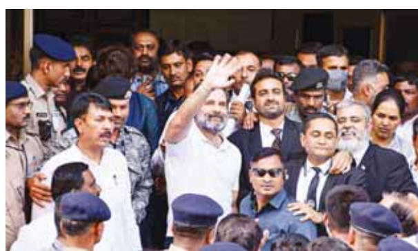
Congress leader Rahul Gandhi waves at supporters as he leaves from Surat District Court after filing an appeal challenging his conviction and sentencing in the 2019 criminal defamation case over 'Modi surname' remark, in Surat on Monday