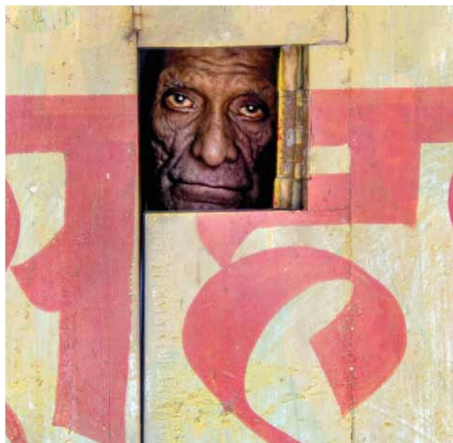
A shopkeeper looks through a window in his shop shutter after the imposition of Section 144 in the Sandhya Bazar area a day after clashes broke out between two groups during a Ram Navami procession, in Hooghly district.

Attacking the BJP for orchestrating riots in the State Banerjee said, "they are bringing people from outside to provoke violence... The BJP is trying to stay afloat and relevant in Bengal politics by programming festivals for five days and inciting communal riots in the name of religious processions."