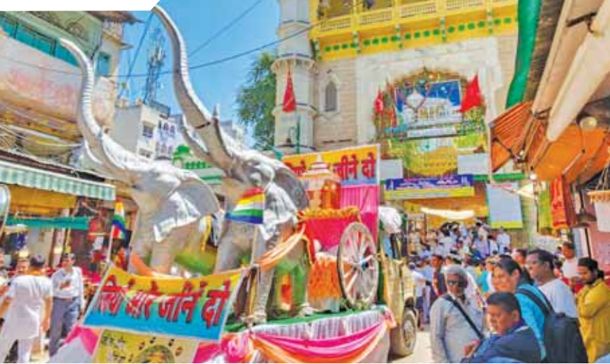
A procession during celebrations of Mahavir Jayanti in Ajmer