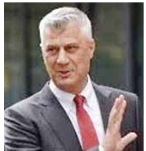
attempt to rewrite the history of their struggle for independence.

Kosovo's former president pleaded not guilty Monday to charges including murder, torture and persecution as he went on trial with three other former leaders of the Kosovo Liberation Army, while a prosecutor insisted that "nobody is above the law." Hashim Thaci resigned from office in 2020 to defend himself against the charges of crimes against humanity and war crimes committed during his country's 1998-99 war for independence from Serbia. "I am fully not guilty," Thaci told judges at the Kosovo Specialist Chambers as the trial opened. The other three defendants also repeated not guilty pleas made at earlier pretrial hearings. The case has stirred an outpouring of support from across the political spectrum in Kosovo. On Sunday, thousands of people took to the streets to show their support for the defendants. Many Kosovars consider the Netherlands-based court an injustice and view it as an