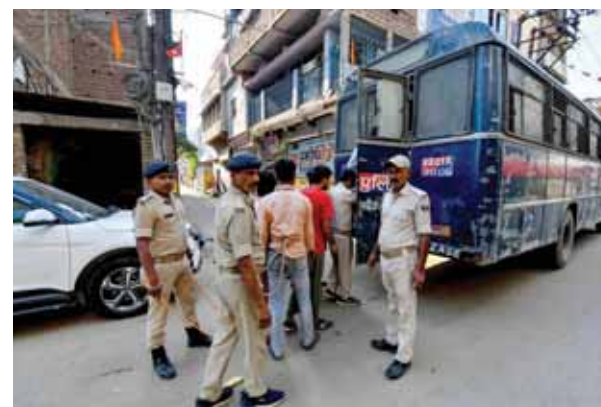
Security personnel detain protesters following clashes between two groups during Ram Navami procession, at Bihar Sharif in Nalanda district on Monday.

The Opposition members, though, were soon outnumbered and outshouted by those in the 'Mahagathbandhan', who accused the BJP-RSS of involvement in the riots, and also deplored Shah's remarks at a rally in Nawada district on Sunday, where he had vowed to "hang upside down" the rioters if the BJP came to power in the state. The riots had broken out in Sasaram and Bihar Sharif on