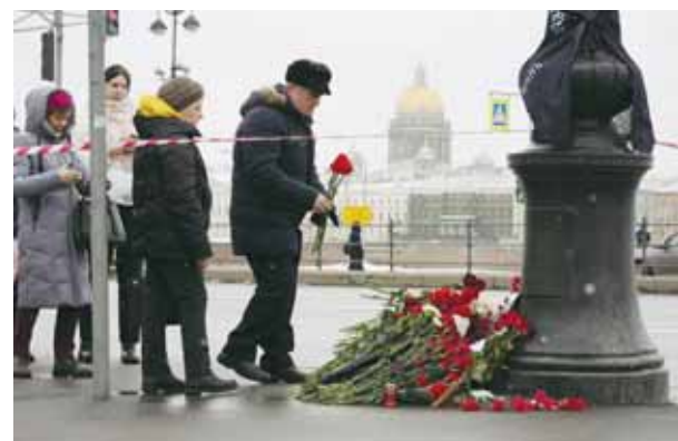
People lay flowers near the site of an explosion at the "Street Bar" cafe with the St. Isaac's Cathedral in the background in St. Petersburg, Russia on Monday.

Russian authorities blamed Ukrainian intelligence agencies on Monday for orchestrating a bombing at a St. Petersburg cafe that killed a Russian military blogger who fervently supported Moscow's invasion of Ukraine and arrested a suspect accused of involvement in the attack. Ukrainian authorities did not directly respond to the accusation, but President Volodymyr Zelenskyy said that he doesn't think about events in Russia and a senior official earlier described the bombing as part of Russia's internal turmoil. Vladislav Tatarsky, 40, was killed Sunday as he was leading a discussion at a cafe on the banks of the Neva River in the historic heart of Russia's second-largest city, officials said. Tatarsky, who had filed regular reports from the front lines in Ukraine, was the pen name for Maxim Fomin. He had accumulated more than 560,000 followers on his Telegram messaging app