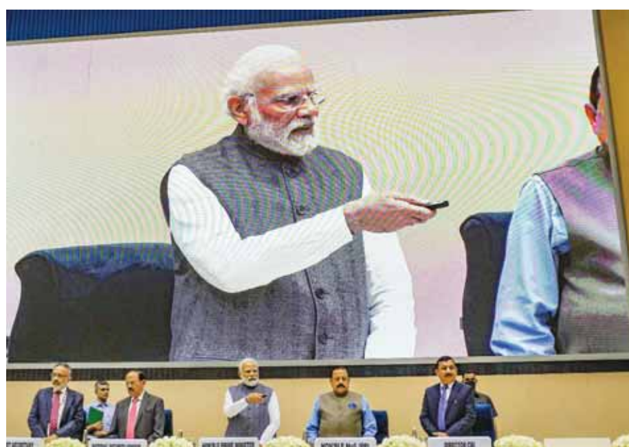
Prime Minister Narendra Modi with Union Minister Jitendra Singh, NSA Ajit Doval, CBI Director Subodh Kumar Jaiswal and others during diamond jubilee celebrations of Central Bureau of Investigation, in New Delhi on Monday

Modi said wherever there is corruption, the youth do not get equal opportunities, and