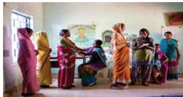
Mahatma Jyotirao Phule Jan Arogya Yojana.

It said people who are already beneficiaries of the Antyodaya food scheme, priority group families (under the National Food Security Act 2013) and Annapurna ration card holders can avail of healthcare benefits under the