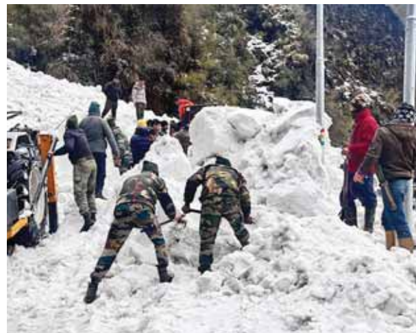
Rescue operations underway after an avalanche at Nathu La on Tuesday.

Among those dead are a woman and a child, he added. The search operation was called off in the evening due to