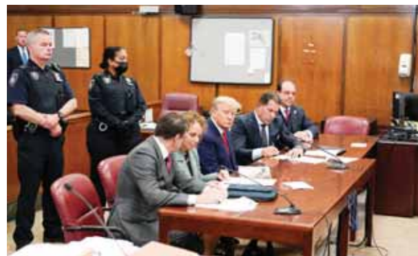
Former US President Donald Trump sits at the defense table with his legal team in a Manhattan court in New York on Tuesday.

Trump pleaded not guilty to 34 felony counts of falsifying business records. He entered