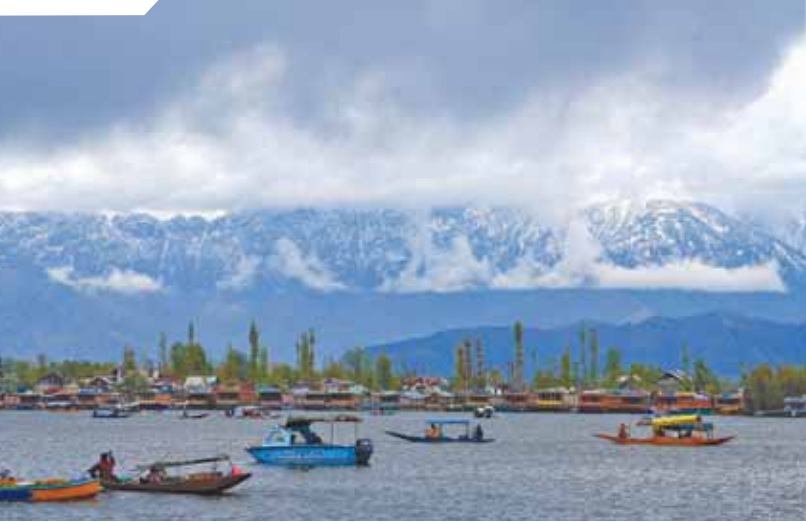
Tourists ride boats at the Dal Lake after rainfall, in Srinagar