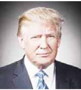
addition to everything else, to win elections."

"Our justice system has become lawless," Trump said as he appeared before supporters at his Florida home, Mar-a-Lago. "They're using it now, in