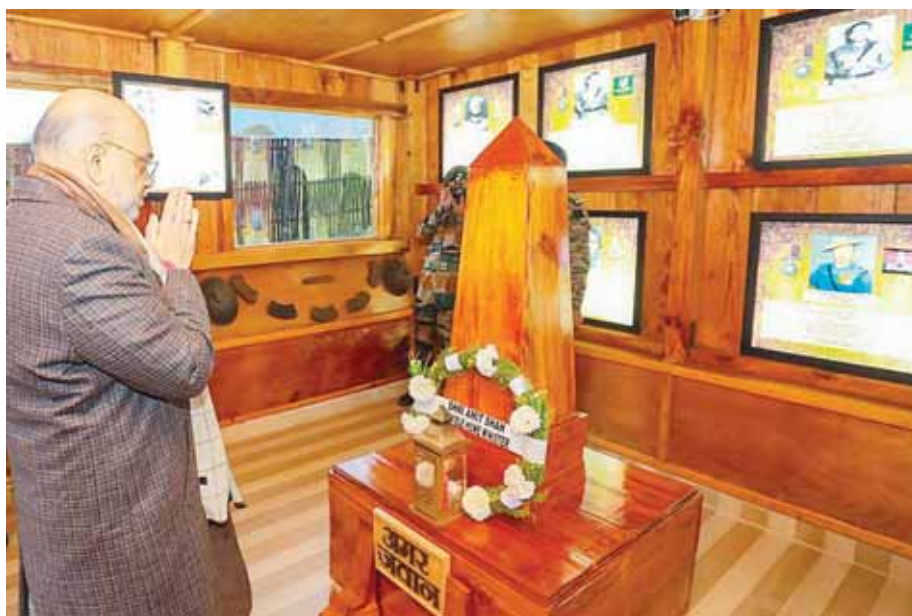
Union Home Minister Amit Shah pays homage at the Kibithoo Remembrance Hut in Arunachal Pradesh on Monday

Shah, who will be in Arunachal Pradesh for two days, said no one can cast an evil eye on India because of the security forces who protect the country's frontiers.