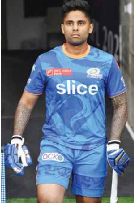
get off to bad starts in the IPL," head coach Ricky Ponting said after the loss to the Royals.

"If I could put my finger on it, I'd do something to change it. We need to do some more soul-searching as a group and talk about it. Three games in and no wins...you can't get afford to