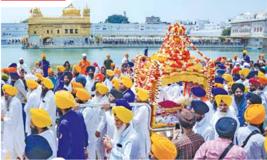
Devotees take part in a 'Nagar Kirtan' ahead of the birth anniversary of Guru Tegh Bahadur, at Golden Temple