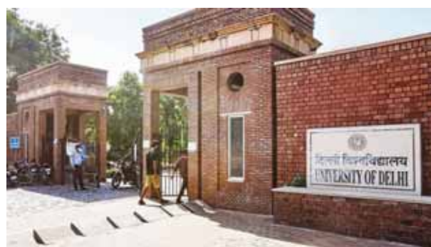
development in higher education institutes.