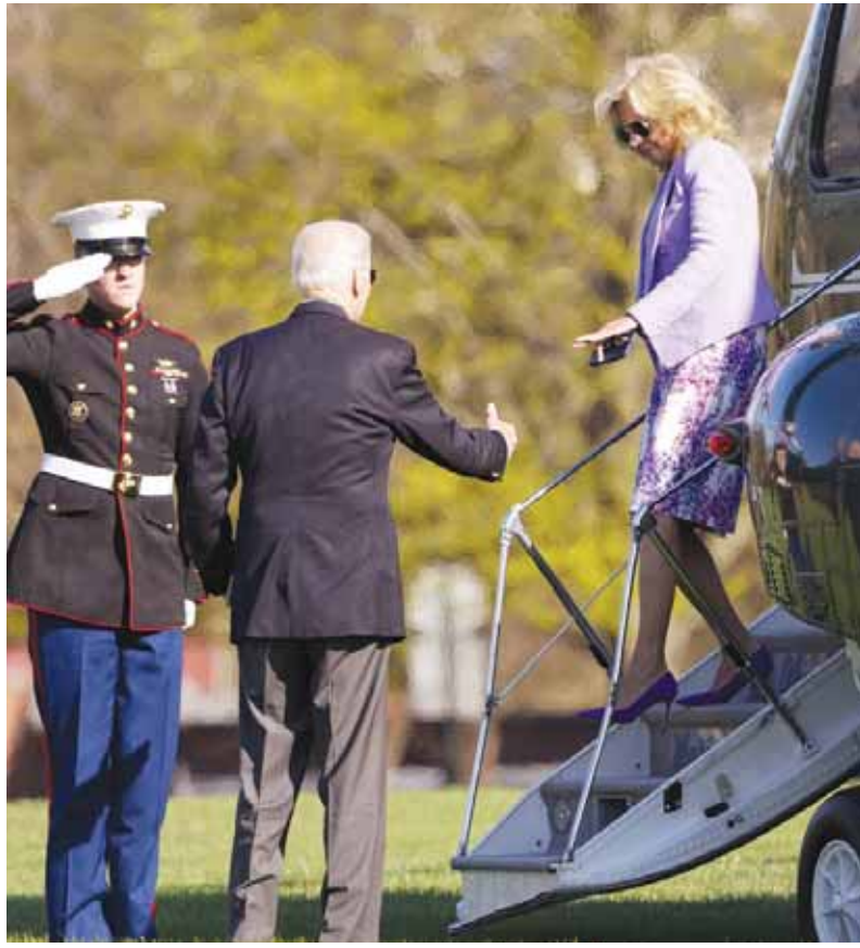
President Joe Biden helps first lady Jill Biden exit Marine One as they arrive at Fort McNair, on Easter on Sunday in Washington. The Bidens are returning from Camp David.

Tsai's predecessor and pro-Beijing politician, Ma Ying-jeou, also returned to Taiwan on Friday last, ending a 12-day trip to the Chinese mainland, where he sought to promote the one-China framework as the basis for improving cross-strait ties and holding talks.