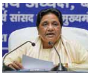
BSP supremo Mayawati addresses a press conference, at party office in Lucknow, on Monday