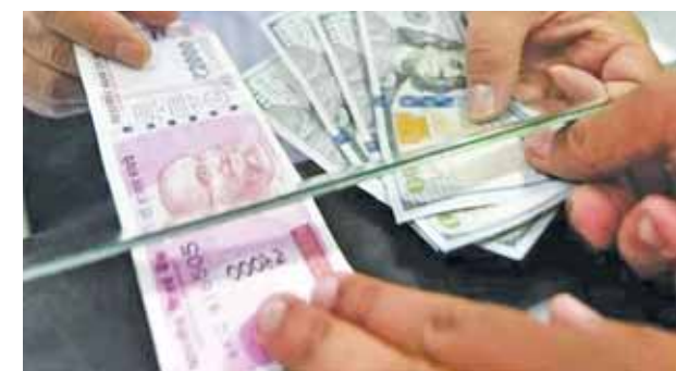
PTI ■ MUMBAI

India's forex reserves increased by USD 6.306 billion to USD 584.755 billion for the week ended April 7, the RBI said on Friday.