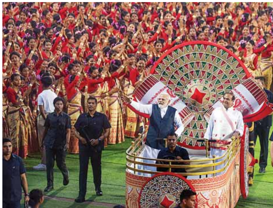
Prime Minister Narendra Modi with the Assam CM Himanta Bishwa Sharma during the mega Bihu dance programme at Sarusajai Sports Complex in Guwahati on Friday

In what many analysts saw as an energetic early start to next year's general elections, the PM made attacking speeches and attended programmes and cultural galas — North-East's first AIIMS in Guwahati; three medical colleges at Nalbari, Nagaon and Kokrajhar; Platinum Jubilee celebrations of Gauhati High Court; Guinness World Record making Bihu dance performance — Modi claimed in the last nine years since his government came to power, the definition of connectivity had been changed