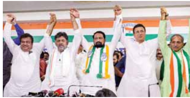
Former Karnataka Deputy CM Laxman Savadi with Congress Karnataka president DK Shivakumar, AICC general secretary Randeep Surjewala and Congress leader MB Patil during a Press conference after Savadi joined the Congress party ahead of Karnataka Assembly polls, at the KPCC office in Bengaluru on Friday

He was flanked by Congress state president D K Shivakumar, Congress national