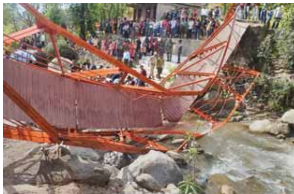
People gather after a foot over bridge collapsed during the Baisakhi celebration at Beni Sangam, in Udhampur on Friday

Deputy Commissioner, Udhampur Kritika Jyotsana said that a total 62 people were injured out of which 25 were shifted to District Hospital Udhampur. Out of 25, 6 critically