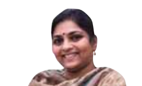
HIMA BINDU KOTA

The oldest billionaire in India was also the most down-to-earth person.