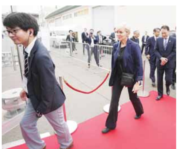
U.S. Energy Secretary Jennifer Granholm, center, arrives to tour a liquefied hydrogen carrier at a pier in Otaru, northern Japan on Friday.

"So this is happening. The tectonic plates are shifting, and it has to happen more quickly," she said, pointing to US efforts to curb emissions in transportation and power generation