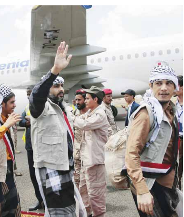
Houthi prisoners cheer as they arrive to Sanaa airport on Friday. An exchange of more than 800 prisoners linked to Yemen’s long-running war with them began Friday, the International Committee for the Red Cross said. The three-day operations will see flights transport prisoners between Saudi Arabia and Yemen’s capital, Sanaa, long held by the Iranian-backed Houthi rebels.