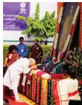
Prime Minister Narendra Modi pays tribute to BR Ambedkar on his birth anniversary celebrations, at Parliament house complex, in New Delhi, on Friday