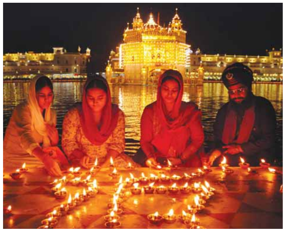
Devotees light lamps at the illuminated Golden Temple on the occasion of the 'Baisakhi' festival, in Amritsar on Friday.

The JD(U) leader also alleged that the "BJP-led Government at the Centre has done nothing for the country or Bihar, other than propaganda".