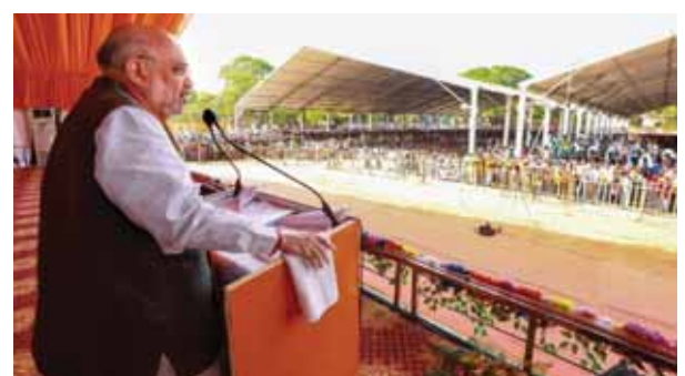
Union Home Minister Amit Shah addresses during a public meeting at Suri in Birbhum district on Friday