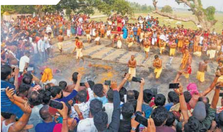
Devotees walk on burning coals on the occasion of Pana Sankranti festival in Khorha, Odisha