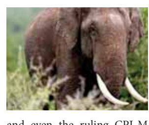
Tusker Ari Komban

Members of Muthalamada And Nemmara panchayats in Palakkad district staged a dawn to dusk sit-in on Monday demanding the Kerala Government not to translocate the wild tusker Ari Komban to Parambikulam forests.