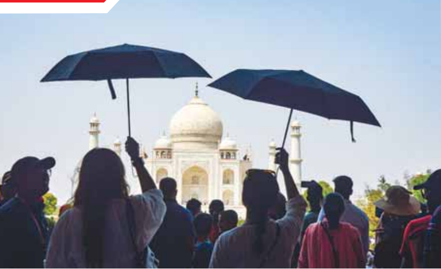
Tourists use umbrellas to shield themselves from the sun during their visit to the Taj Mahal, in Agra