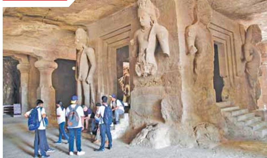
Tourists visit Elephanta Caves, a UNESCO World Heritage Site, on World Heritage Day, in Mumbai