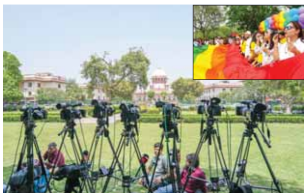
Media personnel at the Supreme Court during a hearing of pleas seeking legal validation for same-sex marriages, in New Delhi on Tuesday. (Inset) In this January 7, 2023, file photo, LGBTQ members take part in a pride parade, in Nagpur.

The Supreme Court on Tuesday made it clear that it will not go into personal laws governing marriages while deciding the pleas seeking legal validation for same-sex marriages and said the very notion of a man and a woman, as referred to in the Special Marriage Act, is not "an absolute based on genitals". The day's proceedings on the sensitive issue started with Centre's vehement submission that its "preliminary objection" be heard and decided first that the court cannot go into the question which essentially is on Parliament's turf. Irked over the submission, a five-judge constitution bench headed by Chief Justice DY Chandrachud said "we are in-