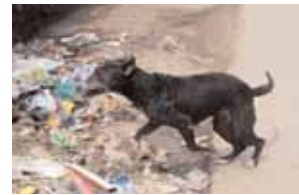
STAFF REPORTER ■ NEW DELHI

In yet another incident of canine attack, a 14-year-old boy was injured in a stray dog attack in southwest Delhi's Rangpuri area. The incident took place on Monday morning when the boy, a resident of Rangpuri, had gone out to answer nature's call.