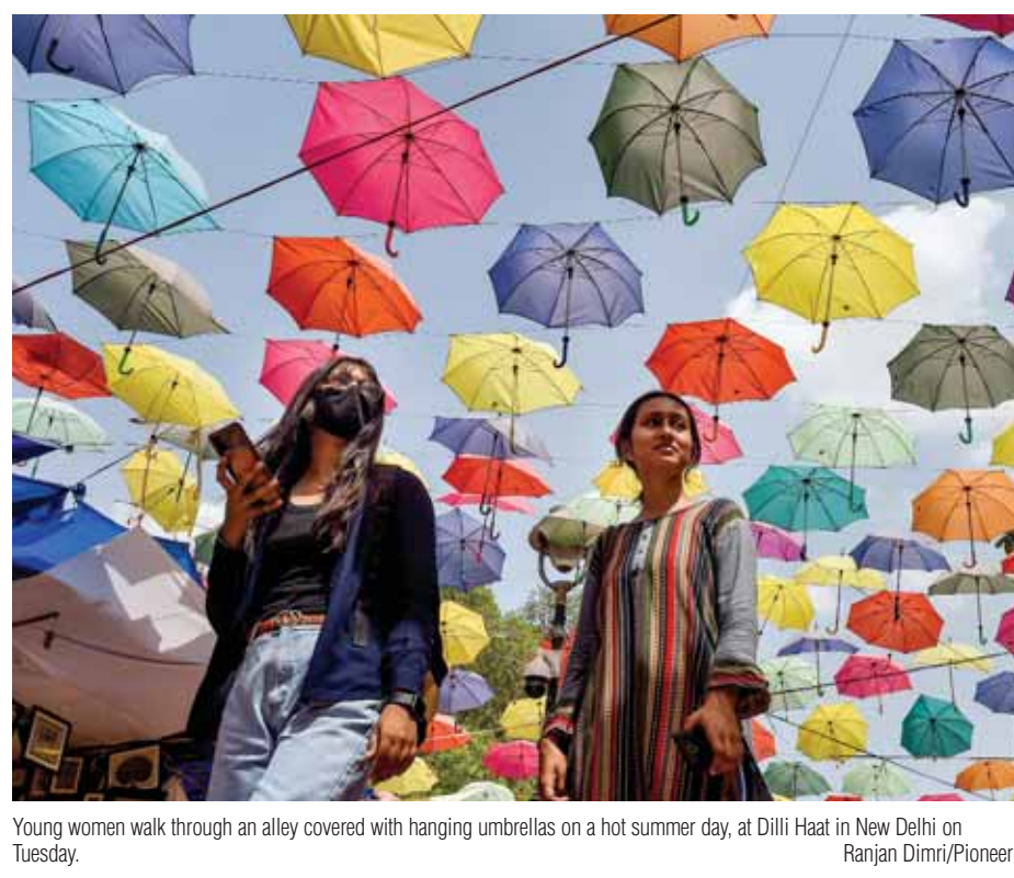
Young women walk through an alley covered with hanging umbrellas on a hot summer day, at Dilli Haat in New Delhi on Tuesday.

— before joining the BJP in 2021 Assembly elections said "if the TMC Government is not removed immediately from power then the glory of Bengal cannot be salvaged ... Bengal is on the edge of destruction and if it has to be saved then Mamata Banerjee has to be driven out." Adhikari's attack comes a day after he claimed that soon the TMC MLAs would start leaving the party in hordes and by the end of the year the ruling outfit would turn into a minority in the Assembly.