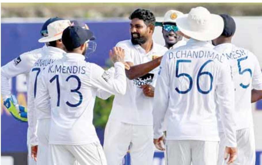
Ramesh Mendis finished the innings.

Ireland began day three on 117-7 and lost its last three wickets all on 143. Lorcan Tucker made a team-high 45 when he tried to sweep Jayasuriya and missed. Mark Adair was stumped off Jayasuriya and