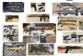
Combo of images shows firearms seized by police after the arrest of as many as 17 people in California in connection with a series of shootings in gurdwaras in Stockton, Sacramento and other locations.