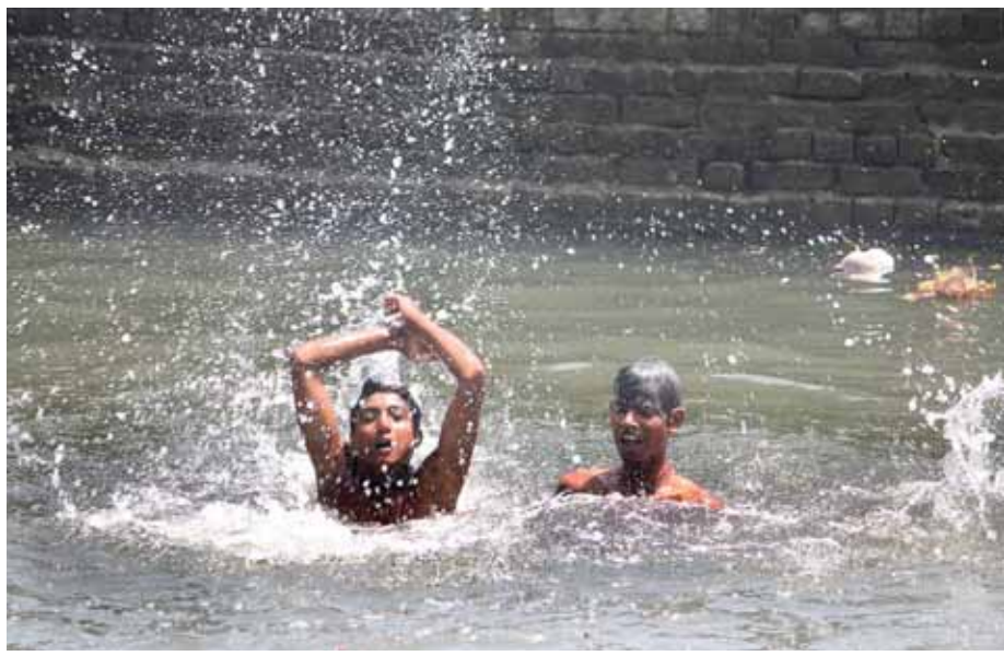
Youngsters cool themselves in the Yamuna in New Delhi on Tuesday

Delhi's primary weather station, the Safdarjung Observatory, registered a maximum temperature of 40.4 degrees Celsius, four notches higher than normal. This is the fourth consecutive day that the maximum temperature settled above 40 degrees Celsius here. Pusa and Pitampura experienced heatwave conditions with maximum temperatures settling at 41.6 degrees to 41.9 degrees Celsius, respectively. The threshold for a heatwave is met when the maximum temperature of a station reaches at least 40 degrees