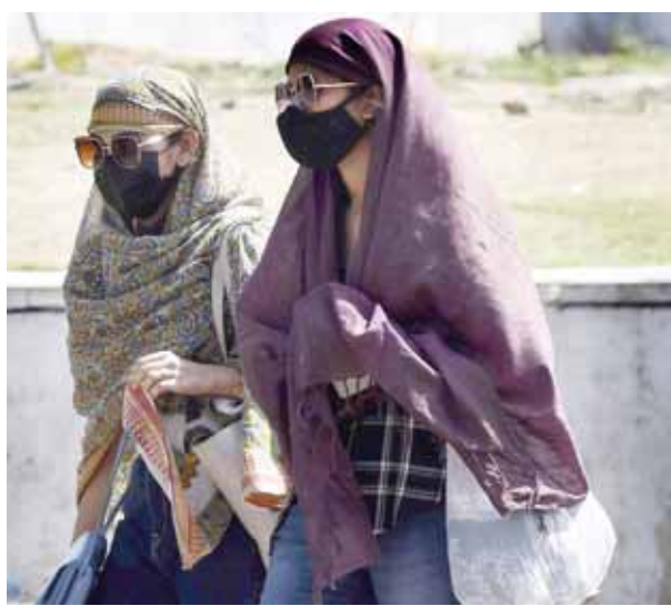
Girls use scarves to shield themselves from the hot summer sun in New Delhi on Tuesday.