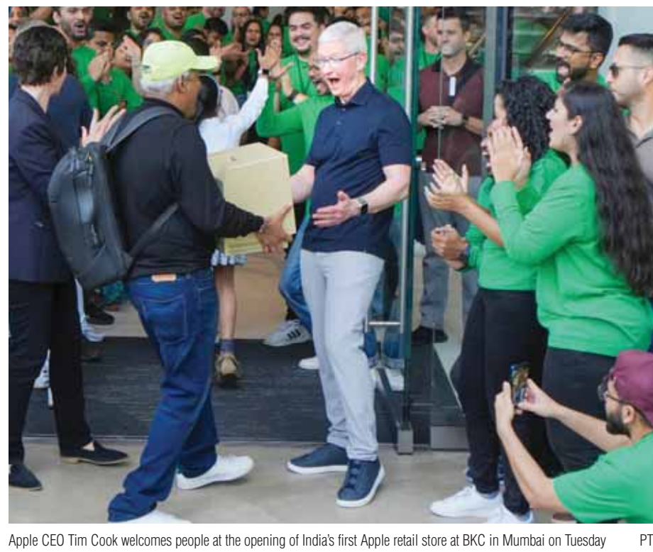
Apple CEO Tim Cook welcomes people at the opening of India's first Apple retail store at BKC in Mumbai on Tuesday.

The National Human Rights Commission (NHRC) has issued a notice to the Uttar Pradesh Police over the killing of gangster-politician Atiq Ahmad and his brother Ashraf by three assailants posing as journalists when they were being escorted by police in Prayagraj, officials said on Tuesday.