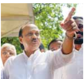
NCP leader Ajit Pawar addresses the media at Vidhan Bhavan in Mumbai on Tuesday.

Scotching speculation that he along with his loyal MLAs in the Nationalist Congress Party (NCP) is set to join the BJP, Leader of the Opposition in the Maharashtra Assembly Ajit Pawar on Tuesday said he would work for his party NCP till he is alive. "There is no truth in reports about any rift in the NCP and my joining hands with the BJP. We (party MLAs) are all with the NCP. I will work for the NCP till I live," said Ajit. He dismissed reports that he had taken the signatures of 40 of 53 MLAs of NCP amid a buzz about his rumoured alliance with the BJP. Ajit said such unfounded reports hurt party workers and create confusion among them. Responding to a query, Pawar said no signatures of (NCP) MLAs were taken. "We