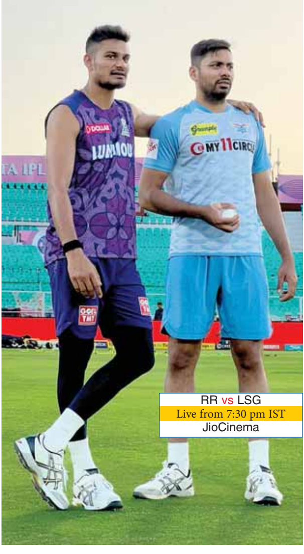
RR vs LSG Live from 7:30 pm IST JioCinema

Medium pacer Sandeep Sharma too has used all his experience, taking wickets regularly during his spells.