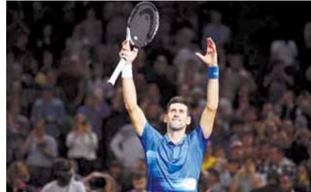
Luca Van Assche, who ousted Swiss veteran Stan Wawrinka 1-6, 7-6 (7/4), 6-4 on Monday, in the Banja Luka second round.

The Serb won the Australian Open earlier this year to draw level with Rafael Nadal's