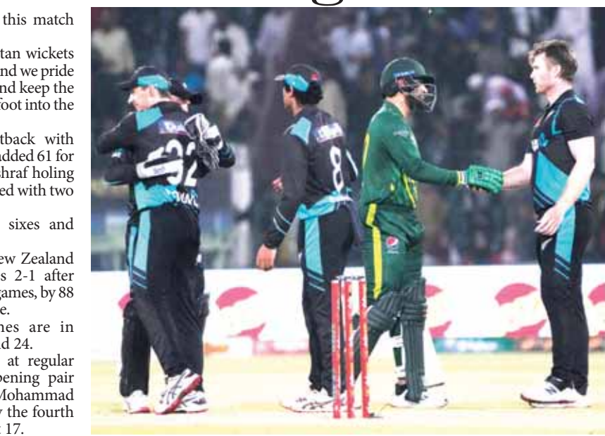
Azam was caught at third man off pacer Adam Milne while Rizwan was found short of his crease after trying to take a sharp single.

Pakistan lost wickets at regular intervals with prolific opening pair Babar Azam (one) and Mohammad Rizwan (six) both gone by the fourth over with the score on just 17.