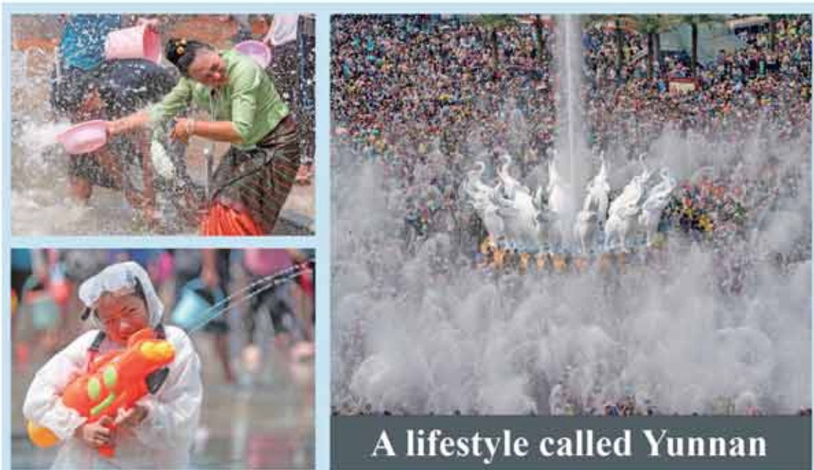
Some Chinese ethnic minorities such as the Dai, Achang, Bulang, Wa, and De'ang and certain ethnic groups in Southeast Asia celebrate the New Year's Day from April 13 to 15. On the 2023 Dai New Year's Day, which fell on April 15, a water-fetching ceremony and a water splashing carnival were held in Jinghong City, Xishuangbanna Dai Autonomous Prefecture, Yunnan Province. Tens of thousands of people from various ethnic groups as well as tourists expressed their best wishes and joy by dashing each other with water.