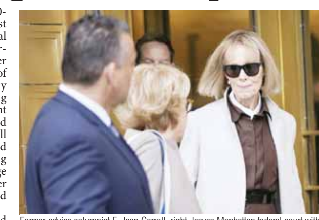
Former advice columnist E. Jean Carroll, right, leaves Manhattan federal court with her attorneys, Tuesday in New York.