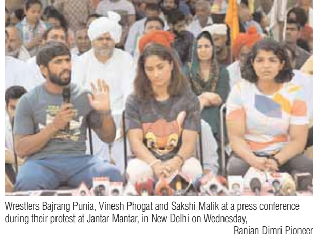
Wrestlers Bajrang Punia, Vinesh Phogat and Sakshi Malik at a press conference during their protest at Jantar Mantar, in New Delhi on Wednesday.