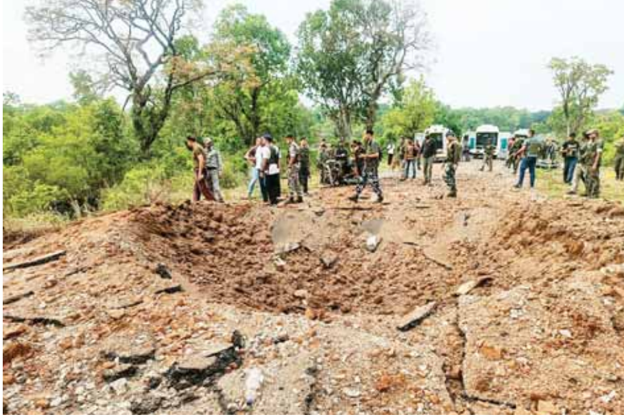
Security personnel at the Maoist blast site in Chhattisgarh's Dantewada district on Wednesday

Union Home Minister Amit Shah spoke to Baghel following the incident. "Anguished by the cowardly attack on the Chhattisgarh police at Dantewada. Have