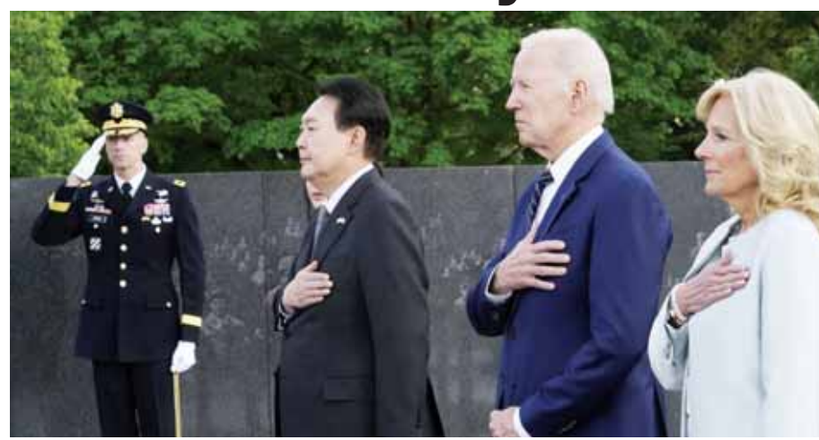
President Joe Biden, first lady Jill Biden, South Korea's President Yoon Suk Yeol and his wife Kim Keon Hee pause after laying a wreath during a visit to the Korean War Veterans Memorial in Washington on Tuesday.

Presidents Joe Biden and Yoon Suk Yeol on Wednesday will sign an agreement that includes plans to have US nuclear-armed submarines dock in South Korea for the first time in more than 40 years, a conspicuous show of support to Seoul amid growing concern about nuclear threats by North Korea, according to senior Biden administration officials.