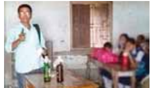
A gunman barges into a classroom of a high school in West Bengal's Malda district on Wednesday

He threatened to blow himself up if action was not taken on his complaints that he had been bringing to the notice of authorities in writing, including the State secretariat. "Even as he was reading