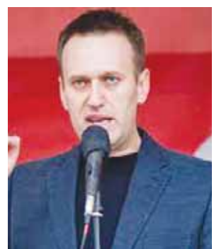
Germany from nerve-agent poisoning that he blamed on the Kremlin. He initially received a 2½-year prison sentence for a parole violation.

Moscow (AP): Russian opposition leader Alexei Navalny said Wednesday that he was facing new extremism and terrorism charges that could land him in prison for life as authorities set the stage for a new trial against the Kremlin's leading critic.