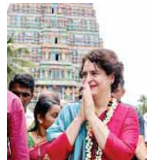
AICC general secretary Priyanka Gandhi Vadra during her visit to the Sringeri Sharda Peeth in Karnataka on Wednesday

Meanwhile, Congress General Secretary Priyanka Gandhi Vadra on Wednesday held a massive roadshow here waving at a large enthusiastic crowd along the route, seeking people’s support for the party in the May 10 Assembly polls in Karnataka.