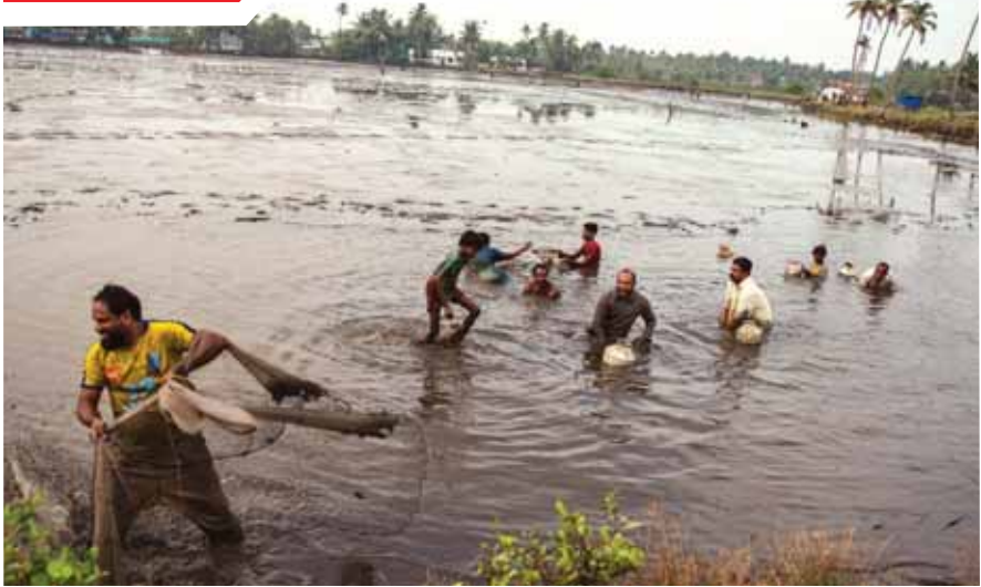
People fish during a tidal swamp at the end of prawn farming season in Kochi