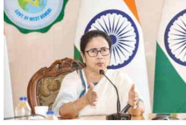
West Bengal Chief Minister Mamata Banerjee holds an administrative review meeting at Nabanna, in Kolkata on Wednesday

“We have all the information of how they are carrying out hooliganism here and attempting to disturb the peace in Bengal... But we will defeat