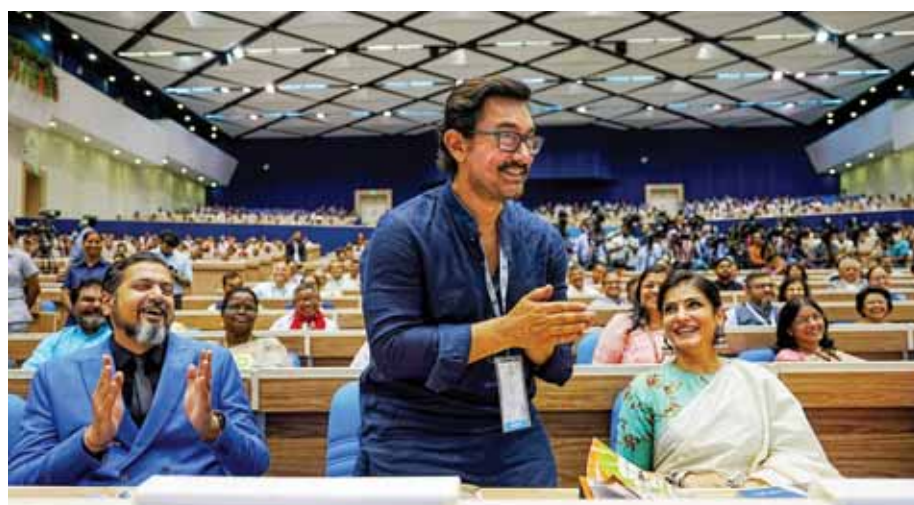
Bollywood actors Aamir Khan and Raveena Tandon with music composer Ricky Kej during the inauguration of a national conclave on 'Mann Ki Baat @100', in New Delhi on Wednesday