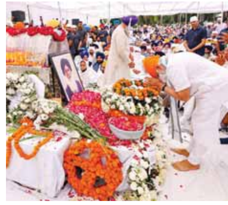
in Muktsar where cremation will take place Thursday afternoon. Modi had on Tuesday described the demise of Badal as a "personal loss" and said he was a colossal figure of Indian politics who contributed greatly to the nation.

Prime Minister Narendra Modi on Wednesday paid floral tributes to five-time Punjab chief minister Parkash Singh Badal at the Shiromani Akali Dal office here.