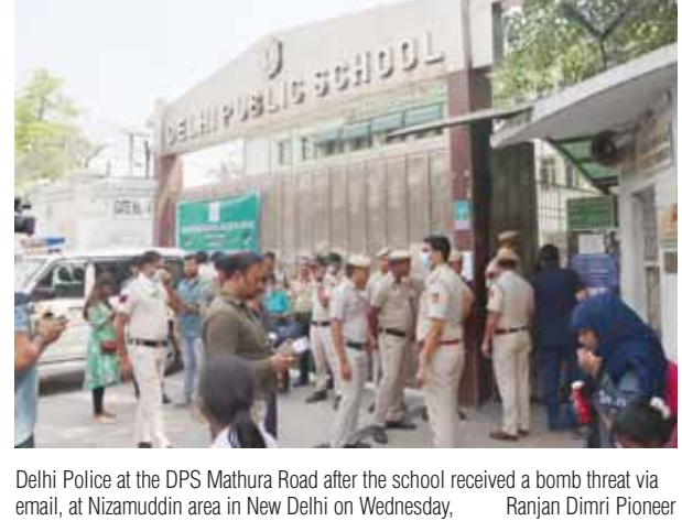
Delhi Police at the DPS Mathura Road after the school received a bomb threat via email, at Nizamuddin area in New Delhi on Wednesday.

Delhi Public School, Mathura Road, received a bomb threat early on Wednesday morning. Information about a bomb being placed in the school was received through email. This is the second school in the national capital which received a bomb threat in the past 15 days. According to police, no suspicious object was found during an intensive search on the premises of the Delhi Public School in Mathura Road.