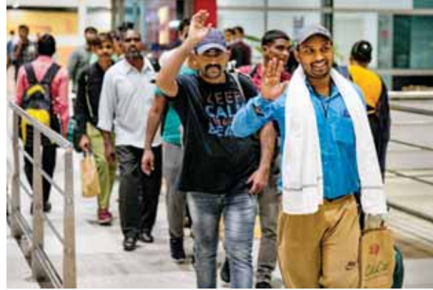
Indians evacuated from violence-hit Sudan under Operation Kaveri on their arrival at the IGI Airport in New Delhi on Wednesday night

Moreover, stepping up the tempo of evacuation, an Indian Navy ship INS Teg is now stationed at Port Sudan to bring back Indians from there to Jeddah. INS Sumedha has already disembarked 278 Indians from there to Jeddah.