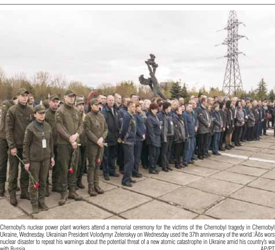
Chernobyl's nuclear power plant workers attend a memorial ceremony for the victims of the Chernobyl tragedy in Chernobyl, Ukraine, Wednesday. Ukrainian President Volodymyr Zelenskyy on Wednesday used the 37th anniversary of the world's worst nuclear disaster to repeat his warnings about the potential threat of a new atomic catastrophe in Ukraine amid his country's war with Russia.