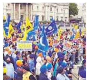
group "hijacking" the Sikh faith to push a subversive pro-Khalistan narrative. "There is a small, extremely vocal and aggressive minority of British Sikhs who can be described as pro-Khalistan extremists, promoting an ethnonationalist agenda," notes the review.

London (PTI): A major independent review commissioned by the British government into engagement with faith groups on Wednesday warned against the "subversive, aggressive and sectarian" actions of some pro-Khalistan activists and called for action to ensure such groups are not unwittingly allowed access to the UK's Parliament.