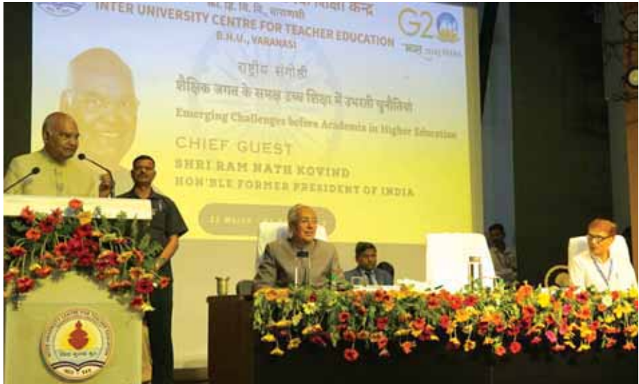
Former President Ram Nath Kovind addressing a seminar at IUCTE in Varanasi on Friday.