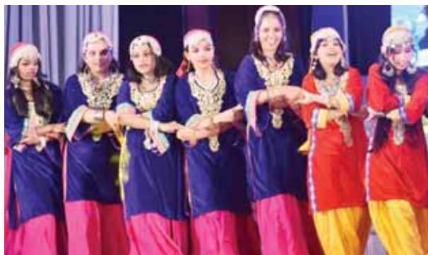
Students performing at the Divine Education Conference of CMS, Rajendra Nagar Campus II, on Friday