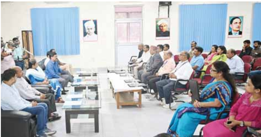
A farewell function being held in BLW, Varanasi on Friday.