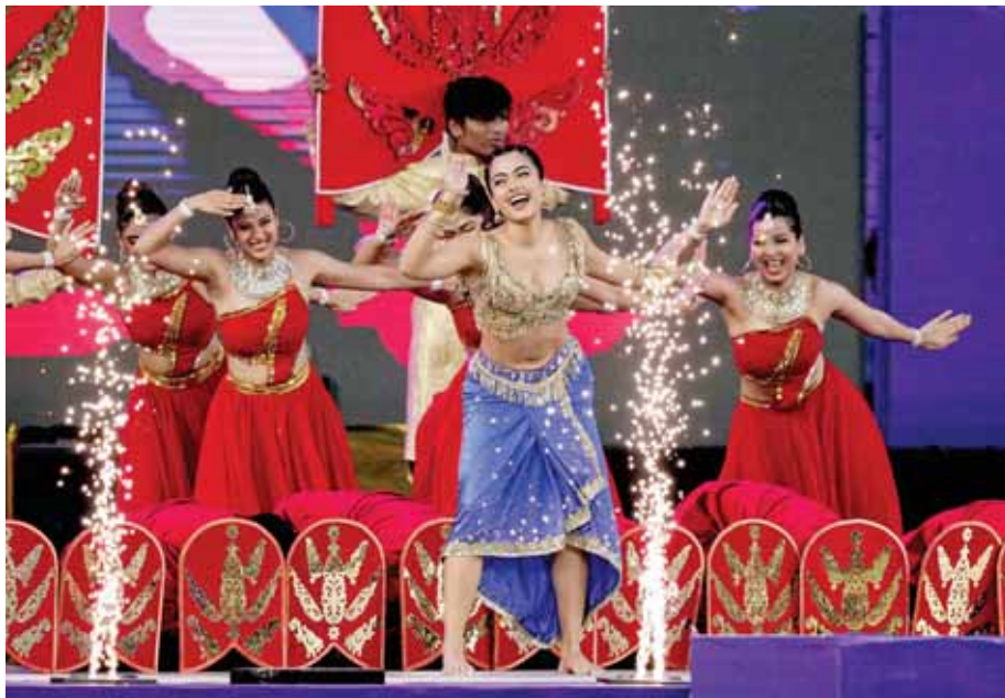
Actress Rashmika Mandanna performs during the IPL 2023 opening ceremony at in Ahmedabad on Friday

During the broadcast, despite the blue of Gujarat Titans being largely visible, it was thoroughly outsmarted by the yellow of Chennai Super Kings, with the decibel level going high whenever MS