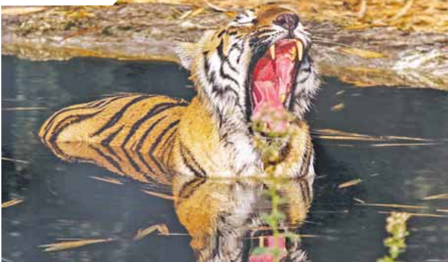
A tiger cools itself in a pond on a hot day, at Maharajbagh Zoo in Nagpur