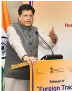
Union Minister for Commerce &amp; Industry, Consumer Affairs, Food &amp; Public Distribution and Textiles Piyush Goyal addresses at the release of 'Foreign Trade Policy 2023' in New Delhi on Friday