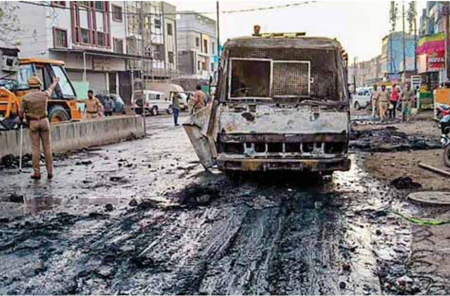
Charred remains of a vehicle after a clash between two groups near a Ram temple in Aurangabad, on Thursday.

While nearly 300 persons have been booked, police have arrested 21 persons so far and more arrests are likely, the official said, adding that probe in the case underway. In the FIR, police have pressed charges under Indian Penal Code sections 353 (assault or use of criminal force to deter a public servant from discharge of his duty), 324 (voluntarily