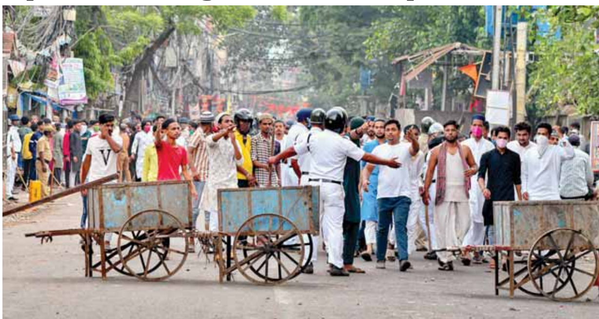
Police cordon off an area after clashes broke out between two groups during a 'Ram Navami' procession on Thursday at Kajipara, in Howrah district on Friday

West Bengal Chief Minister Mamata Banerjee and Governor CV Ananda Bose reviewed the situation and prohibitory orders were imposed. Union Home Minister Amit Shah also dialled the West Bengal Governor to enquire about the security situation in the town situated across the Hooghly river opposite Kolkata.