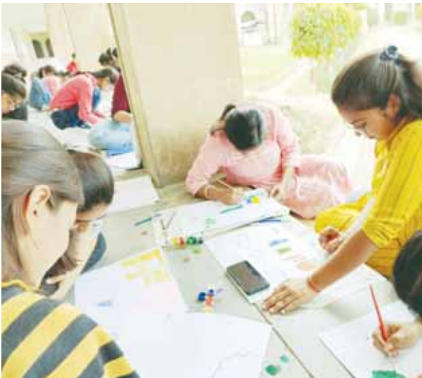
CSAUAT girls taking part in the poster making contest as part of the Swachh Bharat Abhiyan launched under NSS on Friday.