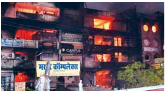
Firefighters douse a fire which broke out in AR Tower next to Hamraj market in Kanpur on Friday.

At least 500 shops were gutted in a massive fire that broke out in a multi-storey commercial building and quickly spread to adjacent towers in Bansmandi area here early on Friday, a senior official said. Prime facie the fire broke out due to a short circuit following a massive dust storm. The blaze started at 2 am in AR Tower also known as Afaq Rasool Tower and spread to Maqsood, Humraz complex and Nafees towers charring about 500 shops located in these four towers, the official said, adding strong winds fanned the flames. According to the senior official, goods and cash worth about ₹100 crore were gutted