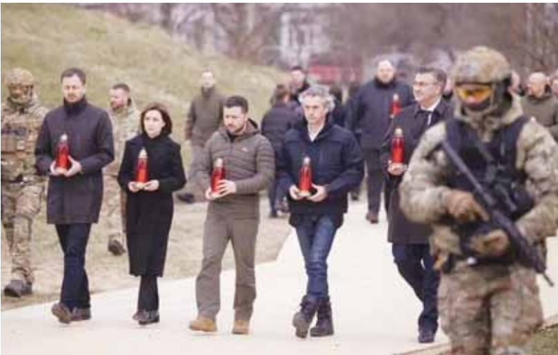
Members of the Ukrainian State Emergency Service clear the rubble at the building which was destroyed as a result of Russian strike in Zaporizhzhia district, Ukraine on Friday.

The Kremlin's forces occupied Bucha weeks after they invaded Ukraine and stayed for about a month. When Ukrainian troops retook the town, they encountered horrific scenes. Over weeks and months, hundreds of bodies were uncovered, including children. Russian soldiers on intercepted phone conversations called it "zachistka" — cleansing, according to an investigation by The Associated Press and the PBS series "Frontline." Such organized cruelty, which Russian troops employed in past conflicts as well, notably in Chechnya, was later repeated in Russia-occupied territories across Ukraine. Zelenskyy handed out medals to soldiers, police officers, doctors, teachers and emergency workers in Bucha, as well as to the families of two soldiers killed during the defense of the Kyiv region. "Ukrainian people, you have stopped the biggest anti-human force of our times," he said. "You have stopped the force which has no respect and wants to destroy everything that gives meaning to human