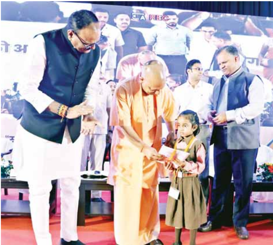
Chief Minister Yogi Adityanath giving away text book to a schoolgirl during the launch of 'School Chalo Abhiyan' at Lok Bhawan in Lucknow on Saturday

The chief minister went on to say that Uttar Pradesh has long been the centre of India's knowledge, science and spirituality. "The actions taken by the state government over the past six years are now showing results in every field. On July 1, 2017, we launched the School Chalo Abhiyan in Kukrail. This