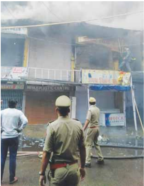
Massive fire broke out in Nehru Complex located at densely populated area of Chowk in Prayagraj

Clock Tower and Chowk area is the densest and congested area of the city. People from all over the district come here to buy everything including clothes. Every day a crowd of lakhs of people gather here. Shopkeeper Mohd Rauf told the police that the transformer is right next to the Nehru Complex. There was a short circuit in the transformer at