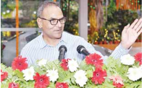
GM CORE addressing officials at Headquarters.

Secundrabad unit of CORE contributed 1050 RKM which is the highest ever electrification in the history of any project unit. This was followed by