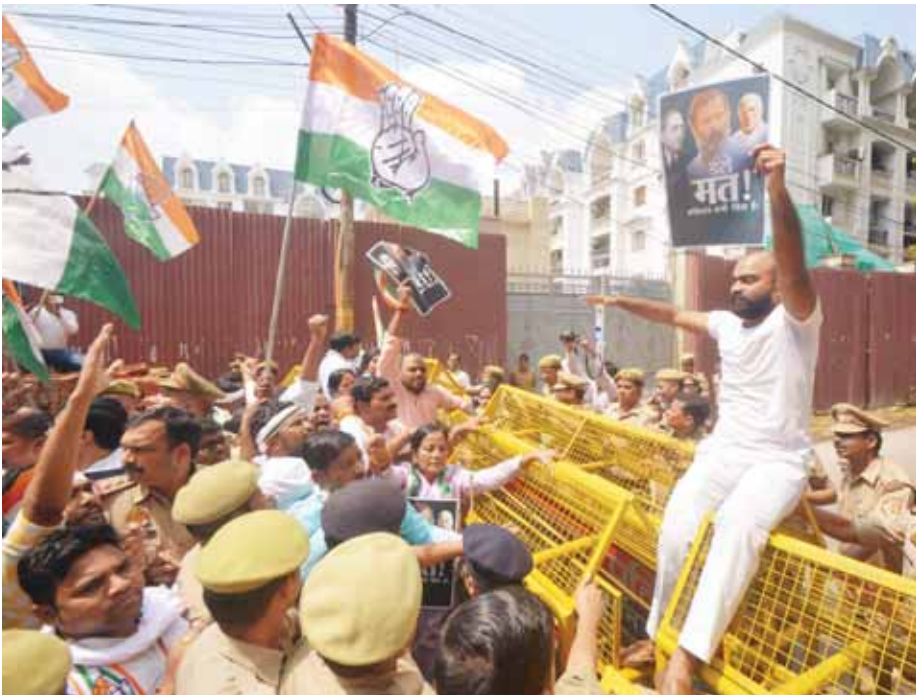
Congress workers of SC/ST, OBC and minority wing protesting outside the party headquarters in Lucknow on Saturday in support of beleaguered former MP Rahul Gandhi