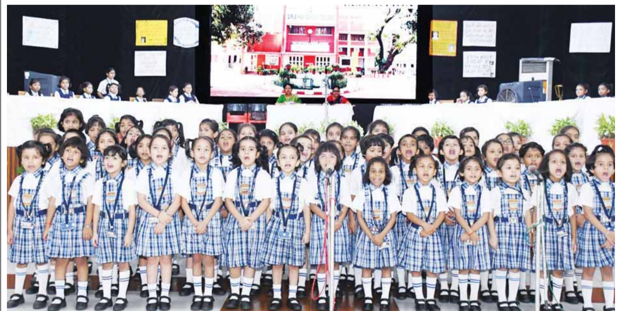
Hindi Elocution held at GHS & College, Prayagraj