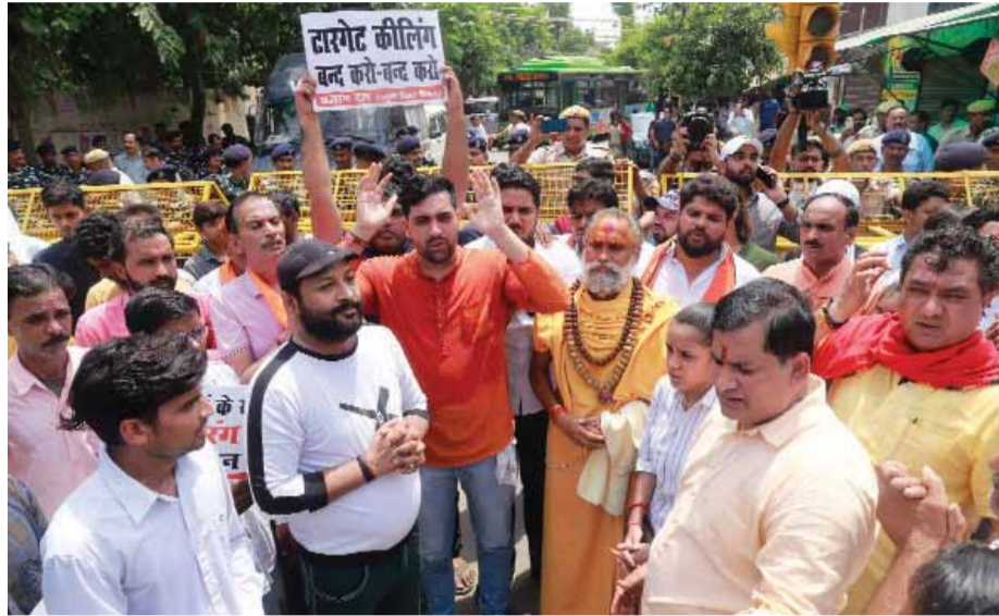
A protest march against the violence that erupted in Haryana's Nuh district, in Delhi on Wednesday

The VHP also held a demonstration in Uttar Pradesh's Noida, violating pro-