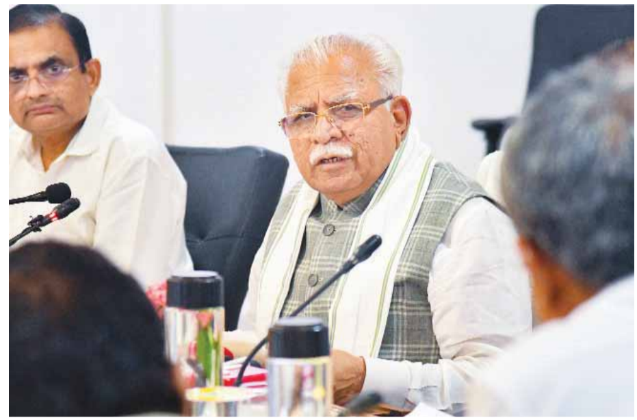
Haryana Chief Minister Manohar Lal addresses a press conference, at Haryana Niwas in Chandigarh, on Wednesday