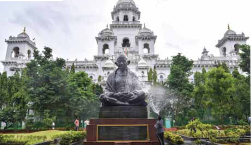
Workers clean the Gandhi statue ahead of the Assembly session, in Hyderabad