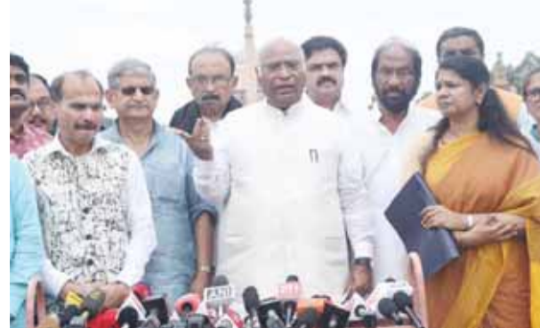
Leader of Opposition in the Rajya Sabha Mallikarjun Kharge with other I.N.D.I.A leaders address a press conference after a meeting with president Droupadi Murmu at Rashtrapati Bhavan, in New Delhi, on Wednesday

After the meeting with the President, Congress chief