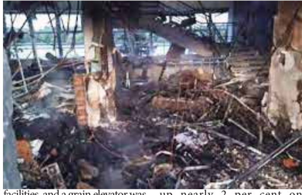
facilities, and a grain elevator was damaged.

The head of the Ukrainian president's office, Andriy Yermak, said the city of Izmail was hit in the strikes. Izmail is on the Danube River that forms part of the Ukraine-Romania border. Video obtained by The Associated Press showed explosions and a large fire in the distance on the Danube, captured by fishermen in Romania, a NATO member, on the other side of the river. Three Ukrainian ports along the Danube are currently operating. "The goal of the enemy was clearly the facilities of the ports and industrial infrastructure of the region," Ukraine's South operational command wrote in an update on Facebook. As a result of the attack, a fire broke out at industrial and port