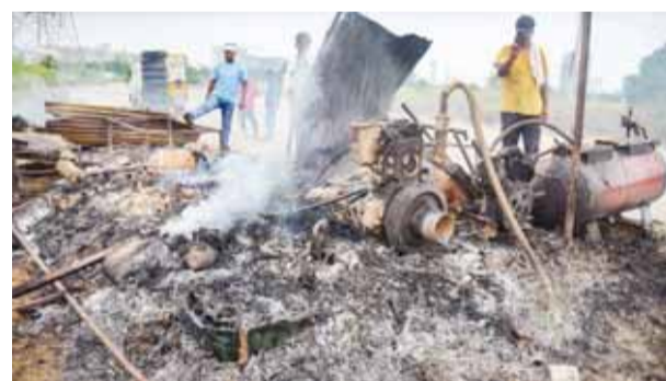
Locals look at burnt items at a shop which was set ablaze by miscreants in a fresh case of communal violence after Monday's attack on a VHP procession in adjoining Nuh district, in Gurugram, on Wednesday

Coming back to the atmosphere, the bench set up by the CJI said, said, "During the course of hearing, it is