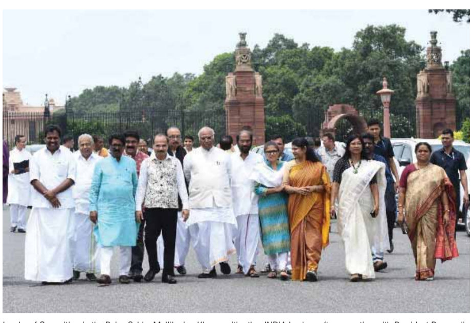
Leader of Opposition in the Rajya Sabha Mallikarjun Kharge with other INDIA leaders, after a meeting with President Droupadi Murmu at Rashtrapati Bhavan, in New Delhi on Wednesday