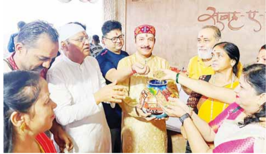
Meri Mati Mera Desh campaign being held at Assi Ghat in Varanasi on Wednesday.