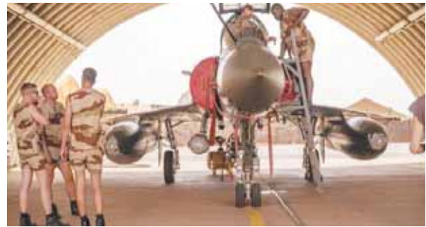
French Barkhane Air Force mechanics maintain a Mirage 2000 on the Niamey, Niger base, on June 5, 2021. On Thursday night, the junta said on state television it was terminating the military agreements and protocols signed with its former colonial ruler.

The junta's announcement on state television late Thursday deepens the post-coup isolation for what had been the United States' and allies' last major security partner in the Sahel, the vast region south of the Sahara Desert that various Islamic extremist groups have turned into the global centre of terrorism. With two days