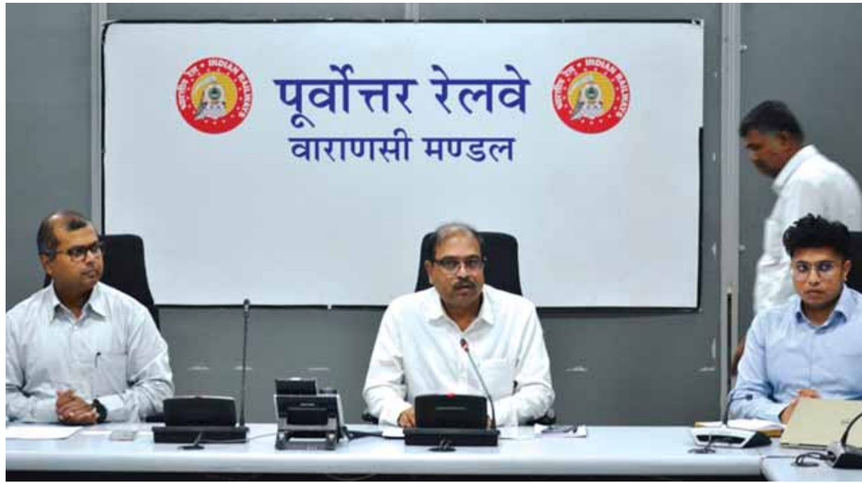
DRM NER VK Srivastava addressing a press conference in Varansi on Friday

The DRM said under the ABSS, passenger facilities will be improved and expanded at Banaras station, the same will be done at a cost of over ₹53 crore. According to him, the first entrance will be given a more attractive look and the circulating area will be improved. "Under this scheme, work will be done to widen the approach road of Banaras station, improve the drainage system in the circulating area of the first entrance, construct state-of-the-art toilet facilities and improve the service build-