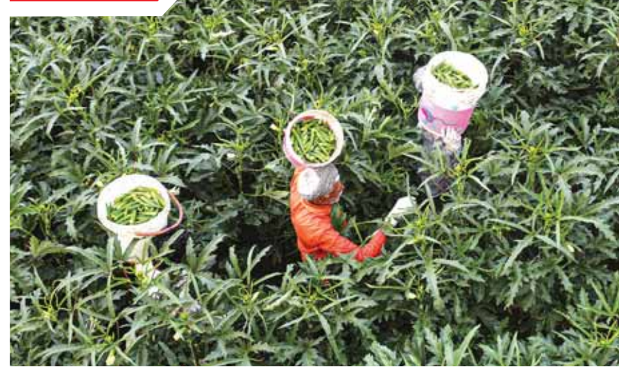
A farmer plucks ladyfingers at a field, at Kanachak area on the outskirts of Jammu