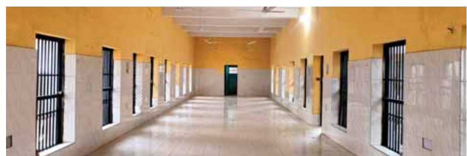
A new barrack for women prisoners ready at District Jail in Varanasi.