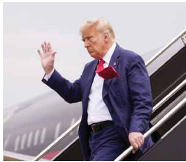
Former President Donald Trump waves as he steps off his plane at Ronald Reagan Washington National Airport, Thursday in Arlington, Va., as he heads to Washington to face a judge on federal conspiracy charges alleging Trump conspired to subvert the 2020 election.

Trump spoke little during the hearing, answering ques-