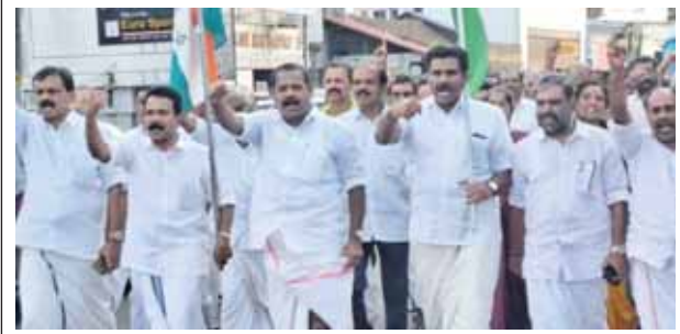
PTI ■ WAYANAD

Sweets came out first, much before jubilant Congress workers took out rallies -- many of them dancing -- in all the seven Assembly constituencies of the Lok Sabha segment to celebrate the legal victory of the "Prince of Wayanad". The scenes were more or less the same across the constituency on Friday, 4 August, soon after television channels aired the Supreme Court verdict, staying the Surat trial court's conviction of Rahul Gandhi in the 2019 "Modi surname" defamation case.