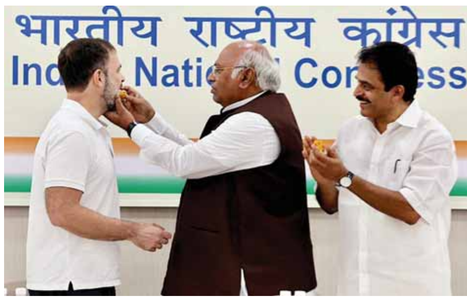
Congress leader Rahul Gandhi with party chief Mallikarjun Kharge at AICC headquarters

"Had the sentence been one day shorter, these provisions would not have been applicable, especially considering that the offence is non-cognizable, bailable, and com-