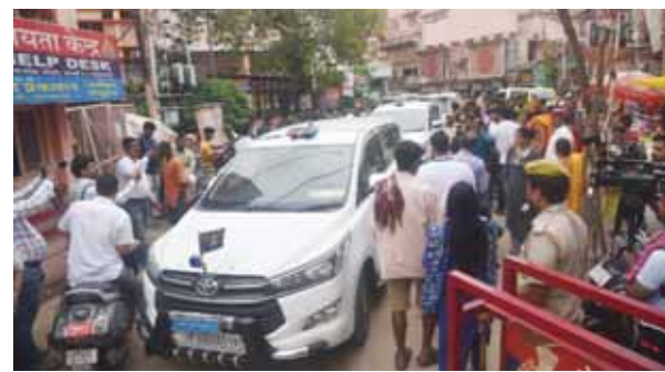
A team of ASI arrives to conduct scientific survey of the Gyanvapi premises, in Varanasi, on Friday. ASI began survey to determine whether the 17th-century mosque was constructed over a pre-existing structure of a Hindu temple

Solicitor General Tushar Mehta, representing the ASI and the Uttar Pradesh Government, assured the court