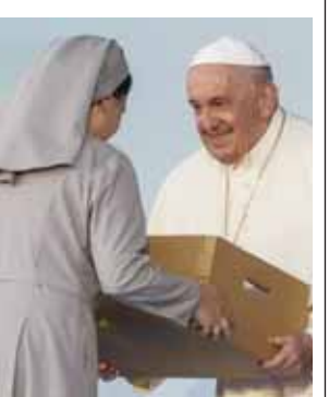
A nun offers Pope a box of letters from the youths, during a gathering at the Eduardo VII Park with young people participating into World Youth Day, in Lisbon on Thursday.

Pope Francis visited a once troubled and crime-plagued neighbourhood of Portugal's capital on Friday to draw attention to the charitable side of the Catholic Church and the need to protect the world's most vulnerable people with concrete gestures that "get your hands dirty". The midday point in Francis' five-day visit to Portugal began with the pontiff hearing confessions of some young people who were in Lisbon for World Youth Day. The big Catholic youth festival will end Friday with a traditional Way of the Cross procession recreating Christ's crucifixion. Francis visited a community centre in the city's Serafina neighbourhood, which sits beneath a giant 18th-century aqueduct that is a symbol of the bounty that gold from Portugal's Brazilian colony once afforded the country. Two decades ago, drug and crime problems dogged the neighbourhood, but it has largely left them behind thanks in part to efforts by church charity groups,