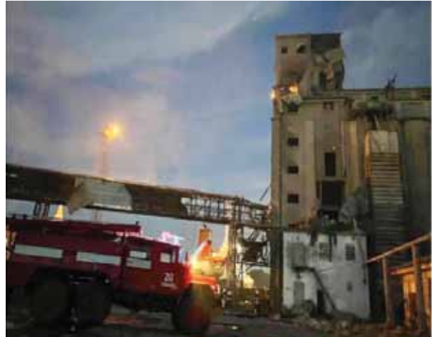
In this photo provided by regional Governor Oleh Kiper rescuers work on a scene of drone attack in Odesa region, Ukraine, early Wednesday. File photo

Ukrainian sea drones attacked a major Russian port Friday, damaging a naval ship, according to a Ukrainian official, as the Black Sea becomes an increasingly important battleground in the war. Moscow claimed it repelled the attack.