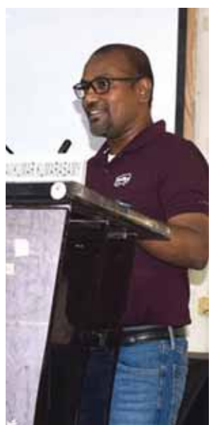
A technology industry expert delivering a lecture at IM-BHU in Varanasi on Thursday.

"Rapid advancements in technology have reshaped industries, societies and economies worldwide, driving the need for strong and effective leaders who can navigate through," he said. Focusing on organisational culture, he quot-