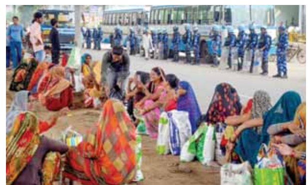
A group of women sits on a roadside as RAF personnel stand guard to maintain law & order during Friday prayers, at Badshahpur area in Gurugram on Friday