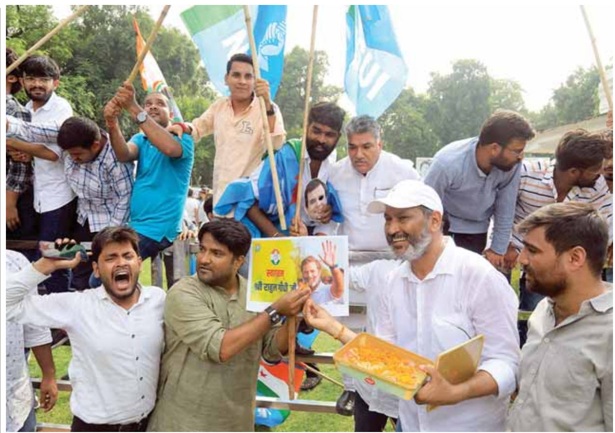
Congress workers celebrate after the Supreme Court stayed the conviction of party leader Rahul Gandhi in the 2019 criminal defamation case over his 'Modi surname' remark, restoring his status as an MP, in New Delhi on Friday.

"No untoward incident was reported from Gurugram as we had earlier appealed to people to offer Friday prayers from home and nearby mosques," he said. Staff Reporter