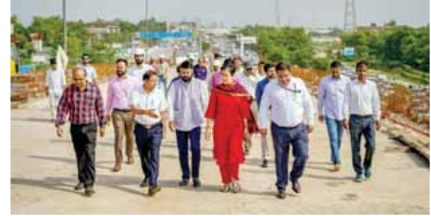
Delhi Minister Atishi inspects construction work of Sarai Kale Khan flyover, in New Delhi on Monday.

She reprimanded the officials responsible for the delay and issued a clear ultimatum that the remaining work must be completed within one month, or they will face appropriate action. Highlighting the significance of the flyover project in decongesting the busy Sarai Kale Khan T-junction and Ring Road, Atishi directed