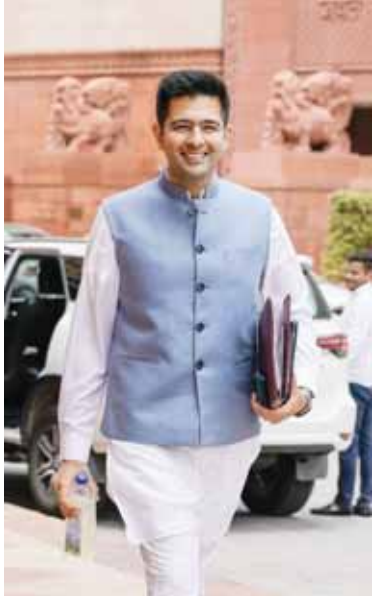
AAP MP Raghav Chadha at Parliament House complex during the Monsoon Session, in New Delhi, on Monday.

However, Chadha argued that the newly-introduced Ordinance undermines this accountability structure by transferring control from the elected