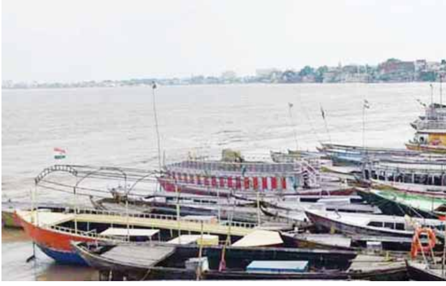
Water level of river Ganga continues to rise in Varanasi on Monday.

The speed of rising trend of river Ganga, which was increasing at an alarming pace of 10 cm per hour a day ago, has been slowed down in Varanasi as it was recorded rising at four cm per hour during the day as per the report of Middle Ganga Division-III of Central Water Commission (CWC). During the 24 hours, the water level has increased by 1.34 metres, rising from 66.52 metres to 67.86 metres as recorded at 8 am on Monday.