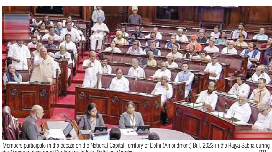
Members participate in the debate on the National Capital Territory of Delhi (Amendment) Bill, 2023 in the Rajya Sabha during the Monsoon session of Parliament in New Delhi on Monday.

Former Chief Justice of India and nominated member Ranjan Gogoi said the bill is “perfectly legitimate” and power of parliament in framing legislation is not in question. The Lok Sabha has already passed the bill. Initiating the debate, Congress member Abhishek Manu Singhvi said the bill was “retrogressive” and “control freak” besides anti-federal. Pointing flaws in the bill, he said it eliminates accountability of the bureaucracy and make the elected chief minister powerless. Claiming the bill was an attempt to grab power from the backdoor, Singhvi also said it was an insult of the