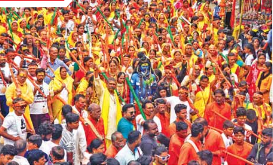
Lord Shiva devotees 'Kanwariyas' carry holy water from the Narmada river, in Jabalpur