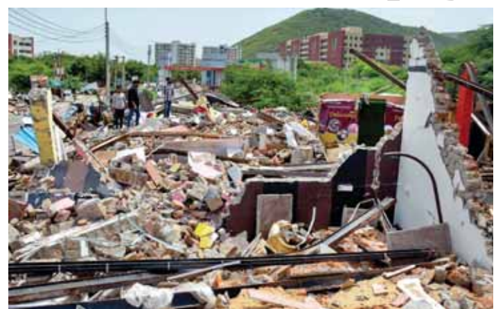
Shopkeepers look at the debris of their shops demolished by the administration in a drive against illegal construction, in Nuh district, on Monday