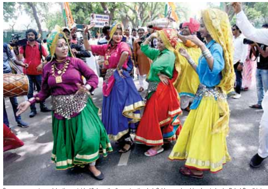
Congress supporters celebrating outside 10 Janpath after restoration Lok Sabha membership of party leader Rahul Gandhi, in New Delhi on Monday.

Yet, when farmers sold their lands for these projects, they received compensation