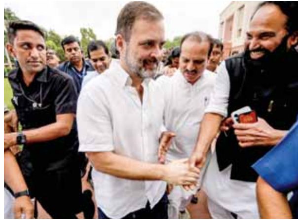
Congress MP Rahul Gandhi being greeted on arrival at Parliament House complex on Monday

After paying tributes to Mahatma Gandhi's statue, Rahul briefly attended the Lok Sabha proceedings, which were