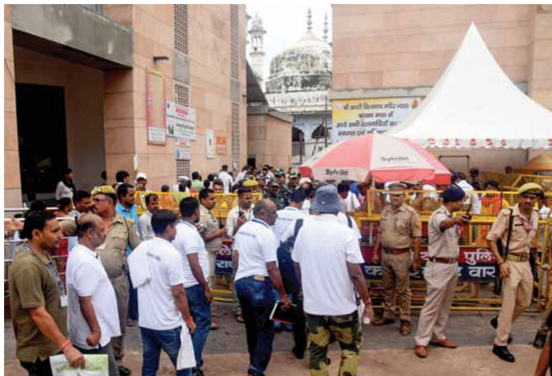
A team of ASI arrives to conduct scientific survey at the Gyanvapi mosque complex, in Varanasi on Monday

New Delhi: A 22-year-old makeup artist died after the car in which she was travelling was crushed between two trucks in north Delhi's Civil Lines area.