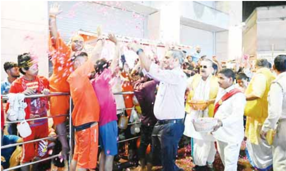
KVT officials showering flowers on devotees at corridor premises in Varanasi on Monday.

In view of the heavy rush, elaborate security arrangements were made and no vehicles were allowed to move between Godowlia and Maidagin throughout the day. To maintain law and order, the