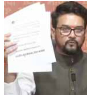
Enforcement Directorate's (ED) raids on NewsClick in 2021.