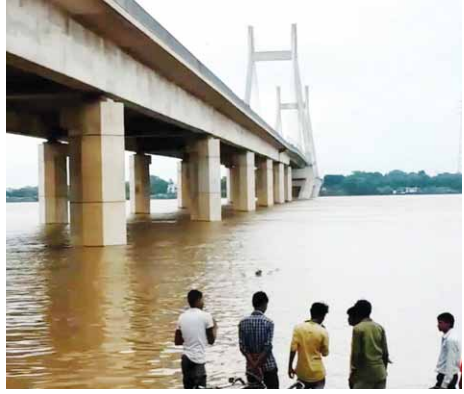
Flooded Yamuna in Prayagraj

During the past 24 hours both the rivers recorded a rise of over one metre owing to moderate showers all over but