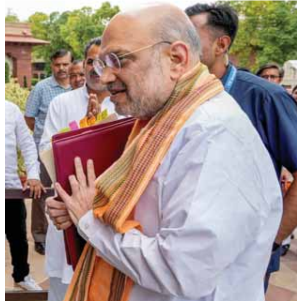
Union Home Minister Amit Shah arrives at Parliament House complex during the Monsoon Session, in New Delhi on Monday

During the voting process, a dramatic situation unfolded