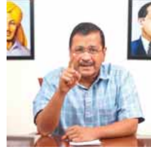
Delhi Chief Minister Arvind Kejriwal reacts on the passage of the Government of National Capital Territory of Delhi (Amendment) Bill, 2023 by the Rajya Sabha, in New Delhi, on Monday.

Kejriwal tweeted on the development and said, "The farmers of Delhi have been demanding for a long time that the rates of their agricultural