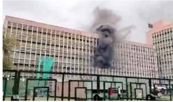
Firefighters at the site after a fire broke out in the endoscopy room on the second floor of the All India Institute of Medical Sciences, in New Delhi on Monday.

In a statement, AIIMS said security and fire control rooms were informed when information about the blaze out on the second floor of the old Raj Kumari Amrit Kaur OPD in the main AIIMS building was