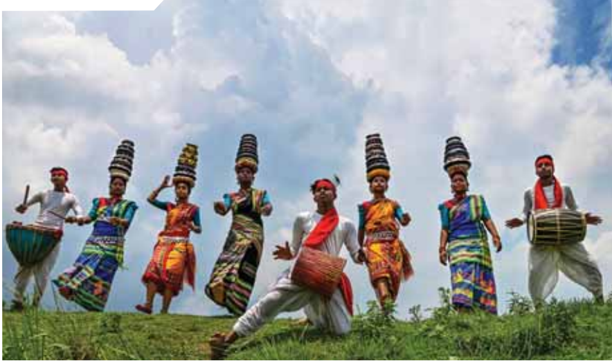
Tribal people perform a cultural dance on the International Day of the World's Indigenous Peoples, in Nadia