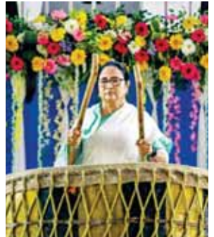
ple of India forced the British to quit India, Banerjee said "we had asked the British to quit India... they were made to quit this country by our freedom fighters ... Today a time has come when we the people of this country want the BJP-led government at the Centre to quit Delhi ... because they have not only failed to perform but during this regime the woes of the common man have gone up several times... we don't need you ... please go ... we will make you go ... this is our pledge."

On a day when her partners in the united INDIA alliance were taking on the BJP Government inside Parliament, Bengal Chief Minister Mamata Banerjee on Wednesday gave out a call to make the saffron outfit 'quit India'.