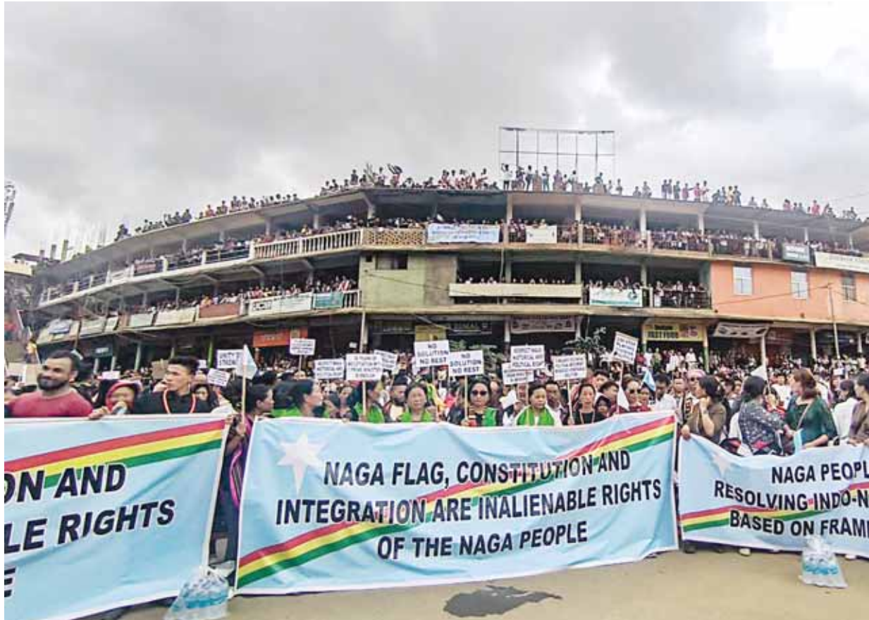
Naga community people participate in a rally organised by the United Naga Council (UNC) seeking a solution for the Indo-Naga political issue based on the Framework Agreement, on Wednesday

New Delhi: The Union Cabinet on Wednesday approved changes to GST laws to levy a 28 per cent tax on the full face value of bets in online gaming, casinos and horse race clubs.