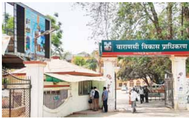
Varanasi Development Authority office.

Varanasi Development Authority (VDA), a government department responsible for the planned development of this parliamentary constituency of Prime Minister Narendra Modi, is itself playing against the people's faith. It had advertised, displayed maps of a colony, sold plots and even did the registration of the allottees' land but a recent court order indicates that the VDA has just 'cheated' the allottees as it sold plots on the land which is owned by others. After paying full payment and many of them, on the permission of VDA, took loans from the financial institutions, these disheartened allottees are still landless.