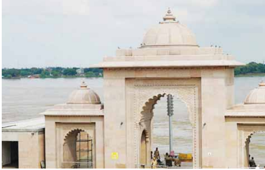
Water level of river Ganga starts receding in Varanasi on Wednesday.

The water level of river Ganga has started receding fast as the recent rise was mainly due to flood in the river Yamuna and rains in Delhi, Haryana and hilly region of the north. During the last 24 hours, the river water level has increased slightly by eight cm before starting receding two cm per hour. However, in the upstream the declining trend was high as the river was receding at the speed of 11 cm per hour at Phaphamau, six at Prayagraj (Sangam) and three at Mirzapur. According to Middle Ganga Division-III of Central Water Commission (CWC), the river was recorded at 67.96 metres against the warning level of 70.262 metres at 8 am on Wednesday.