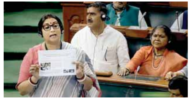
Union Minister Smriti Irani speaks on the Motion of No-Confidence in the Lok Sabha in New Delhi on Wednesday

However, Irani strongly criticised the action, deeming it a "misogynistic act" and asserted that only a person with