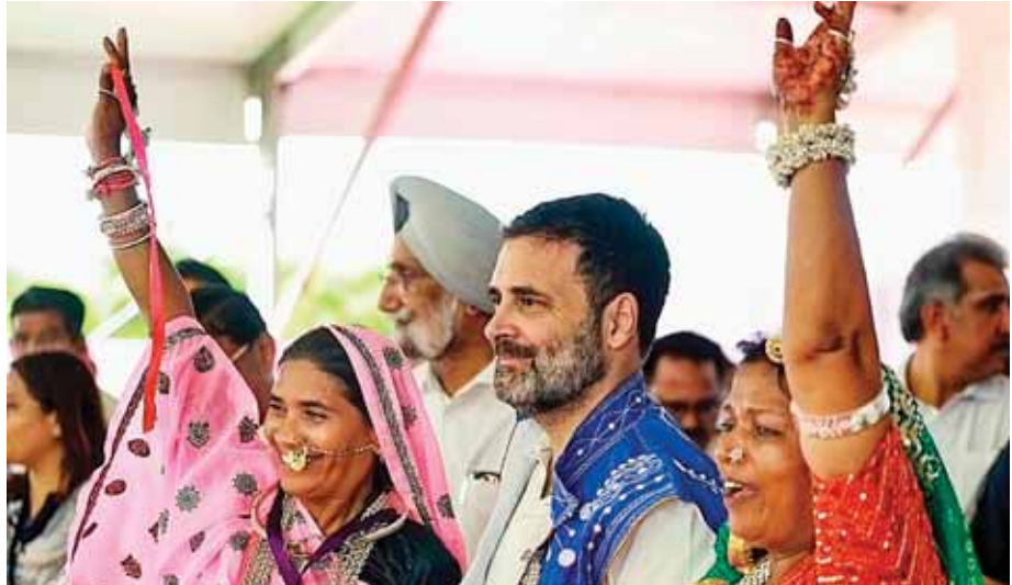
Vanvasi, which means you are not the original owners of this country and you live in the jungle. This is an insult to you. This is an insult to Bharat Mata," he told the gathering of largely tribal people. "You are not Vanvasi, you are Adivasi. BJP and RSS want you to stay in the forest only...(they want that) your children should not become engineers, doctors, lawyers, businessmen. They want...To take away your rights and land," he said. He said the BJP calls tribal people "Vanvasi, snatches

gation that the politics of the BJP has "murdered Bharat Mata" in Manipur. The rally in Mangarh Dham in Rajasthan's Banswara district, organised on the occasion of World Tribal Day, marked the beginning of the Congress campaign for the assembly polls in Rajasthan later this year. Gandhi criticised the BJP for calling tribal people "Vanvasi" instead of Adivasi, saying that it's an insult to them. The country's land used to belong to Adivasi and they were its original owners, he said, adding the BJP coined a new word, "Vanvasi", which means the ones who live in the forest. "We call you Adivasi, this country is yours.... They (BJP) say you are not Adivasi, you were not the first inhabitants of India, they say you are