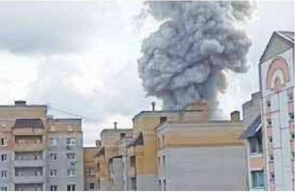
AP ■ TALLINN (ESTONIA)

An explosion on Wednesday on the grounds of a factory north of Moscow that makes optical equipment for Russia's security forces injured 56 people, six of them severely, officials said. The blast occurred at a warehouse storing fireworks, though it was on the grounds of the Zagorsk optics manufacturing plant, according to Andrei Vorobyov, the governor of the region surrounding the Russian capital. Vorobyov said the company had rented out the warehouse for storage, but later claimed the plant itself was mostly producing pyrotechnics.