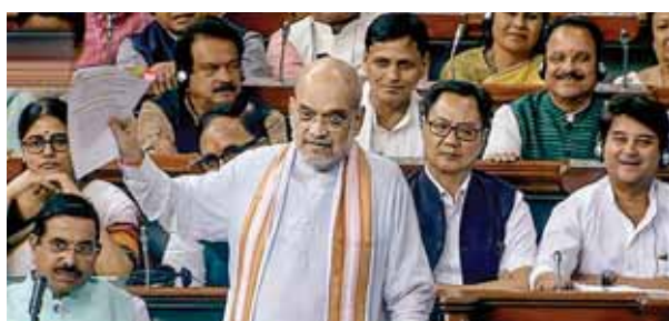
Union Home Minister Amit Shah speaks in the Lok Sabha during the Monsoon session of Parliament, in New Delhi on Wednesday

"I agree that there have been incidents of violence in Manipur. No one can support such incidents. Doing politics on these incidents is shameful. From day one, I was ready for a discussion on the Manipur issue, but the Opposition never