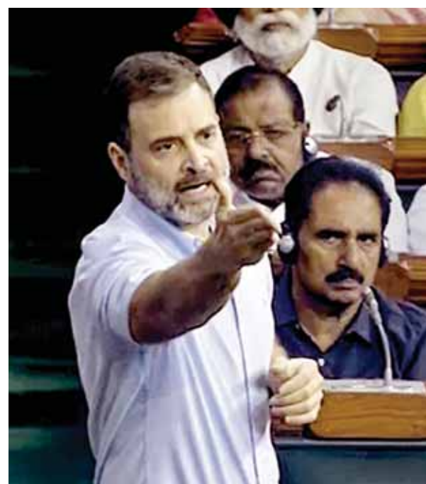
MP Rahul Gandhi speaks on the Motion of No-Confidence in the Lok Sabha during the Monsoon session of Parliament in New Delhi on Wednesday

Targeted by the ruling party often during his speech, Rahul slammed the Prime Minister for not visiting Manipur. "Modi has not gone to Manipur because he (PM Modi) doesn't consider it a part of India. You (BJP) have divided Manipur," Rahul said, amid loud protests from the treasury