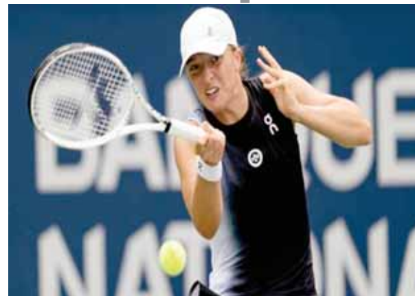
Iga Swiatek (left) holds off Karolina Muchova to reach the quarter-finals of the WTA Montreal Open.

That would be all Swiatek needed, and she polished off the victory with a love game.