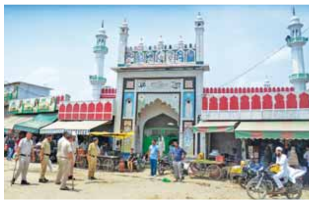
Police personnel stand guard outside a mosque during Friday prayers, in violence-hit Nuh district

The 'Mahapanchayat' in this regard was called in Hisar to condemn the Nuh riots. The gathering was attended by 2,000 people including several Haryana Khap panchayats, farmers unions, and religious leaders of different communities. "We demand a fair investigation into the matter and we