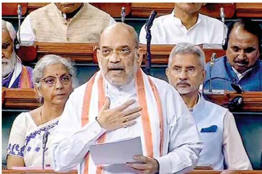
Home Minister Amit Shah speaks in the Lok Sabha during the Monsoon session of Parliament in New Delhi on Friday.

Describing the Bills as "revolutionary", the Home Minister stated that the repealed laws dating back to 1860 were meant to "strengthen British raj" and