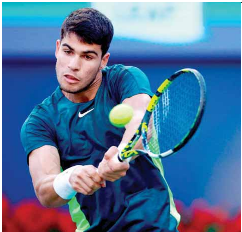
Carlos Alcaraz (left) battles into the quarter-finals of the ATP Toronto Masters.

"I was in trouble serving for the match - I don't know how I won," he said after winning his 19th Masters 1000 match from 21 played this season.