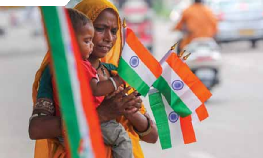
A woman sells miniature Indian flags ahead of the Independence Day celebration, in Jammu