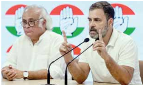
Congress leaders Rahul Gandhi and Jairam Ramesh address a press conference in New Delhi on Friday.

Rahul emphasised that the discussion should have focused on the serious issue at hand instead of taking jibes at the Congress or himself. "The