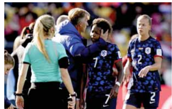
Andries Jonker (left) talks to his players after the Netherlands' quarter-final loss to Spain.

tears after the full-time whistle, having conceded the winner in extra time to teenager Salma Paralluelo.