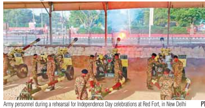
Army personnel during a rehearsal for Independence Day celebrations at Red Fort, in New Delhi

"There were certain restrictions over the last couple of years due to COVID-19. However, Independence Day will be celebrated with full enthusiasm this year. Therefore,