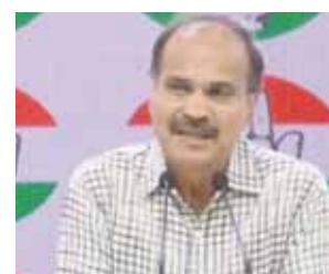
Chowdhury referred to Prime Minister Narendra Modi as "Nirav Modi" and "Dhritarashtra," the father of the Kauravas.

In the context of the no-confidence motion debate,