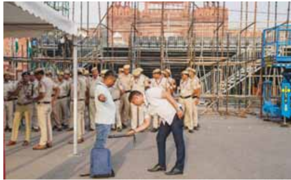
Police personnel deployed near Red Fort ahead of Independence Day celebrations, in New Delhi on Friday

Vehicles that do not have parking labels for the rehearsal may avoid C-Hexagon, India Gate, Copernicus Marg, Mandi House, Sikandra Road, W Point, A point Tilak Marg, Mathura Road, BSZ Marg, Netaji Subhash Marg, J L Nehru Marg, Ring Road between Nizamuddin Khatta and ISBT Kashmere Gate, and Outer Ring Road from