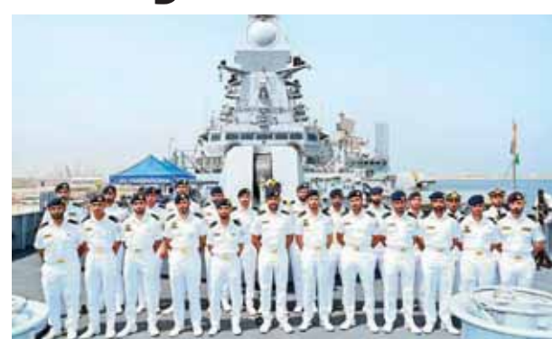
Navy personnel during the India-UAE bilateral Naval Maritime Partnership Exercise

to participate in the bilateral Naval Maritime Partnership Exercise with the UAE Navy. After two days of detailed planning, the two navies conducted the bilateral Maritime Partnership Exercise on Saturday aimed to enhance the interoperability and synergy between the two navies by cross training on tactics, techniques and procedures while developing stronger professional bonds.