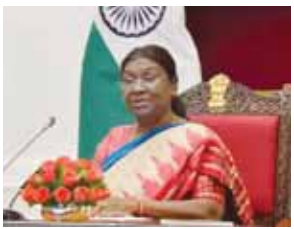
bureaucrats in Delhi.

Home Minister Amit Shah defended the Government's legislation in Parliament, which overrides a Supreme Court ruling on jurisdiction over