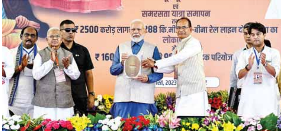
Prime Minister Narendra Modi during the foundation stone laying ceremony of Sant Ravidas memorial, in Sagar on Saturday. MP Governor Mangubhai C Patel, CM Shivraj Singh Chouhan and Union Minister Jyotiraditya Scindia are also seen.

The Prime Minister laid the foundation stone and dedicated to the nation, development projects in Sagar. The