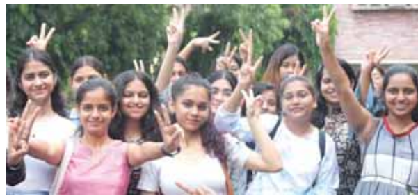
First year students enjoy on the first day of their new academic session, at Miranda House College, North Campus, in New Delhi on Wednesday.

During these orientation sessions, first-year students were introduced to the academic curriculum and courses by their professors while seniors students took the opportunity to acquaint the freshers with the college rules, the anti-ragging policy and the code of conduct. The college societies set up