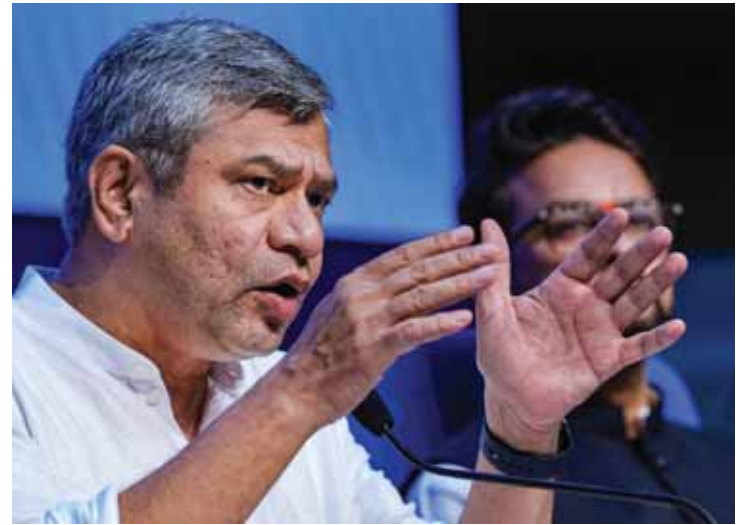
Union Ministers Ashwini Vaishnaw and Anurag Thakur brief the media on Cabinet decisions in New Delhi on Wednesday

This initiative is projected to generate 45,000 to 55,000 direct jobs through the deployment of approximately 10,000