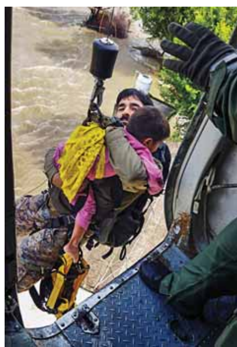
IAF personnel conduct rescue operation to save stranded residents in flood-affected areas of Himachal Pradesh on Wednesday