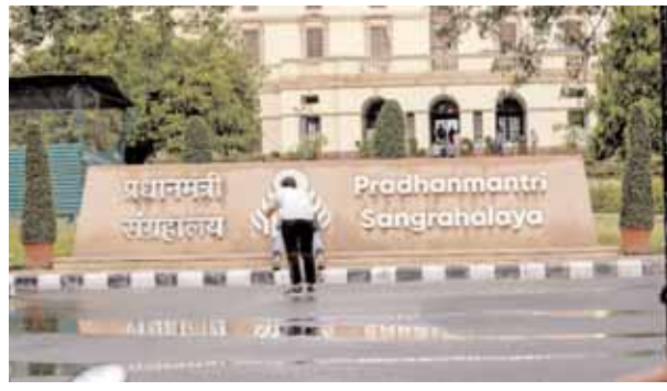
A view of the signage outside Pradhanmantri Sangrahalaya in New Delhi on Wednesday. The Nehru Memorial Museum and Library Society housed at Teen Murti Bhavan premises has been renamed as Prime Ministers' Museum and Library Society

The Congress asserted that Prime Minister Narendra Modi's primary agenda has been to tarnish and defame the Nehruvian legacy. In a statement on social media, Congress general secretary Jairam Ramesh remarked, "Today marks the renaming of an iconic institution. The glob-