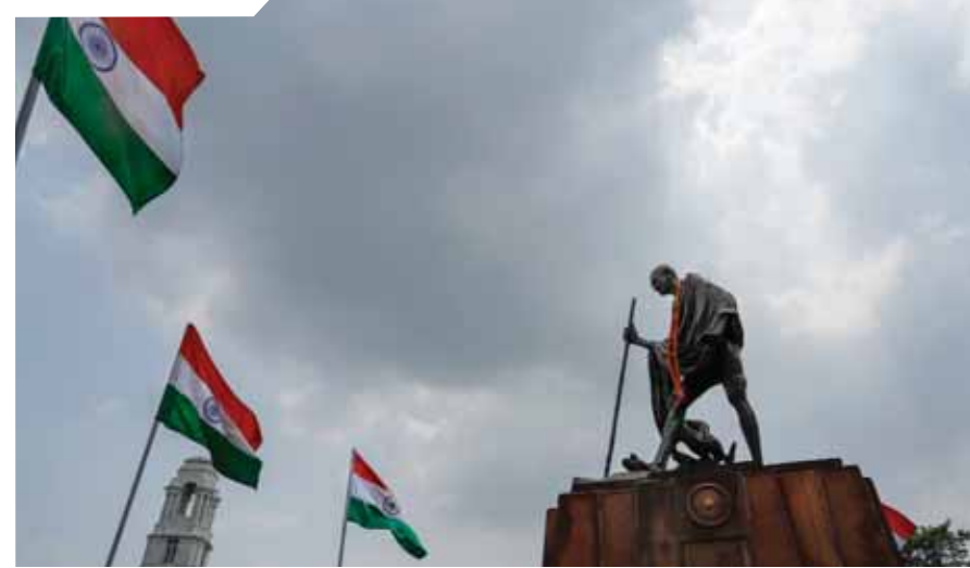
Dark clouds above the Mahatma Gandhi statue at the Delhi Legislative Assembly building in New Delhi