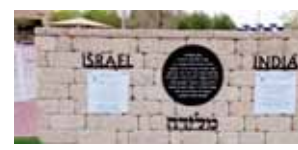
shared heritage, values and aspirations of their people."

A message on the wall of the square read, "India-Israel friendship is a testimony to the civilisational bond of trust and friendship between the two nations that are built on the foundation of centuries of