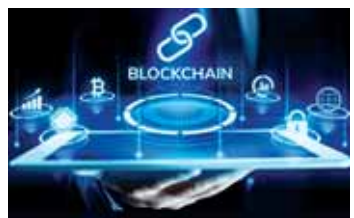
and reporting, remain free of human interface or interference. Available only to authorised individuals in four separate blocks, representing four differ-

"The blockchain technology integrated with the e-forensic app of the Delhi FSL will ensure that evidence (material samples) submitted from the scene of crime to the FSL for analysis