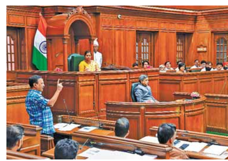
Delhi Chief Minister Arvind Kejriwal speaks during a session of the Delhi Legislative Assembly, in New Delhi

BJP MLAs objected to debate on Manipur, even though UP Assembly discussed it, says Pathak