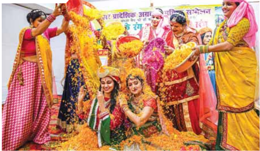
Bihar Pradeshik Agarwal Mahila Sammelan during celebrations of the upcoming Janmashtami festival, in Patna