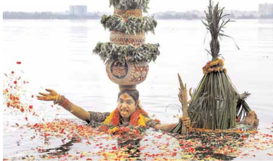
A transwoman carries 'Bonam' during 'pooja' on the occasion of 'Ganga Teppotsavami' in Hyderabad