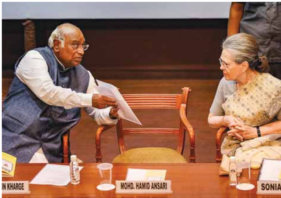
Congress President Mallikarjun Kharage with party leader Sonia Gandhi during the 25th Rajiv Gandhi National Sadbhavana Award on the birth anniversary of former PM Rajiv Gandhi, at Jawahar Bhawan in New Delhi, Sunday.

This new CWC has been announced ahead of the year-end polls in five States, i.e. Mizoram, Madhya Pradesh, Rajasthan, Chhattisgarh and Telangana and is looking forward to the General Elections in 2024. Other notable inclusions in the core CWC include