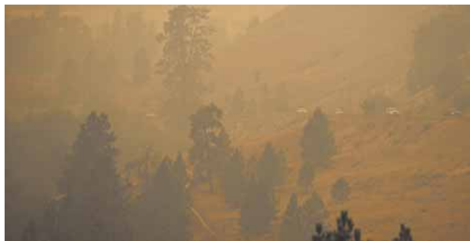
Smoke from wildfires fills the air as motorists travel on a road on the side of a mountain, in Kelowna, BC on Saturday

Yellowknife Mayor Rebecca Altj encouraged residents to stay away from the town to ensure their safety and help with firefighting efforts. She assured people that patrols were monitoring the streets and homes to protect against looting.