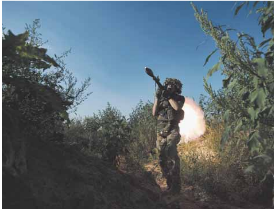
A Ukrainian serviceman of the 53rd brigade fires an RPG-9 towards Russian positions at the frontline close to Donetsk in Ukraine on Saturday

Zelenskyy arrived in the Netherlands on Sunday, two days after the country said the