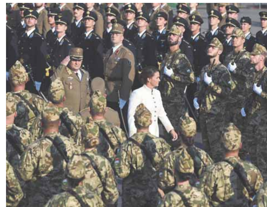
Hungarian President Katalin Novák, center, attends the flag-raising ceremony to mark St. Stephen's Day, founder of the Kingdom of Hungary, at the Parliament House in central Budapest, Hungary on Sunday

The mission "to the shoal is a clear demonstration of our resolve to stand up against threats and coercion and our commitment in upholding the rule of law," the Armed Forces of the Philippines said in a statement.