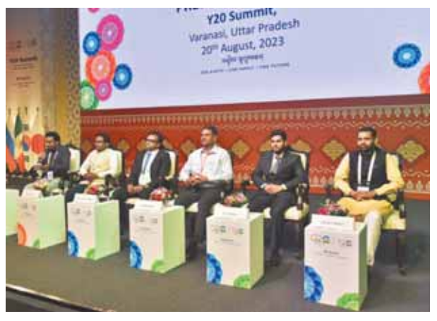
Senior Youth Affairs Ministry officers addressing a press conference on the last day of Y20 in Varanasi on Sunday.

Four-day long Youth-20 Summit under G-20 concluded at Rudraksh International Cooperation and Convention Centre (RICCC) here on Sunday successfully. More than 100 youths from G20 countries, guest countries and international organisations engaged in Discussion on Y20 Draft Communiqué. They were mainly engaged in deliberations and negotiations on five identified themes of Y20 including future of work; peace-building and reconciliation; climate change and disaster risk reduction; shared future and health, wellbeing and sports.