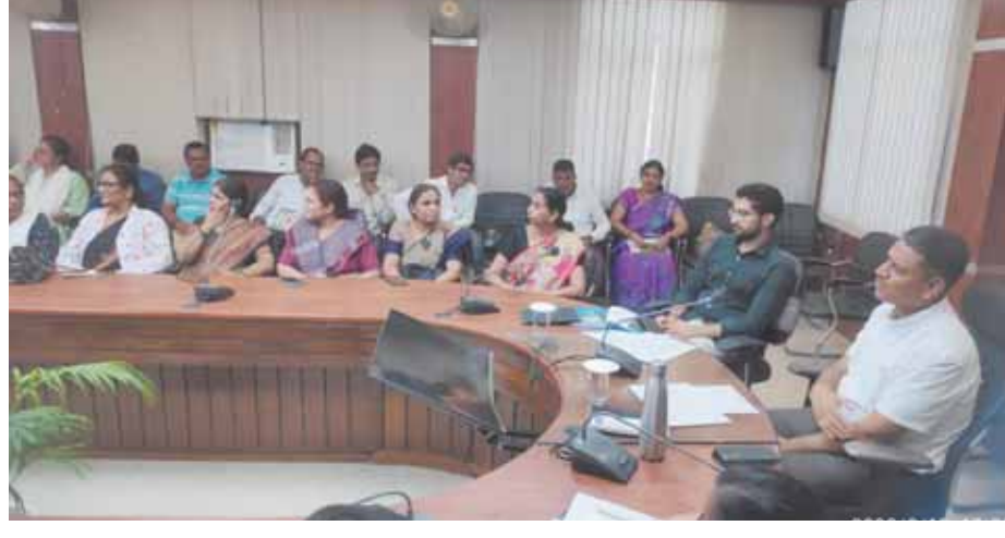
The DM chairing a meeting regarding the construction of under-construction road at Vikas Bhavan.