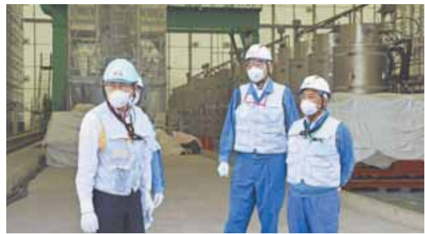
Japanese Prime Minister Fumio Kishida at Fukushima plant

Japanese Prime Minister Fumio Kishida visited the tsunami-wrecked Fukushima nuclear plant on Sunday and said an impending release of treated radioactive wastewater into the Pacific Ocean cannot be postponed.