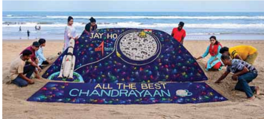
Students create a sand art on ISRO's lunar mission Chandrayaan-3 on Puri beach on Tuesday

Chandrayaan-3 is a follow-on mission to Chandrayaan-2 and its objectives are to demonstrate safe and soft-landing on the lunar surface, roving on the Moon, and to conduct in-situ scientific experiments.