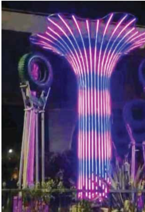
Varanasi ready for G20 CWG meeting commencing from Wednesday.

mentations from the expert-driven Global Thematic webinars on the priority areas of the CWG have been collated in a comprehensive report titled 'G20 Culture: Shaping the Global Narrative for Inclusive Growth'. This insightful report,