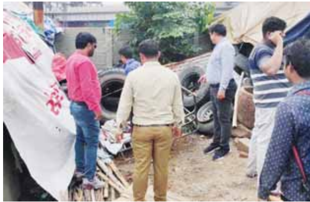
Health department team searching for mosquito larvae in Varanasi.

"This mosquito is identified by white stripes and it bites during the day. According to the data received from the District Malaria Office, not a single dengue patient was found in the district till July this year, but 13 dengue patients have been confirmed so far in this month. That's why it is necessary to pay attention to cleanliness once a week by eliminating accumulated and stagnant water," he said.