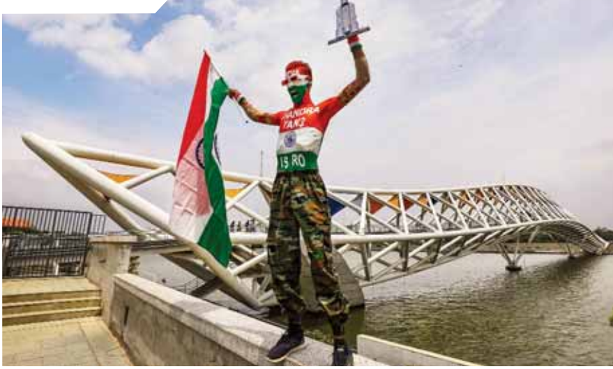
A man in the Tricolour near Atal Bridge ahead of Chandrayaan-3's landing on Moon's surface, in Ahmedabad