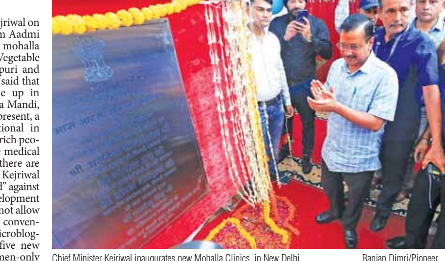
Chief Minister Kejriwal inaugurates new Mohalla Clinics, in New Delhi.

Delhi Chief Minister Arvind Kejriwal on Tuesday inaugurated five Aam Aadmi Mohalla Clinics (AAMCs). These mohalla clinics are located at Keshopur Vegetable Market, Shahbad Dairy, Govindpuri and Kalkaji Market. The Government said that similar facilities will soon come up in Gazipur, Murga Mandi and Okhla Mandi, just like the Keshopur Mandi. At present, a total of 533 AAMCs are functional in Delhi. Kejriwal asserted that even rich people are seeking treatment at these medical facilities as doctors and services there are good. In a veiled attack on the BJP, Kejriwal alleged that "these people conspired" against Delhiites and "tried to stop" development works, but asserted that he would not allow any such move. The AAP national convenor made the comments on the microblogging site 'X' after inaugurating five new mohalla clinics, including a women-only facility fully staffed by women. In a post in Hindi on 'X', Kejriwal said, "These people hatched big conspiracies against the people of Delhi and tried to stop the work of the people of Delhi. But I assure every Delhiite that I will not let any work be stopped." "Five new mohalla clinics started in Delhi today. In the last one year, more than two crore people got themselves treated at all the mohalla clinics of Delhi. People have benefited a lot from Mohalla Clinics," he added. There was no immediate reaction