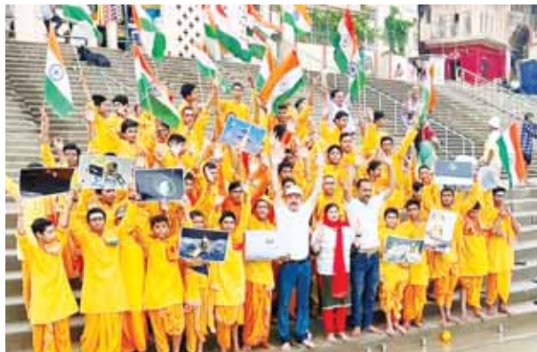
Namami Gange activists offering prayers for success of Chandrayaan-3 Mission in Varanasi on Tuesday.

The participants prayed to Lord Vishwanath (Shiva) to make the Chandrayaan-3 mission a success and prove the