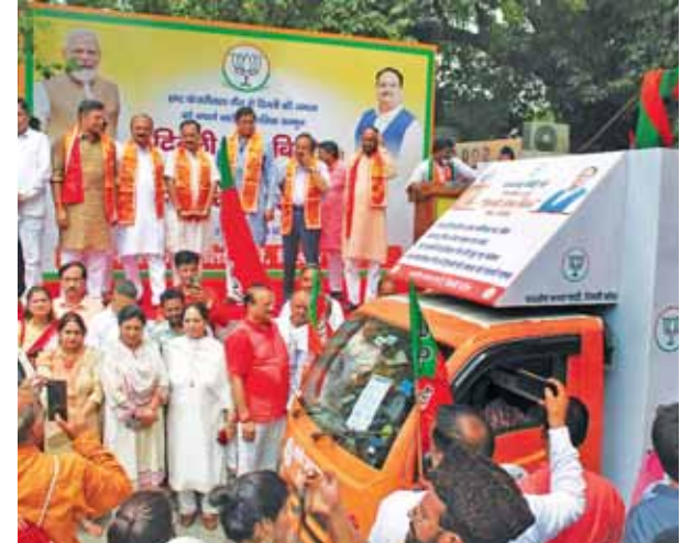
BJP vice-president Bajjayant Panda and Delhi BJP president Virendra Sachdeva during the launch of mobile vans for the party's campaign.