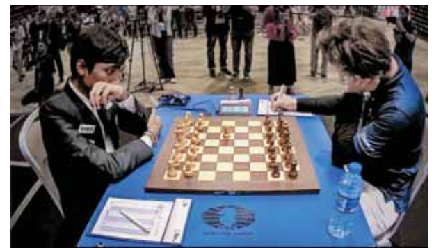
Indian GM R Praggnanandhaa and Norway's GM and World Number 1 player Magnus Carlsen during the final match of the Chess World Cup 2023 in Baku in Azerbaijan on Tuesday

In the middle of a major time crunch, Praggnanandhaa was able to hold Carlsen for a draw in an objectively equal position with white pieces. The Indian played a solid game and agreed to a draw on move 35. "I don't think I was in any