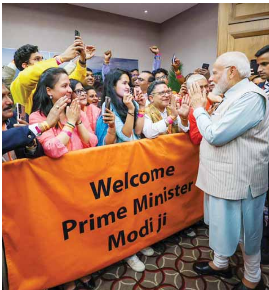
Prime Minister Narendra Modi being welcomed by the Indian community upon his arrival at Sandton Sun Hotel in Johannesburg on Tuesday. Modi is on a three-day official visit during which he will attend the 15th BRICS summit and hold bilateral meetings with a number of world leaders