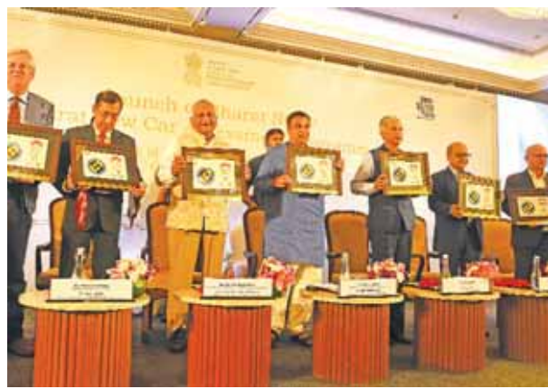
Union Minister for Road Transport and Highways Nitin Gadkari with Minister of State General (Retd) VK Singh, Ministry of Road Transport and Highways Secretary Anurag Jain and others during the launch of Bharat New Car Assessment Programme' (Bharat NCAP) in New Delhi on Tuesday