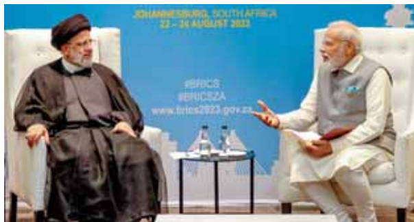
Prime Minister Narendra Modi during a meeting with Iranian President Ebrahim Raisi at the 15th BRICS Summit, in Johannesburg on Thursday

attempt has been successful. Science has been able to take us to difficult terrain. This itself is a big achievement of science and scientists," Modi said while world leaders including the Chinese President Xi Jinping looked on. On Wednesday, India became the fourth nation to soft land a spacecraft on the moon when Chandrayaan-3 touched down near the south pole of the earth's natural satellite. Congratulations have poured in for India and Prime Minister