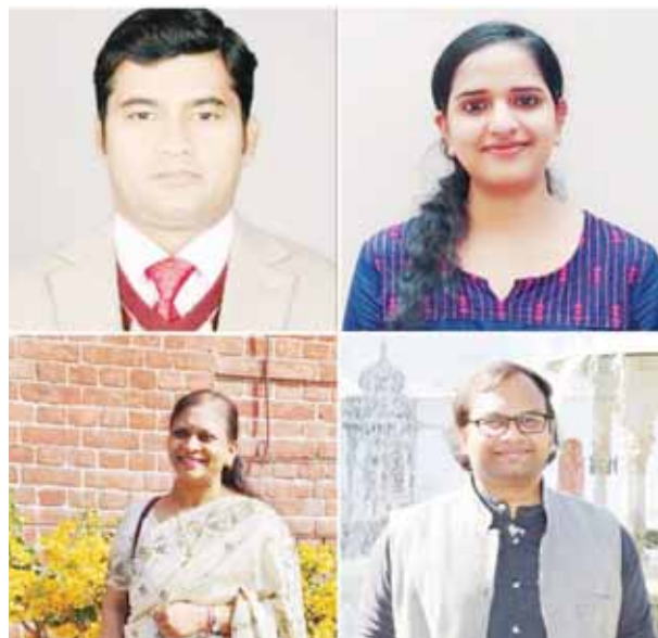
BHU team which made a study to use temple waste coconut coir in making a food flavour compound.

This waste though biodegradable, if not regulated properly, poses threat to the environment and serves as the