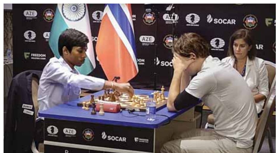
Indian Grandmaster R Praggnanandhaa and Norwegian Grandmaster and World Number 1 player Magnus Carlsen during the second tie-breaker match of the Chess World Cup 2023 final in Baku on Thursday

World leaders hail Modi for Chandrayaan mission feat P4