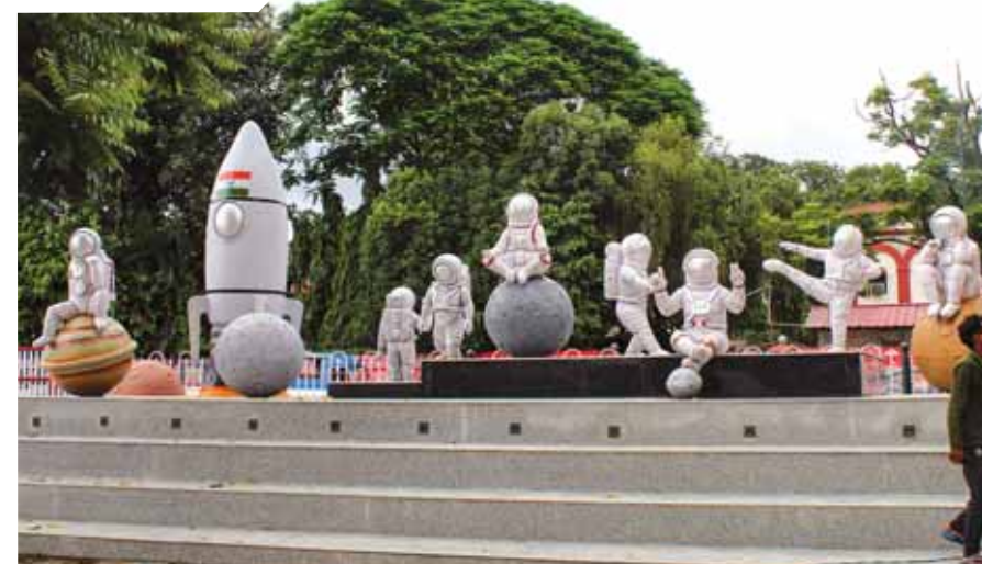
Models depicting an astronaut and an Indian spacecraft at a kids' zone at the Parade Ground, in Dehradun