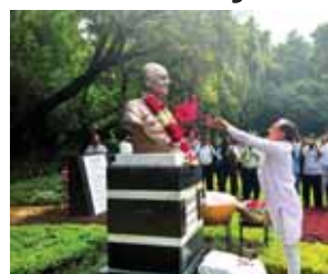
STAFF REPORTER ■ NEW DELHI