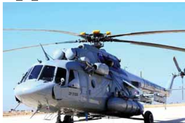
A view of the Mi-17 V5 Helicopter. The DAC headed by Defence Minister Rajnath Singh had accorded Acceptance of Necessity for capital acquisition proposals worth approximately ₹7,800 crore which includes procurement and installation of Electronic Warfare Suite on Mi-17 V5 Helicopters | Photo Credit: Special Arrangement | File photo

PIONEER NEWS SERVICE ■ NEW DELHI In an effort to boost the operational capabilities of the armed forces, Defence Acquisition Council (DAC) chaired by Defence Minister Rajnath Singh on Thursday approved deals worth Rs 7,800 crores. Giving details of the DAC meeting, defence ministry officials said here to enhance the efficiency of the Indian Air Force, nod was given for procurement and installation of Electronic Warfare (EW) Suite on Mi-17 V5 Helicopters under Buy (Indian-IDD) category. It will enhance better survivability of Helicopters. The EW Suite will be procured from Bharat Electronics Limited (BEL). The DAC also accorded Acceptance of Necessity (AoN) for procurement of ground-based autonomous system for mechanised infantry and armoured regiments which will enable various operations like unmanned surveillance, logistic delivery of ammunition, fuel & spares and casualty evacuation in