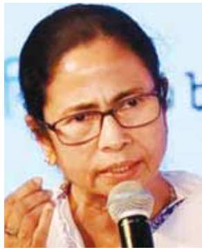
29 for a meeting on the issue.

In an apparent view to shoot down the BJP’s attempt to get June declared as the State Day the TMC Government has written a letter to all the parties inviting them on August