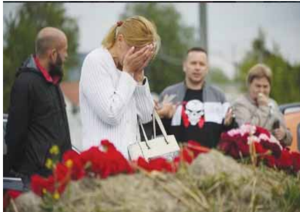
A woman reacts at an informal memorial next to the former 'PMC Wagner Centre' in St. Petersburg, Russia on Thursday.

"Right now, of course, there are lots of speculations around this plane crash and the tragic deaths of the passengers of the plane, including Yevgeny Prigozhin," Peskov told