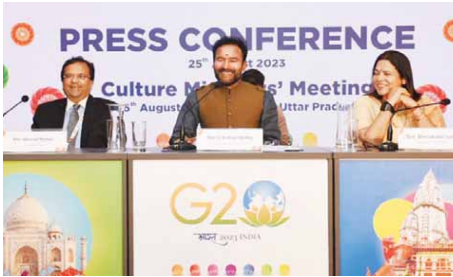
Union Culture Minister G Krishna Reddy telling about G20 Cultural Ministers' Meeting in Varanasi on Friday.

He said that in 2020 under the Saudi Arabian Presidency, the culture ministers met for the first time on the sidelines of the G20. In 2021 Culture was formalised as a working group during the Italian Presidency, leading to the inaugural G20 CMM and the consequential Rome Culture Ministers' Declaration. The 'Bali Declaration' of 2022 under the Indonesian presidency further stressed the role of culture in sustainable development. In Varanasi, this would be the fourth time that the Culture Ministers of the G20 members and invitee countries would be meeting. According to him, the CMM will also adopt the Draft Declaration which was discussed by the Cultural Working Group (CWG) during its two days meeting in this holy city. He said that as India gears up for the G20 Leaders' Summit, it aspires to adopt outcomes by consensus that places culture at the heart of policymaking, leveraging its interplay with other key policy areas such as trade, tourism and digital sectors. Union Minister of State for Culture Meenakshi Lekhi said that the gathering provided all of us to have a cultural connection, make a collective and positive commitment, adopt cultural diplomacy for understanding each other better and set a global narrative for sustainable development. She also attended and addressed the fourth