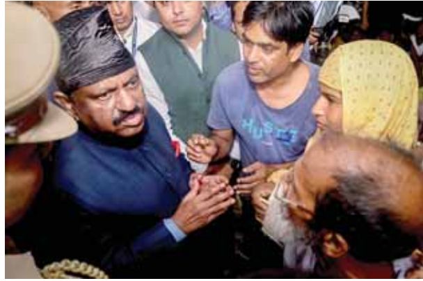
West Bengal Governor CV Ananda Bose meets families of migrant workers killed in the Mizoram rail bridge collapse, in Malda district on Friday

Out of 24 residents from Malda district who have perished in the Mizoram accident, this tiny hamlet — with an assortment of a few dozen of thatched huts — alone accounts for 13, locals said. “There is not a single home where food has been cooked for the past three