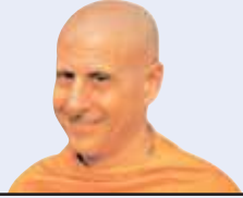
RADHANATH SWAMI MAHARAJ

Lord Shri Krishna imparts profound life lessons through his various divine actions