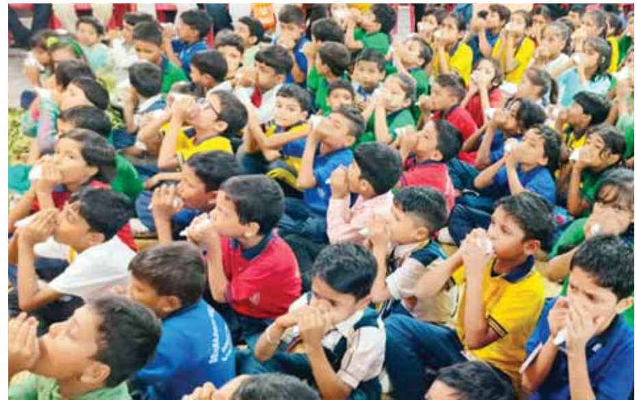
Children of a school at Domri celebrating Chandrayaan-3 success in Varanasi on Friday.