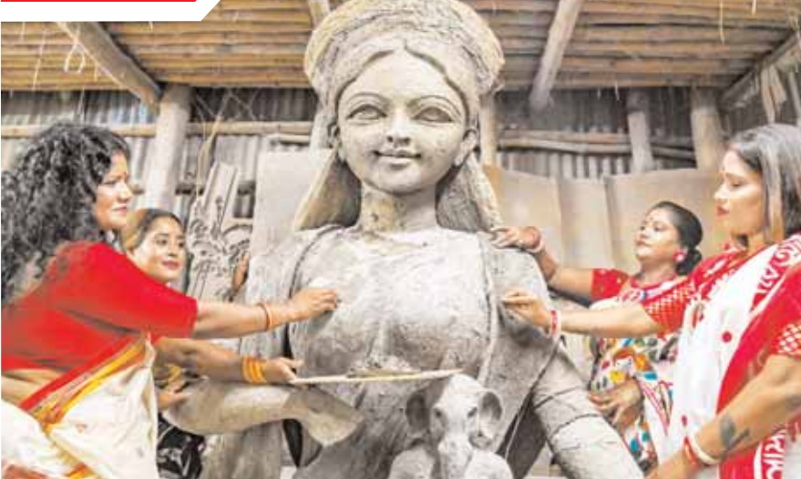
Sex workers with a clay idol of Goddess Durga as they unveil it for the upcoming Durga Puja festival in Kolkata