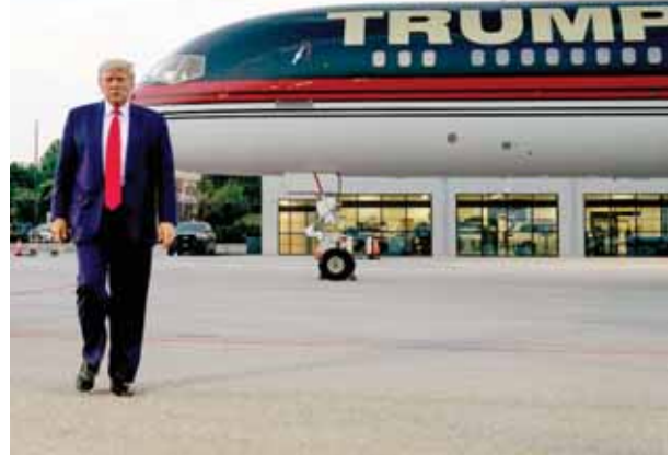
Former US President Donald Trump walks over to speak with reporters before departure from Hartsfield-Jackson Atlanta International Airport in Atlanta

Trump, a Republican, also posted the mug shot to his X