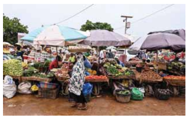
Vendors sell vegetables at the market in Niamey on August 23, 2023.