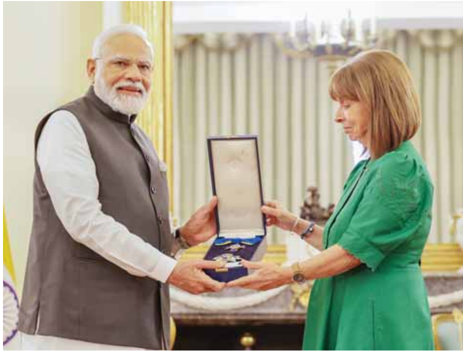
Prime Minister Narendra Modi being conferred with the Grand Cross of the Order of Honour by the President of Greece Katerina Sakellariopoulou, in Athens, on Friday

As regards talks with his Greek counterpart, Prime Minister Modi said both sides also set a target of doubling bilateral trade by 2030 and decided to firm up a migration