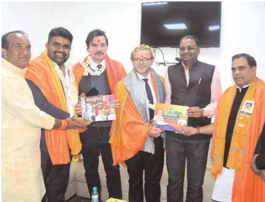
A delegation from the Danish embassy visited the BJP State headquarters and media center under the "Know BJP" campaign in Bhopal on Thursday.