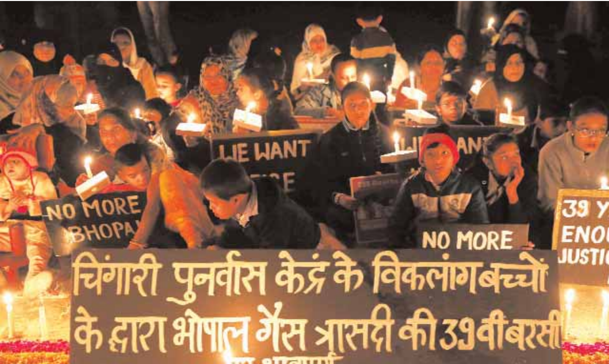
Children born with congenital disabilities, believed to be caused by the exposure of their parents to gas leakage during the Union Carbide gas leak disaster, along with their relatives and supporters, take part in a candlelight vigil to pay homage to the people killed in the 1984 Bhopal gas tragedy to mark the 39th anniversary of the disaster, in Bhopal on Thursday.