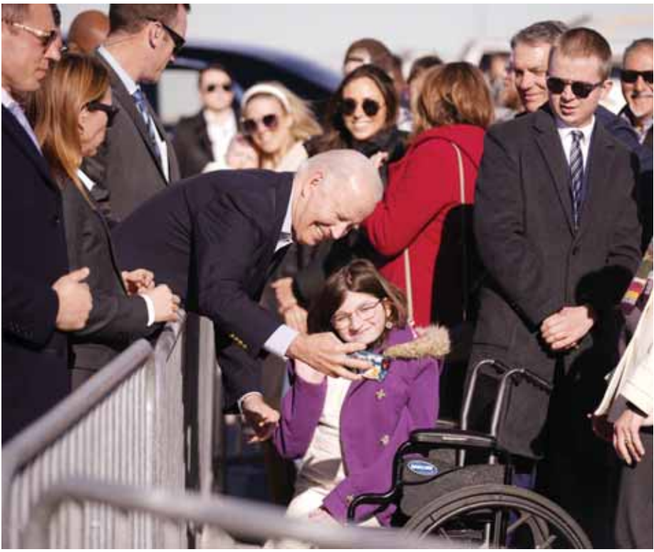
President Joe Biden takes a photo with people on the tarmac before he boards Air Force One at Denver International Airport in Denver, Wednesday, to travel to Pueblo Memorial Airport in Pueblo, Colo.