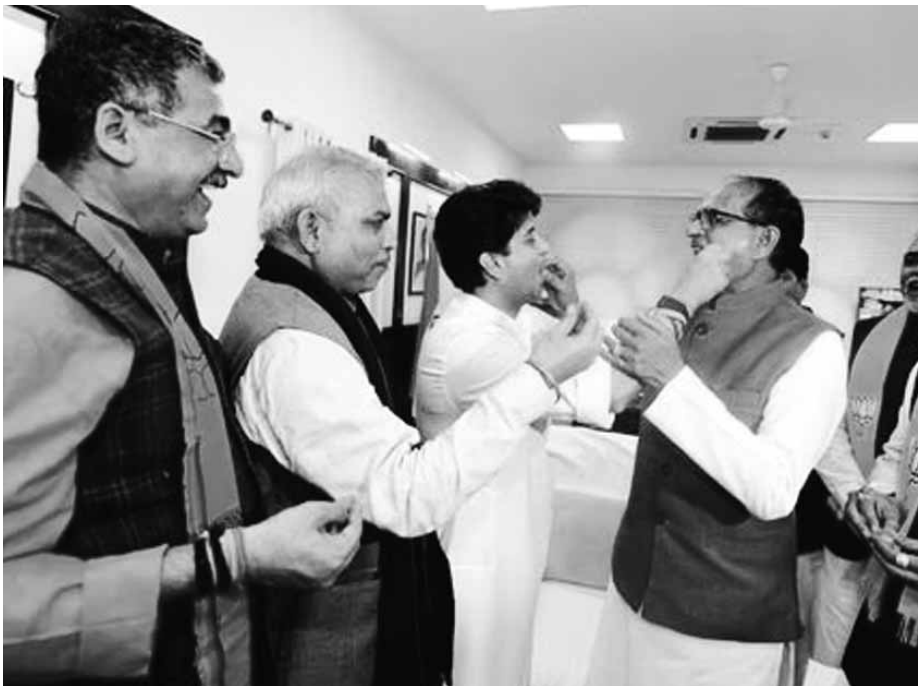
assemblies, such as Yogi Adityanath in 2017. Union ministers Narendra Singh Tomar, who contested from Dimani assembly seat, and Jyotiraditya Scindia have long been seen as chief ministerial aspirants in Madhya Pradesh. In Rajasthan, political watchers believe a comfortable majority for the BJP means that the party leadership may turn to a new face as its chief ministerial choice, even though two-term former chief minister Vasundhara Raje is a natural contender due to her stature and sizeable support base. Union ministers Gajendra

PIONEER NEWS SERVICE ■ NEW DELHI All the talk about the BJP looking at an alternative leadership in Madhya Pradesh receded into the background on a day Chief Minister Shivraj Singh Chouhan made a strong statement about his popular acceptability as the party appeared set to retain power with a stunning two-thirds majority. The BJP had chosen to head into the Assembly polls without naming a chief ministerial face in any of the states. While Chouhan has emerged as a favourite to remain at the helm in MP despite the presence of some challengers, the leadership race is wide open in Chhattisgarh and Rajasthan, two states where the BJP has snatched power from the Congress. Many possible contenders for the top job across the three Hindi-speaking states have not contested the assembly polls but this may not be a factor as the party has in the past placed its trust in leaders who were not a member of state