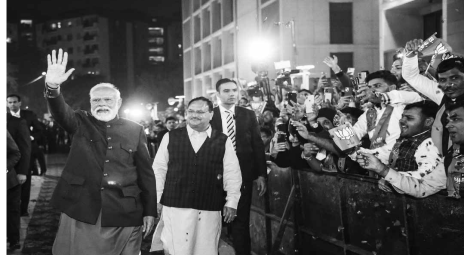
remove them, Modi said in a stinging attack on opposition parties. Some people are already saying our hat-trick in the states is a guarantee of hat-trick in the Lok Sabha polls in 2024, he said. He told opposition parties to not support those working against the country's interests at a time when development

PIONEER NEWS SERVICE ■ NEW DELHI Prime Minister Narendra Modi on Sunday hailed BJP's big win in the Assembly polls as a victory for his Government's agenda of self-reliant India, asserting that its hat-trick in the states is a guarantee of its hat-trick of Lok Sabha poll wins in 2024. "The results show popular support for our battle against corruption," he told a crowd of cheering supporters at the BJP headquarters here, adding that they have served a lesson to the Congress and the opposition's INDIA bloc that mere collecting some dynasts on dais may make for a good photograph but cannot win people's confidence. Voters have delivered a warning to these parties involved in corruption to mend their ways or people will finish them off, he said. No one should come in between the Centre's development and people, or the masses will