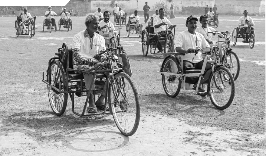
Disabled People participate in a tricycle race, on International Day of Persons with Disabilities, in Nadia