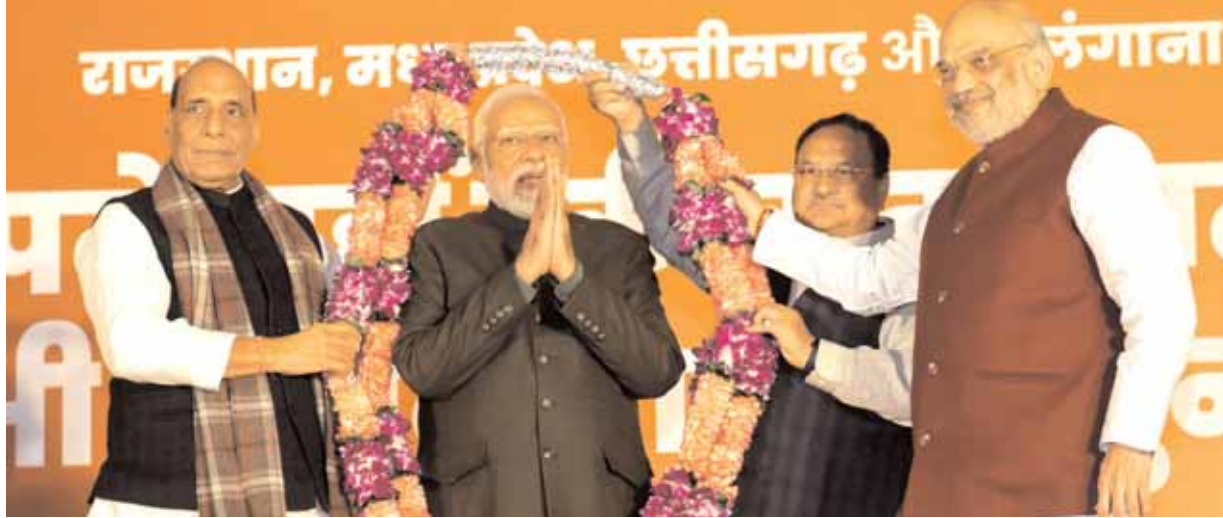
Prime Minister Narendra Modi with BJP National President JP Nadda, Defence Minister Rajnath Singh and Union Home Minister Amit Shah during celebrations after party's victory in elections to the Legislative Assemblies of Madhya Pradesh, Rajasthan and Chhattisgarh, at BJP headquarters, in New Delhi, on Sunday