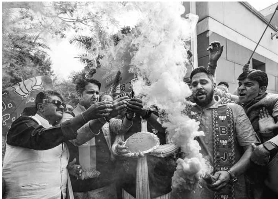
Chhattisgarh, Rajasthan assembly polls disappointing," said party chief Mallikarjun Kharge, adding that it will overcome temporary setbacks and prepare fully for Lok Sabha polls along with its partners in the INDIA alliance. The elections, which set the momentum for the 2024 polls and threw up clear, unambiguous mandates in all four

for instance, titled "Modi's Guarantees", promised annual financial assistance to married women and landless agricultural labourers, paddy procurement at Rs 3,100 per quintal and cooking gas cylinder at Rs 500 to poor families. "The election results show people accept Prime Minister Narendra Modi's guarantee of delivering on guarantees," Union Minister Pralhad Joshi said. Joshi, who was BJP's election-in-charge for Rajasthan, also took a dig at the Congress and the promises it made in the run up to the elections. "People have blessed BJP in three states, endorsed Prime Minister Modi's leadership and rejected Congress' false promises," Joshi said. For the Congress, looking for political revival, and the BRS, it was time to take stock ahead of the general elections just six months away. "Congress' performance in Madhya Pradesh,