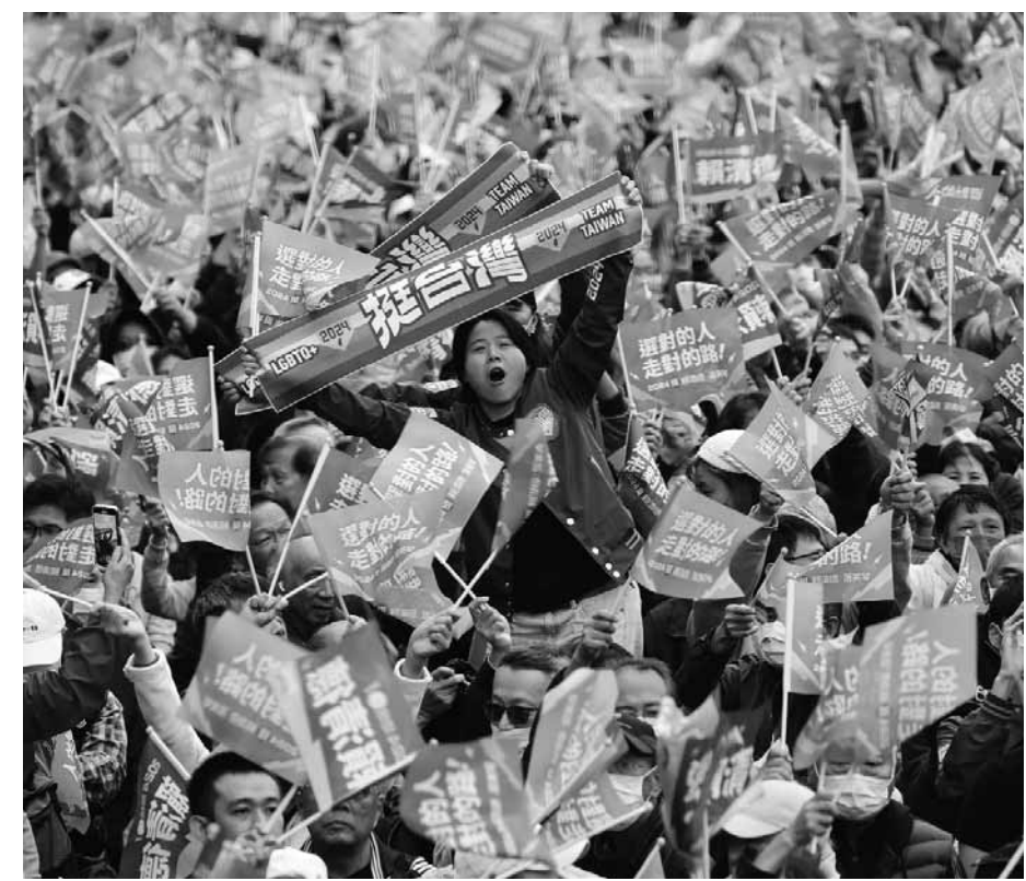
Supporters of Taiwan President and Democratic Progressive Party presidential candidate William Lai cheer as Lai launches his election campaign in Taipei, Taiwan, Sunday. Taiwan will hold its presidential election on Jan. 13, 2023.

Criticism of Israel's conduct in the war has peppered much of the summit from world leaders, as well as activists who can be seen through the site wearing the traditional checkered keffiyeh, or scarf, associated with the Palestinians.