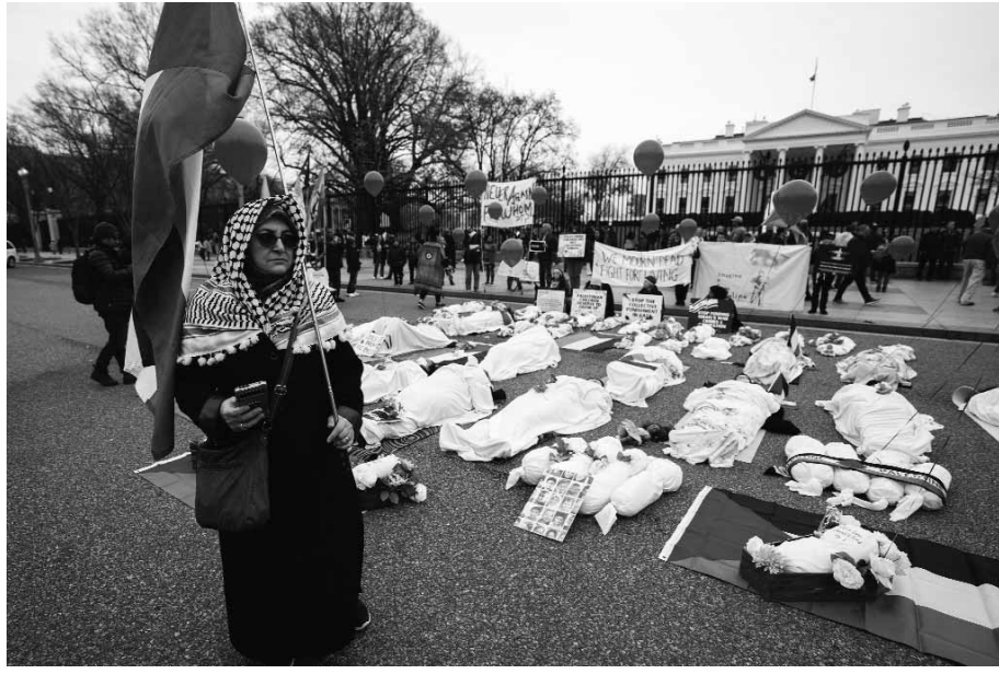
Palestinian supporters calling for an immediate ceasefire stage a mock funeral with dolls and people wrapped in white cloth smeared with red paint to resemble Palestinian victims of the Israel-Hamas war, in front of the White House in Washington, Saturday.

Separately, the bodies of 31 people who were killed in Israeli bombardment across the central areas of the strip were taken to the Al-Aqsa