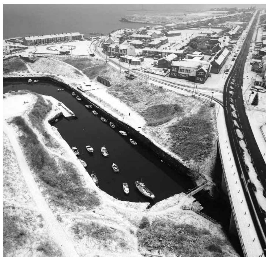
Snow blanketed Seaton Sluice in Northumberland, England, Sunday, December 3, 2023 as temperatures are tipped to plunge to as low as minus 11C (12.2 F) in parts of the UK over the weekend

"Through FAO, USAID will support strengthening AMR surveillance in animal health; strengthening of zoonotic disease surveillance; and improving biosafety and biosecurity in Nepal. In total, USAID will provide up to $6.75 million for these efforts over the next three years, subject to availability of funds," it said.