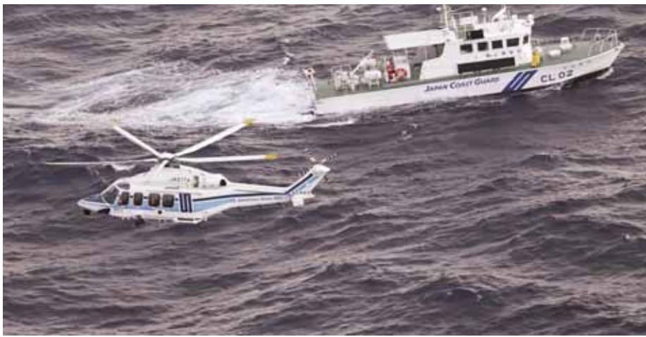
Japanese coast guard helicopter and patrol vessel conduct search and rescue operation in the waters where a US military Osprey aircraft crashed into off the coast of Yakushima Island, Kagoshima prefecture, southern Japan, on Thursday