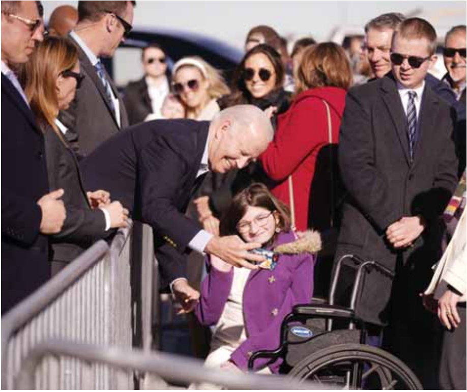
President Joe Biden takes a photo with people on the tarmac before he boards Air Force One at Denver International Airport in Denver, Wednesday, to travel to Pueblo Memorial Airport in Pueblo, Colo.

if a list, as was agreed upon in the outline, were not delivered by 07:00 this morning (Thursday, 30 November 2023), fighting would resume at once," an announcement from the Israeli PMO said in the morning as people anxiously waited to hear on the fate of the fragile ceasefire for exchange of Israeli hostages against Palestinian prisoners. "A list of women and children – in accordance with the terms of the outline – was delivered to Israel a short time ago; therefore, the pause will continue", it added. In a press release, the PMO said, "Pursuant to receiving the list of hostages slated to be released today (November 30), the families have been notified". Jerusalem has been relatively quiet since the outbreak of the recent round of violence and no major skirmishes have been reported despite several calls by Hamas to Palestinians in Jerusalem to support them.