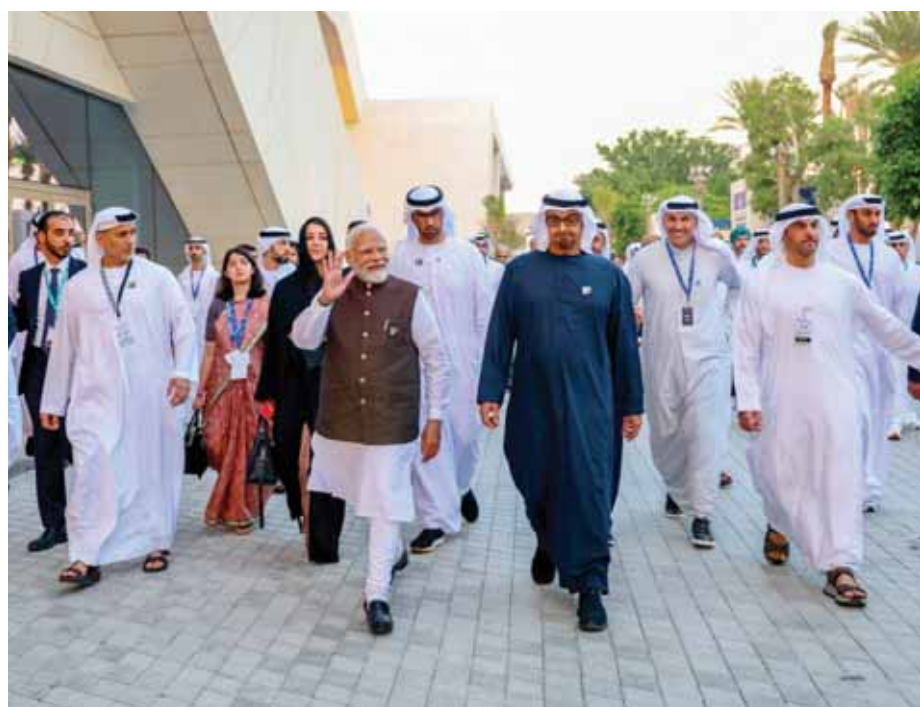
Prime Minister Narendra Modi with UAE President and Ruler of Abu Dhabi HH Sheikh Mohamed bin Zayed Al Nahyan during the COP28 in the UAE on Friday

Asserting that India has presented a great example to the world of striking balance between development and environment conservation, the Prime Minister said, India is among the only few countries in the world on track to achieve its Nationally Determined Contributions or the national