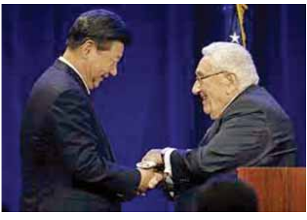
An editorial in the state-run Global Times newspaper called Kissinger's death "a tremendous loss for China-US relations." It criticised the current direction of US policy toward China under the headline: "May there be successors to Henry Kissinger in the US."