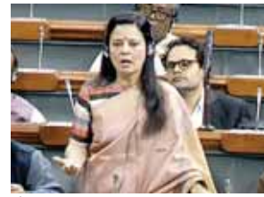
Six members of the panel voted

circulated by the Lok Sabha Secretariat, Ethics Committee chairperson Vinod Kumar Sonkar will lay on the table of the House the panel's first report. The committee, at a meeting on November 9, adopted its report recommending Moitra's expulsion from the Lok Sabha over the "cash-for-query" allega-