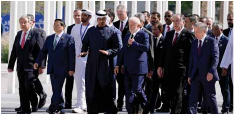
United Nations Secretary-General Antonio Guterres, left, and Brazil President Luiz Inacio Lula da Silva, center, walk after leaving a group photo at the COP28 U.N. Climate Summit, Friday in Dubai, United Arab Emirates.

As world leaders gathered for the COP28 climate summit in Dubai, the collapse of a cease-fire in the Israel-Hamas war Friday plunged the conflict back into open combat and cast a long shadow over the talks. Israel's top diplomat for the Middle East huddled with leaders at the summit as his colleagues went through a book of posters of those held hostage by the militant group Hamas, placing yellow "released" stickers by some while looking at others still held. Meanwhile, just a street away at the Palestinian territories' first-ever pavilion, an official gave a horrified look when Associated Press journalists gave her the news that Israeli airstrikes and ground fighting in the Gaza Strip had resumed. Even United Nations Secretary-General Antonio Guterres brought up the fighting in his remarks at a COP conference meant to focus on restraining global warming. "As we see in this region, con-