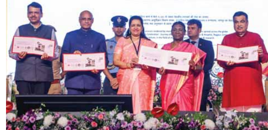
President Droupadi Murmu with Maharashtra Governor Ramesh Bais, Union Minister Nitin Gadkari and Maharashtra Deputy Chief Minister Devendra Fadnis during the platinum jubilee celebrations of Government Medical College in Nagpur

■ NAGPUR President Droupadi Murmu on Friday asked the health care fraternity to work towards making India a leading power in medical research and ensure facilities are so affordable that people from across the world can come to the country to avail them. She was the chief guest at the inauguration of the platinum jubilee celebrations of the Government Medical College and Hospital (GMCH) in Nagpur. Hailing GMCH for the services it had rendered in the past 75 years, the President said affordable medical facilities were necessary for the overall development of any society. The COVID pandemic made everyone realise the importance of a strong health care system, she said. "It was the hard work of doctors, nurses and other medical professionals which ensured India could vaccinate such a huge