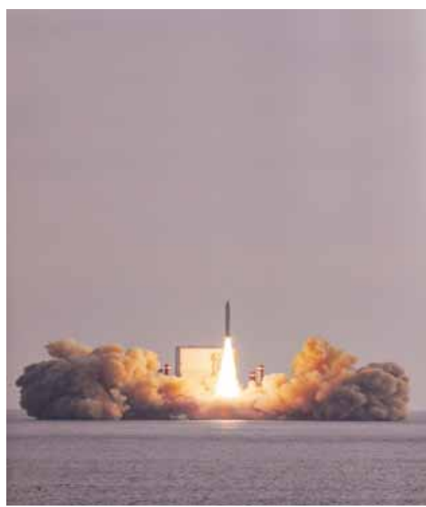
In this photo provided by South Korea Defense Ministry, the third test flight of solid-fuel space rocket is launched from a barge in waters near Jeju Island, South Korea, Monday. AP/PTI

Japan has suspended all flights of its own fleet of 14 Ospreys. Japanese officials say they have asked the US military to resume Osprey flights only after ensuring their safety. The Pentagon said no such formal request has been made and that the US military is continuing to fly 24 MV-22s, the Marine version of Ospreys, deployed on the southern Japanese island of Okinawa.