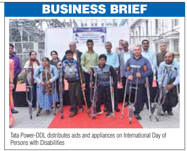
Tata Power-DDL distributes aids and appliances on International Day of Persons with Disabilities

was trading 975.84 points or 1.45 per cent higher at its all-time peak of 68,457.03 and NSE Nifty gained 1.52 per cent to hit the record level of 20,575.75 points. Stock prices of Adani group companies have been on the rise since last week after the Supreme Court on November 24 reserved its verdict on a batch of petitions seeking examination of allegations of fraud against the conglomerate.