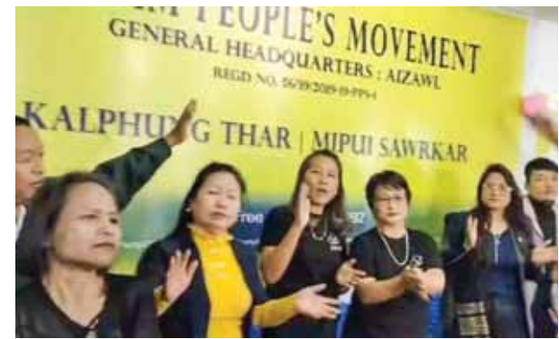
Zoram People's Movement (ZPM) workers celebrate party's win in Mizoram Assembly elections, in Aizawl, on Monday

The Zoram People's Movement (ZPM) stormed to power in Mizoram by dethroning the Mizo National Front (MNF) bagging 27 seats in the 40-member House on Monday. The MNF won 10 seats, BJP (2) and Congress (1), Election Commission officials said. Prominent ZPM winners include the party's CM face Lalthuma, who secured the Serchhip seat defeating his MNF rival J Malsawmzuala Vanchhawng by 2,982 votes. Chief Minister and MNF chief Zoramthanga lost to ZPM's Lalthansanga by 2,101 votes, the Election Commission said. He later called on Governor Hari Babu Kambhampati and submitted his resignation, officials said. In the 2018 Assembly elections, the MNF had won 26 seats. This will be the first time in the history of Mizoram that the northeastern State will be ruled by a non-Congress and non-MNF Government since its creation in 1987. Nine out of 11 MNF Ministers who contested the polls lost. Home Minister Lalchamliana did not contest the elections. Prominent among them are Deputy Chief Minister and MNF candidate Tawnluia