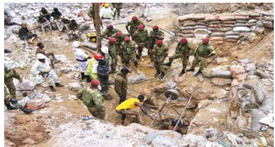
Zambian Army special forces officers follow the rescue operation of miners on Sunday in Chingola, around 400 kilometres (248 miles) north of the capital Lusaka, Zambia.

"I send my sincere condolences to the affected families and have directed all our