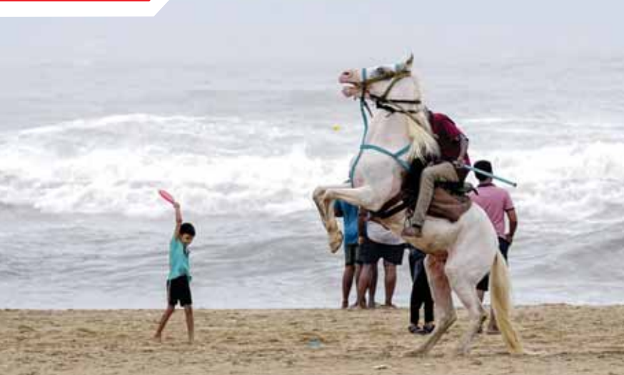
Tourists visit the Marina Beach as high tidal waves lash the shore owing to Cyclone Michaung, in Chennai