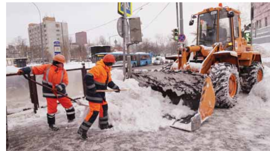
Municipal workers clear snow from the sidewalks after heavy snowfall in Moscow, Russia, on Monday. A record snowfall has hit Russia's capital bringing an additional 10 cm (to already high levels of snow and causing disruption at the capital's airports and on roads