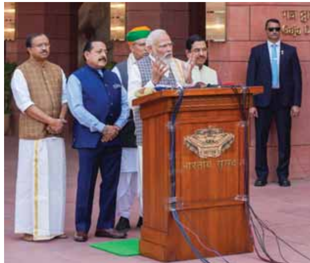
Prime Minister Narendra Modi addresses the media on the first day of the Winter session of Parliament, in New Delhi, on Monday

Buoyed by the massive success in the just-concluded Assembly polls, Prime Minister Narendra Modi, on Monday, asked the Opposition not to vent its frustration over the defeat in the Assembly polls inside Parliament during the ensuing Winter Session. Instead, he urged them to move forward, leaving behind 'negativity,' and sought cooperation in meaningful debates. "The country has rejected negativity. We always have dialogue with Opposition friends at the start of Session, we always seek cooperation of everyone. This time also all such processes have been completed," said Modi, addressing media outside Parliament building ahead of beginning of the Winter Session. This 'temple of democracy' is a very important platform for people's aspirations and strengthening foundation of a developed India, Modi said and urged all members to come well prepared and hold thorough discussions on Bills so that good suggestions come to the fore. But if discussion does not take place, the