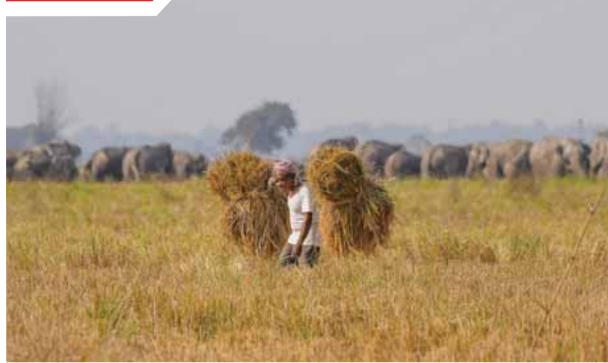
A farmer carries harvested rice as a herd of wild elephants gathers in a field in search of food, in Nagaon.