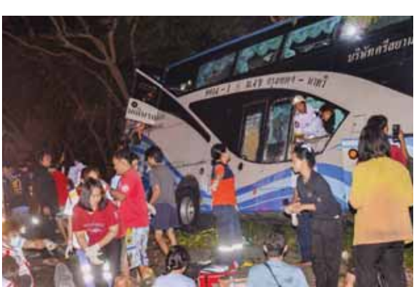
In this photo provided by Sawang Rungrueang Rescue22 Foundation, rescue workers and volunteers work at the site of a bus accident on Tuesday AP/PTI