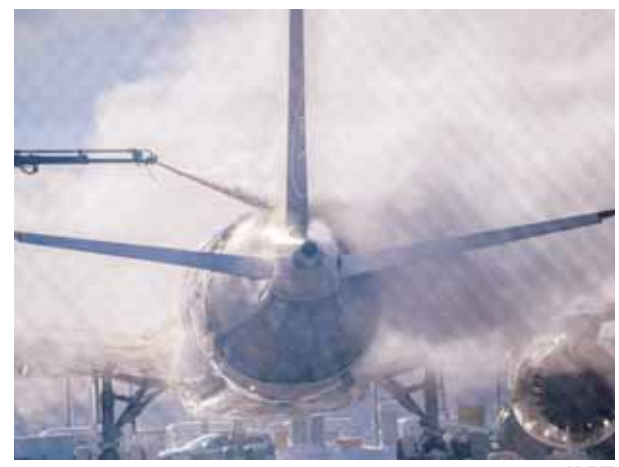
A plane is cleared of ice in Munich Airport, Germany, on Tuesday

The airport, Germany's second-biggest, announced the temporary shutdown on Monday night as a result of weather forecasts for Tuesday. "The operating areas will be decided in the first half of the day. The plan is to allow air traffic to resume from midday," the airport said on its website. "However, it can be assumed that the majority of flights will also have to be cancelled dur-