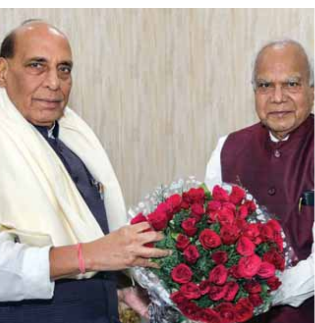
Defence Minister Rajnath Singh with Punjab Governor Banwarilal Purohit during a meeting in New Delhi on Tuesday

vide USD 250 million as Line of Credit to Kenya for modernisation of its agriculture sector. Referring to the Indo-Pacific, Modi said closer cooperation between India and Kenya in the region will advance common efforts.