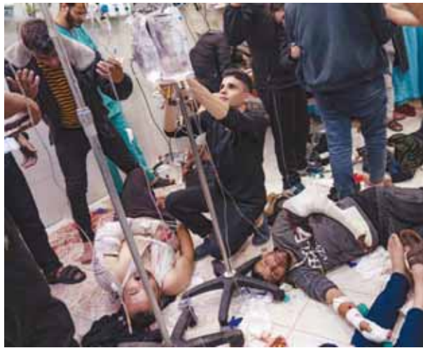
Palestinians are treated as they lie on the floor after being wounded in an Israeli army bombardment of the Gaza Strip, in the hospital in Khan Younis, Tuesday.

Satellite photos taken Sunday showed tanks and troops massing outside Khan