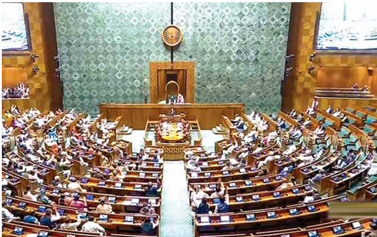
Parliamentarians in the Lok Sabha during the Winter session of Parliament, in New Delhi, on Wednesday