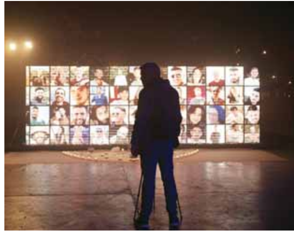
A journalist films a display of people who were killed at the Nova music festival in an Oct. 7 cross-border attack by Hamas, during a press tour of the 06:29 memorial recreating the festival grounds on the day of the massacre, in Tel Aviv, Israel, on Wednesday.

Late Wednesday, UN Secretary-General Antonio Guterres used a rarely exercised power to warn the Security Council of an impending "humanitarian catastrophe" in Gaza and urged members to demand a cease-fire. He invoked Article 99 of the UN Charter, a step no UN chief has taken in half a century, which says the secretary-general may