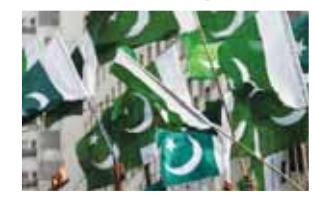
WASHINGTON

A resolution has been introduced in the US House of Representatives urging Pakistan to uphold democratic institutions, human rights, and the rule of law, as the cash-strapped country prepares for general elections in February.