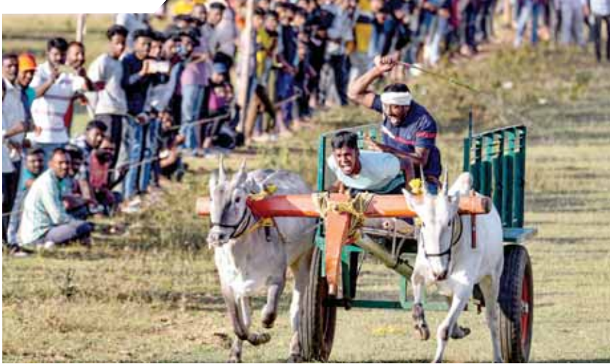
Aspirants participate enthusiastically in a state level bullock cart race in Tumkur district