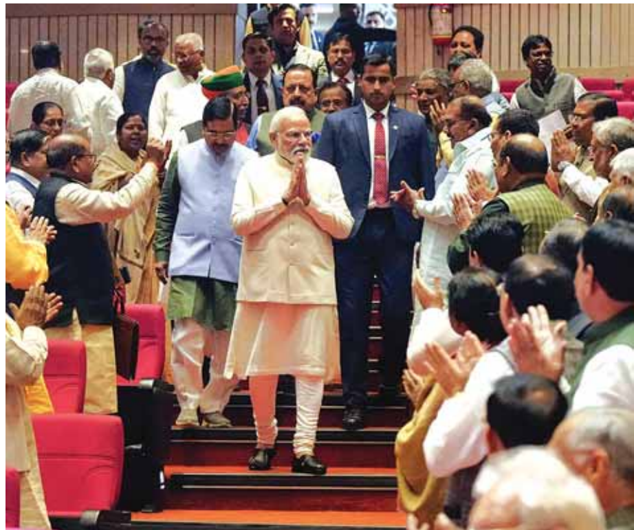
Prime Minister Narendra Modi arrives for the BJP Parliamentary Party meeting at the Parliament House in New Delhi

Prime Minister Narendra Modi on Thursday cited poll data for Assembly elections over the decades to assert that the BJP has become people's most preferred choice for governance as its record of retaining power is better than the Congress and other parties. Speaking at the BJP Parliamentary Party meeting, he said not any leader but "team spirit" should be credited for the party's big win in the recent Assembly polls, noting that besides winning in three States, the party's strength has also grown in Telangana and Mizoram, sources said. The Prime Minister also asked party leaders to use the language preferred by the masses in their interaction with them. While giving an example, he said they should use "Modi ki guarantee" instead of "Modi ji ki guarantee".