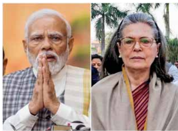
a key role in the party. Several Congress leaders on Saturday greeted Congress Party Chairperson Sonia Gandhi with party chief Mallikarjun

Political leaders across the party lines including Prime Minister Narendra Modi on Saturday greeted former Congress president Sonia Gandhi on her 77th birthday. "Best wishes to Smt Sonia Gandhi Ji on her birthday. May she be blessed with a long and healthy life," Modi said in a social media post. Sonia Gandhi, the longest serving Congress president, has taken a back seat from active politics in the last few years for health reasons, with her son Rahul Gandhi and daughter Priyanka Gandhi Vadra playing