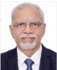
PROFESSOR SL VIG

(The writer, a retired Medical Commissioner of the Employees State Insurance Corporation, played a key role in establishing ESI Medical Colleges and Post Graduate Institutes nationwide)