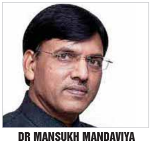
DR MANSUKH MANDAVIYA

K ick-starting the country-wide CPR campaign in which more than 20 lakh people participated on December 6, 2023, Dr Mansukh Mandaviya , Union Health Minister said that "It is imperative that patient is administered treatment immediately on suffering a cardiac arrest hence awareness and adequate training for CPR is paramount."