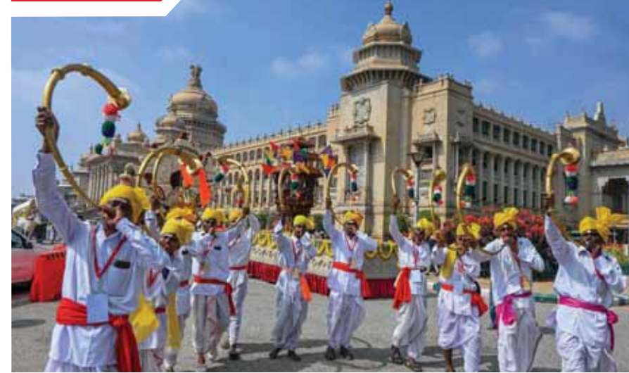
Folk artists take part during the inauguration of the 'Namma Jatre' programme, in Bengaluru