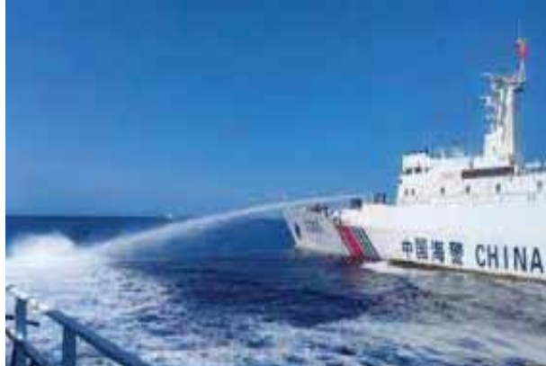
Chinese coast guard ship, causing "scratching".

It also claimed a Philippine vessel ignored warnings and in violation of international navigation regulations made a sharp turn in an "unprofessional and dangerous manner" and intentionally collided with a