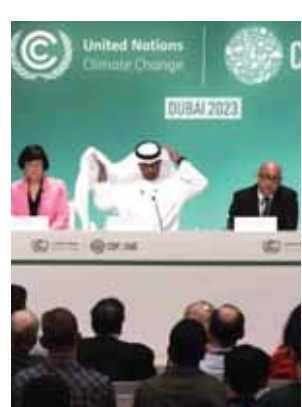
One option in the draft proposes an assessment of each country's

There were some signs negotiators were moving forward on Sunday: A new draft agreement on global adaptation goals - which will determine how poor countries will brace themselves for climate change-fuelled weather extremes like drought, heat and storms - was released. The draft text expresses concern over the gap between the money needed for adaptation and how many countries are getting, but it doesn't say exactly how much cash countries need to adapt to climate change.