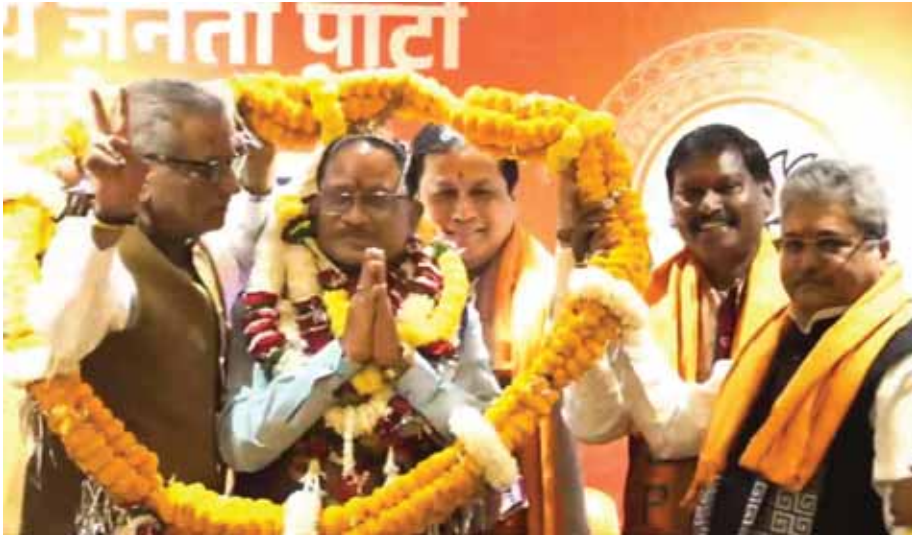
BJP leader Vishnu Deo Sai being garlanded by party leaders Sarbananda Sonowal and Dushyant Kumar Gautam after he was elected as the next Chief Minister of Chhattisgarh during BJP Legislature Party meeting, in Raipur, on Sunday

Former Union Minister Vishnu Deo Sai, a prominent tribal face of the BJP in Chhattisgarh, will be State Chief Minister after he was elected as leader of BJP's legislative party during a meeting of 54 newly elected MLAs here on Sunday. The saffron party returned to power after a gap of five years following the recently-concluded Assembly polls. Chhattisgarh may also see a Deputy Chief Minister. While the decision in Chhattisgarh was made without any hiccups, Vasundhara Raje Scindia's situation appears to be a litmus test for the BJP. Central party observers, including Rajnath Singh joined by party vice president Saroj Pandey and general secretary Vinod Tawde, are involved in Rajasthan, where the party seized power from the Congress. Raje is a two-time former CM of the desert State. Sources said the new CM in Madhya Pradesh will be announced on Monday evening followed by Rajasthan on Tuesday afternoon to facilitate the oath ceremonies before December 15 in the three Hindi heartland States. At Chhattisgarh, a delegation of BJP MLAs led by its Chief