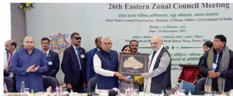
Union Home Minister Amit Shah being presented a memento by Bihar Chief Minister Nitish Kumar during the 26th meeting of Eastern Zonal Council, in Patna, on Sunday

lasted for about three hours, the union home minister said that 1,157 issues have been resolved