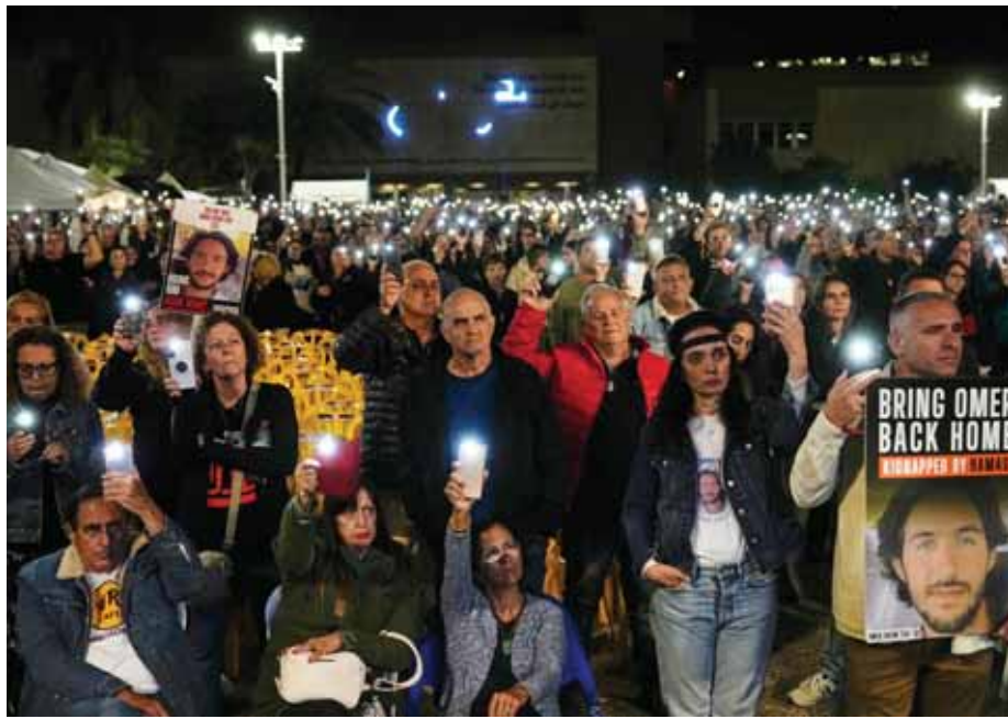
Friends and relatives of the Israeli hostages held in the Gaza Strip by the Hamas militant group attend a rally calling for their release, Saturday in Tel Aviv, Israel.

UN Secretary-General Antonio Guterres, who invoked