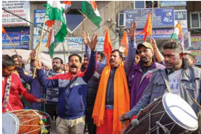
Members of Rashtriya Bajrang Dal after the Supreme Court's verdict upholding the Centre's decision to abrogate Article 370 of the Constitution, in Jammu, on Monday

The common people on the streets of Jammu and Kashmir were 'upbeat and jubilant' after the apex court delivered its long-awaited verdict on Monday, upholding the abrogation of Article 370 and setting the stage for conducting the maiden Assembly polls by September 2024. The common people refrained from discussing the politics surrounding the abrogation of Article 370; instead, they were keen on witnessing the 'dance of democracy'. Senior Advocate Sheikh Shakeel called it a landmark judgement. Speaking to The Pioneer , Sheikh Shakeel said, "The Apex Court has paved the way for restoring democracy in Jammu and Kashmir. The five-judge constitution bench headed by Chief Justice of India DY Chandrachud has also directed the Centre to restore the statehood to Jammu and Kashmir while setting the stage for long pending Assembly polls." A senior representative of the deprived Valmiki society Garhu Bhatti and president of the West Pak refugees joint action committee Labha Ram Gandhi also welcomed the landmark judgement. The Apex court has cleared all the hurdles allowing our children to