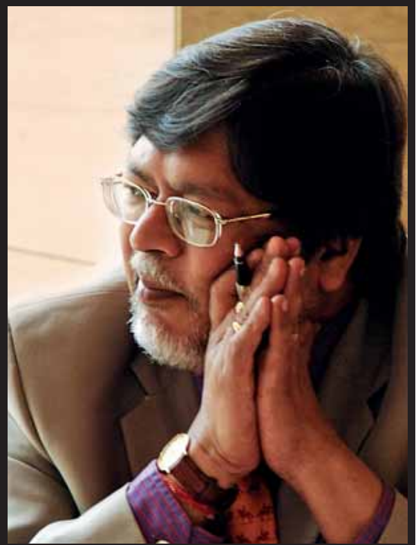
The Pioneer fondly remembers its Founder Editor Dr Chandan Mitra (December 12, 1954 to September 1, 2021) on his 69th birth anniversary.

speak about it," Fadnavis said. Asked whether others would also be treated in the same manner as NCP leader Nawab Malik, who was jailed and is out on bail on medical grounds, Fadnavis said it would be the same if they too faced such charges. Fadnavis had written to deputy CM Ajit Pawar expressing the BJP's reservations on inducting Malik into the ruling alliance. However, opposition parties have questioned Fadnavis over why the BJP did not have an issue with Praful Patel of the Ajit Pawar faction of the NCP who too is facing similar allegations. Asked to comment on Thackeray's statement that TDR (transferable development right) of the Dharavi redevelopment project must not be with (industrialist Gautam) Adani, Fadnavis pointed out that the MVA government had cancelled an earlier tender of the project despite Adani not being the winning bidder. Thackeray has a policy of opposing development works, Fadnavis said in a swipe at the former chief minister.