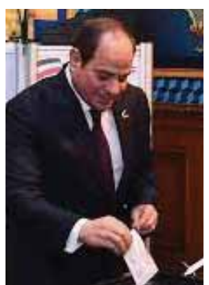
CAIRO

CAIRO Polling centres in Egypt opened on Monday, the second voting day in a presidential election that is certain to see President Abdel Fattah el-Sissi secure another term. The vote, which began across the Middle Eastern nation on Sunday, has been overshadowed by the Israel-Hamas war in Gaza, on Egypt's eastern borders.