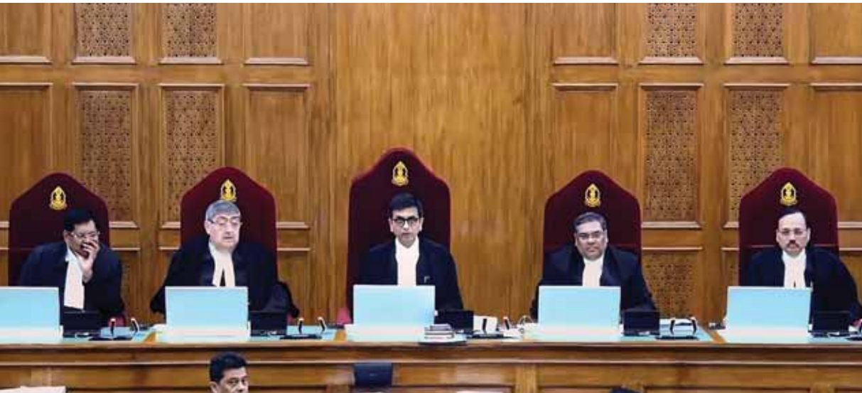
The five-judge bench comprising Chief Justice DY Chandrachud and Justices Sanjay Kishan Kaul, Sanjiv Khanna, BR Gavai and Surya Kant during pronouncement of verdict on a batch of petitions challenging the abrogation of Article 370 of the Constitution, in New Delhi, on Monday