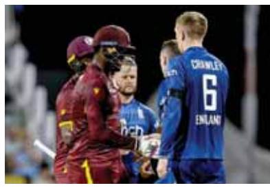
ed, the ICC said in a statement. Failure to do so for the third time in an innings (following two warnings) will result in a five-run penalty being imposed against the fielding team.

PTI ■ DUBAI The stop clock trial, which will restrict the amount of time taken between overs, will get underway during the white-ball series between West Indies and England, the sport's governing body ICC said on Monday. The trial will start with the first T20 between the West Indies and England on Tuesday in Barbados. The stop clock will restrict the amount of time taken between overs, meaning that the bowling team will need to be ready to bowl the first ball of their next over within 60 seconds of the previous over being completed, the ICC said in a statement. Failure to do so for the third time in an innings (following two warnings) will result in a five-run penalty being imposed against the fielding team. "We are continually looking at ways to speed up the pace of play across international cricket. "The stop clock trial in white ball international cricket follows the introduction of a successful new playing condition in 2022, which resulted in the fielding team only being allowed four fielders outside of the inner circle if they were not in a position to bowl the first ball of their final over in the stipulated time. "The outcomes of the stop clock trial will be assessed at the end of the trial period," Wasim Khan, ICC General Manager - Cricket, said.