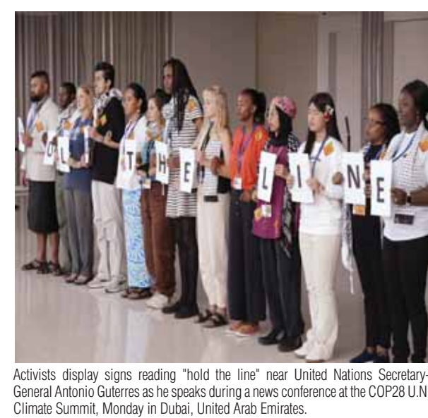
Activists display signs reading "hold the line" near United Nations Secretary-General Antonio Guterres as he speaks during a news conference at the COP28 U.N. Climate Summit, Monday in Dubai, United Arab Emirates.

UN Secretary-General Antonio Guterres returned to the summit on Monday and said it was "time to go into overdrive, to negotiate in good faith, and rise to the challenge". He said negotiators at the COP28 summit in particular must focus on the reduction of greenhouse gas emissions and climate justice. He said the global stock-take — the part of talks that assesses where the world is at with its climate goals and how it can reach them — should "phase out all fossil fuels" in order to reach the goal of limiting the rise of global temperatures to 1.5 degrees Celsius (2.7 degrees Fahrenheit) compared with pre-industrial times. That phase-out was, he said, "a central aspect" for the summit to be considered a success. "We can't keep kicking the can down the road," Guterres said in brief remarks. "We are out of road and almost out of time."