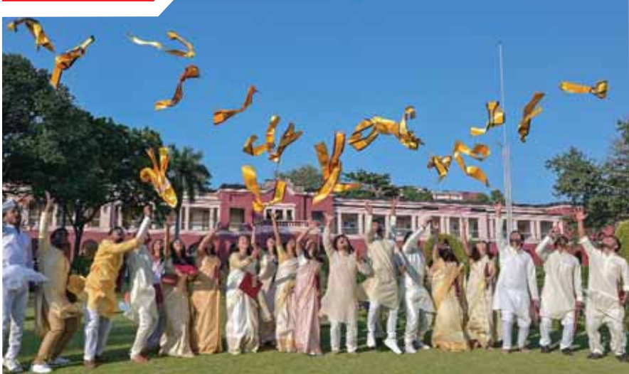
Students in jubilant mood after receiving their degree on 98th Foundation Day celebration of IIT in Dhanbad