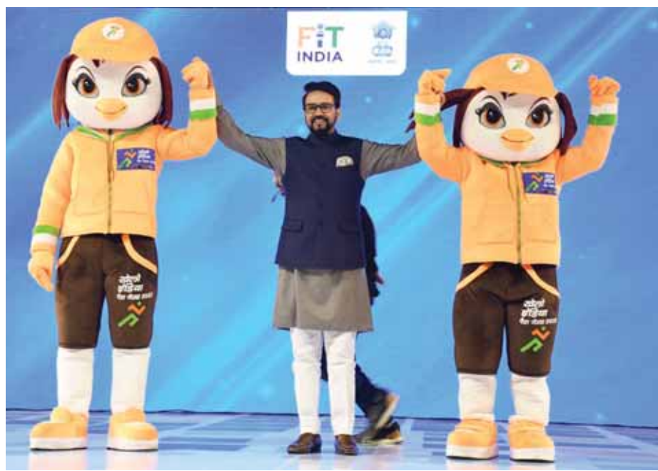
Union Minister for Information & Broadcasting, Youth Affairs and Sports, Anurag Singh Thakur, inaugurates the first ever Khelo India Para Games, in New Delhi, on Monday.