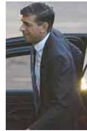
LONDON

British Prime Minister Rishi Sunak on Monday apologised to the families who lost loved ones in the COVID-19 pandemic as he opened his evidence to an ongoing public inquiry in a tough week, which will also see him tackle a feared revolt over a parliamentary vote on his Rwanda policy to deport illegal migrants.