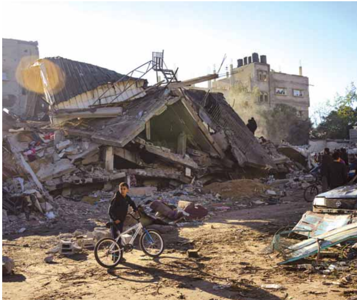
Palestinians search for bodies and survivors in the rubble of a residential building destroyed in an Israeli airstrike in Rafah southern Gaza Strip on Friday.

The moral liability to be harmed is acquired through satisfying the purpose, i.e., if that harm is in use to prevent further misconduct or compensation for the victims of previous wrongdoing. The liability to be harmed is not present in the lack of such a goal. Thus, it can be fortified that the liability