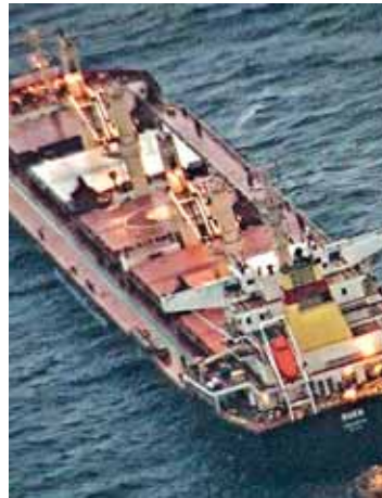
MV Ruen, a vessel with 18 crew onboard, that had sent a Mayday message indicating boarding by approx six unknown personnel. Indian Navy diverted its Naval Maritime Patrol aircraft undertaking surveillance in the area and its warship on Anti Piracy patrol in the Gulf of Aden to locate & assist MV Ruen

region and ensuring safety of merchant shipping, along with international partners and friendly foreign countries," the official said. MV Ruen, the vessel, reportedly lost control on Thursday, in a first significant piracy incident recorded after 2017. The attack has highlighted a major lapse in the ongoing anti-piracy efforts in the Arabian Sea. In response to the incident, the UK Marine Trade Operations issued a warning, urging vessels to exercise caution while traversing the Arabian Sea near Somalia. The Indian Navy is now on high alert in the region. Meanwhile, it has also advised ships to remain vigilant and report any suspicious activity.