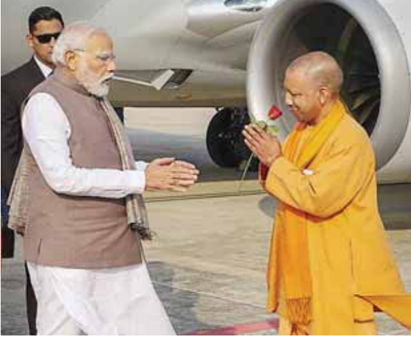
Prime Minister Narendra Modi being welcomed by Uttar Pradesh Chief Minister Yogi Adityanath on his arrival, in Varanasi, on Sunday

PM, India will become the third-largest economy in the world. The PM said, "Modi's guarantee" is being talked about a lot these days and more due to the recent Assembly polls. The PM, who is on a two-day visit to Varanasi, on Sunday launched the second edition of Kashi Tamil Sangamam at Namoo Ghat. He is scheduled to launch 37 projects worth over ₹19,000 crore for the development of the region. Union Education Minister Dharmendra Pradhan, Uttar Pradesh Chief Minister Yogi Adityanath, and top dignitaries from Central and State Government were present on the occasion. "In our country, many Government schemes have been made; based on the experience of all of them, I felt that the most important thing for the country to pay attention to is that the schemes of the Government should reach people at the right time without any problems. If there is a Pradhan Mantri Awas Yojana, then the houses should be built with the help of the Government. There is no need to run after the Government. The Government should work from the front, and since you have given me this work, about four crore families have