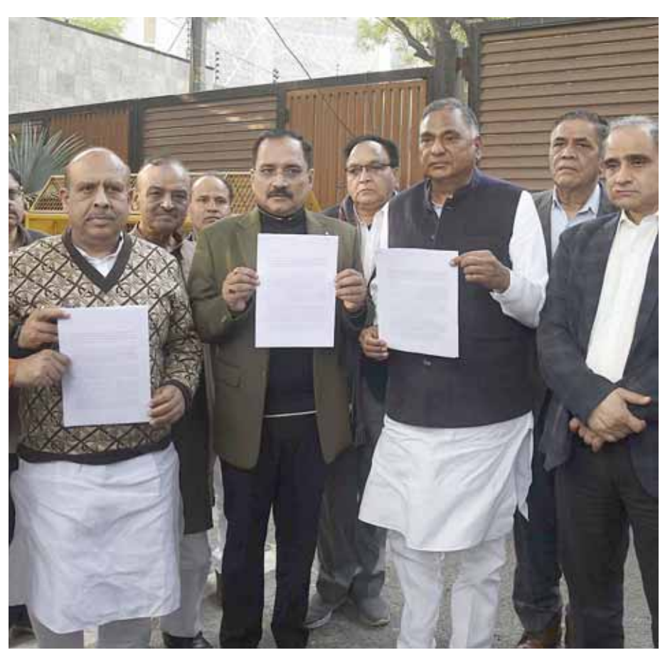
A delegation of BJP leaders, led by BJP president Virendra Sachdeva and Leader of Opposition in the Assembly Ramveer Singh Bidhuri, protested near the residence of Delhi Chief Minister Arvind Kejriwal in New Delhi on Sunday. The leaders submitted a memorandum, demanding an agricultural land compensation scheme for farmers in rural areas of Delhi and development in rural areas. Bidhuri said they will raise the demand of compensation policy of Ochandhi farmers in the Assembly on Monday. The BJP said the police prevented it from submitting memorandum to Kejriwal.

The relative humidity was recorded at 100 percent at 8:30 am, as per the IMD.