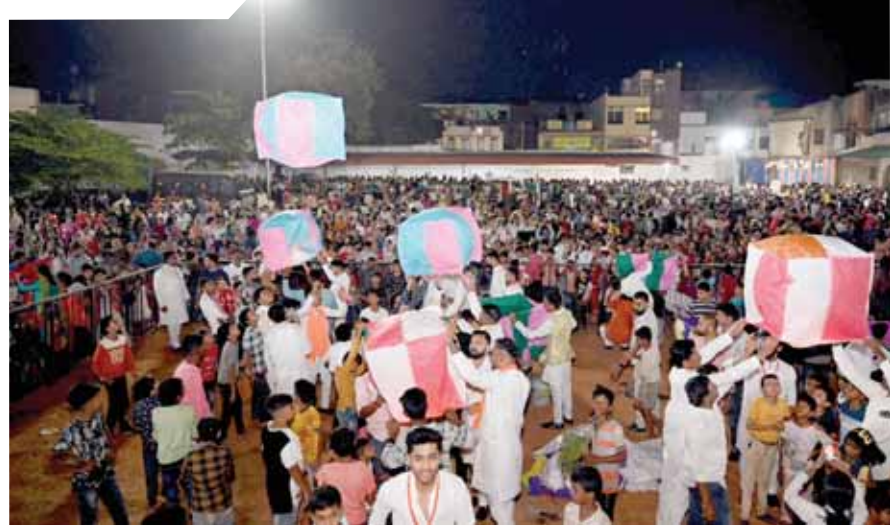
People celebrate the 'Hubballi Akashbutti Habba' with enthusiasm, in Hubballi