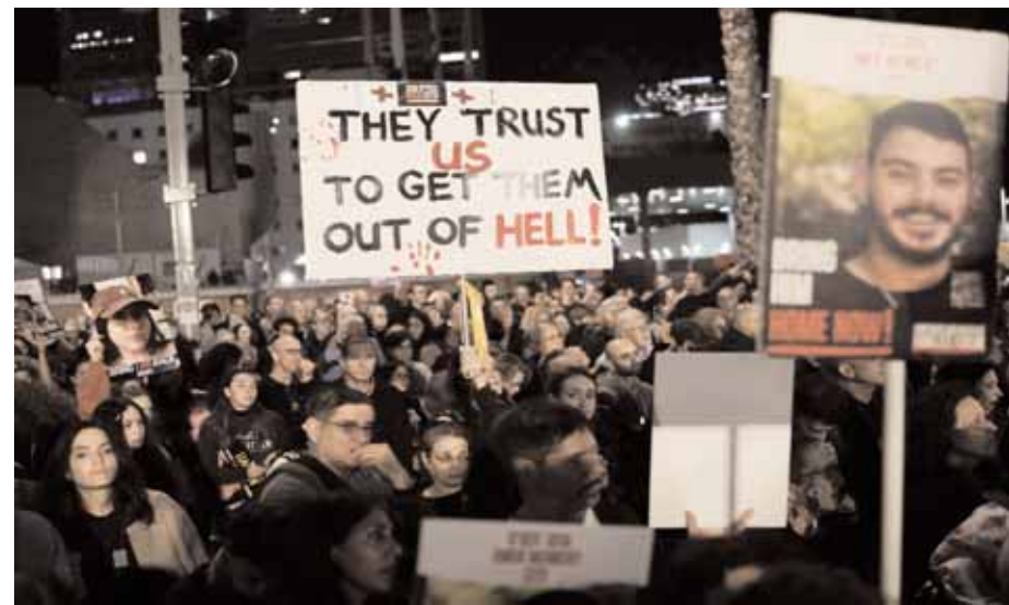
Families and supporters of Israeli hostages held by Hamas in Gaza attend a rally calling for their return, in Tel Aviv, Israel, Saturday. More than 100 Israeli hostages are held in Gaza after being abducted in a Hamas cross-border attack.

At least five Palestinians were killed during an Israeli raid in a built-up refugee camp in the West Bank town of Tulkarem, the Palestinian