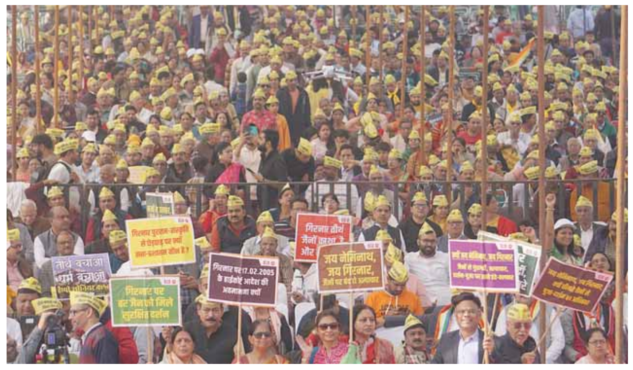
Jain devotees protest to save girnar parvat at RamLila Ground.

The student is a resident of a south Indian state and was pursuing a B.Tech degree from the Indian Institute of Technology Delhi, as per the officials.