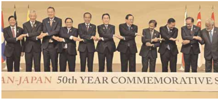
Leaders of ASEAN nations, from left, Philippine's President Ferdinand Marcos, Jr., Singapore's Prime Minister Lee Hsien Loong, Thailand Prime Minister Srettha Thavisin, Vietnam's Prime Minister Pham Minh Chinh, Indonesian President Joko Widodo, Japanese Prime Minister Fumio Kishida, Laos's Prime Minister Sonehay Siphandone, Brunei's Sultan Hassanal Bolkiah, Cambodia's Prime Minister Hun Manet, Malaysia's Prime Minister Anwar Ibrahim, East Timor's Prime Minister Xanana Gusmao pose for a group photo prior to their talks session during ASEAN-Japan 50th Year Commemorative Summit in Tokyo on Sunday.

The leaders, in a joint statement, called for strengthening their "mutually beneficial" partnership and working together for peace and stability in the Indo-Pacific. They also called to pursue greater prosperity for the region and to promote people exchanges among the younger generations, Kishida told a joint news conference with Indonesian President Joko Widodo, this year's ASEAN chair. The leaders adopted an implementation plan for 130 projects. Japan called to step up cooperation in security and defense, while reinforcing support for efforts in climate change and investment, including in the region's automotive industry, he said. "As divisions and confrontations deepen and the