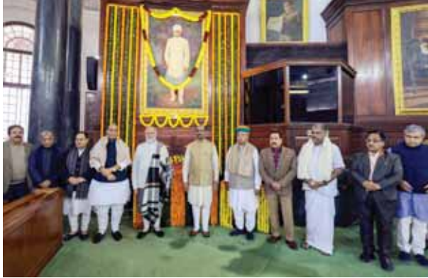
Justice Arjun Ram Meghwal, among other dignitaries, was held on the occasion of the 162nd birth anniversary of Malaviya. The bilingual (English and Hindi) work in 11 volumes, spread across about 4,000 pages,

is a collection of the writings and speeches of Malaviya, collected from every part of the country. These volumes comprise his unpublished letters, articles and speeches, including memorandums; the editorial content of Hindi weekly 'Abhyudaya' started by him in 1907; articles, pamphlets and booklets written by him from time to time. It also contains his speeches given in the Legislative Council of the United Provinces of Agra and Awadh between 1903 and 1910; statements given before the Royal Commission; speeches given during the presentation of bills in the Imperial Legislative Council between 1910 and 1920. There are also letters, articles and speeches written before and after the establishment of