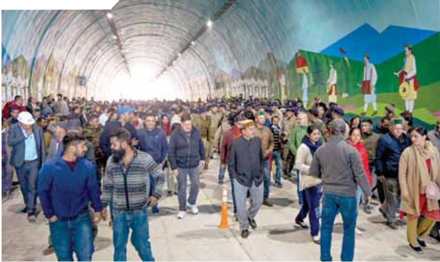
People take a look at newly constructed Sanjauli-Dhali tunnel in Shimla