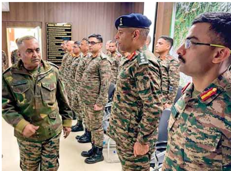
Chief of Army Staff General Manoj Pande during a visit to review the security situation in the Poonch sector, on Monday

A day after shunting out three senior officers including the Brigade Commander of the 13 Sector Rashtriya Rifles, pending a formal court of inquiry into the recovery of three civilian dead bodies under mysterious circumstances in the Surankote area of Poonch, Indian Army Chief General Manoj Pande on Monday urged Army commanders on the ground to conduct operations in the "most professional manner". Four soldiers were 'killed in action' during the ambush of two army vehicles by the foreign terrorists on December 21 in the Dera Ki Gali area of Surankote. The three civilians along with six others were picked up for questioning from the Topa Peer village in connection with the attack on the army vehicles. After the residents and aggrieved families alleged they were killed in custody, the Army authorities launched an internal probe into the matter. "General Manoj Pande COAS visited the Poonch sector and was given an update on the prevalent security situation. COAS interacted with commanders on the ground, and exhorted them to conduct the operations most professionally and remain resolute & steady against all challenges," the additional directorate general of public information (ADGPI) of the Indian Army said in a post on X, formerly Twitter. During his day-long visit, the Army Chief visited the Dera Ki Gali and took stock of the ongoing anti-terrorist operations to flush out the terrorists and later interacted with the