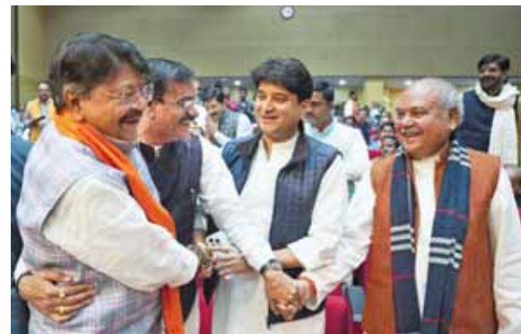
Madhya Pradesh Chief Minister Mohan Yadav and Union Minister Jyotiraditya Scindia during administration of oath to the newly appointed ministers at Raj Bhavan in Bhopal on Monday

The maximum strength of the Council of Ministers is 35, including the Chief Minister. Madhya Pradesh's