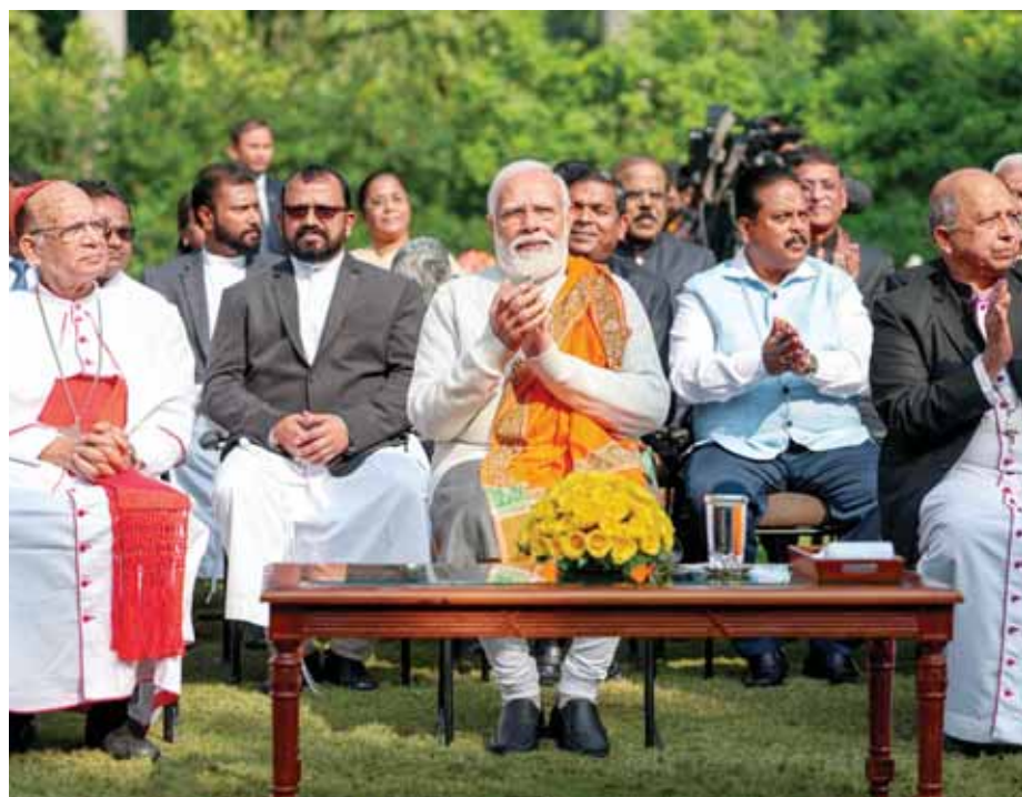
Prime Minister Narendra Modi with Christian community members during Christmas celebrations at 7, Lok Kalyan Marg, in New Delhi, on Monday

Modi highlighted that Jesus Christ's life message was centred on compassion and service. He worked for an inclusive society where justice was for all. These values serve as a "guiding light" in his government's development journey, the Prime Minister