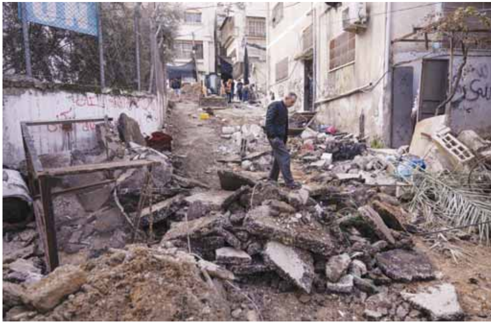
Palestinians walk through the aftermath of the Israeli military raid on Nur Shams refugee camp in the West Bank, Wednesday. Israel's forces raided a refugee camp in the northern occupied West Bank, killing at least six Palestinians, Palestinian health authorities said early on Wednesday.

With much of northern Gaza levelled, Palestinians fear a similar fate awaits other areas, including Khan Younis, where Israeli forces launched ground operations in early December, and a cluster of built-up refugee camps in central Gaza where the focus has shifted this week.