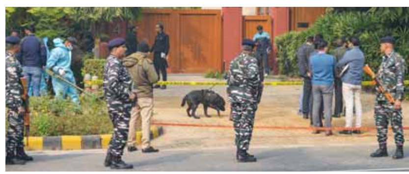
Security officials with the Forensic and K9 unit near the Israel Embassy during an investigation after a reported low intensity blast nearby in New Delhi on Wednesday