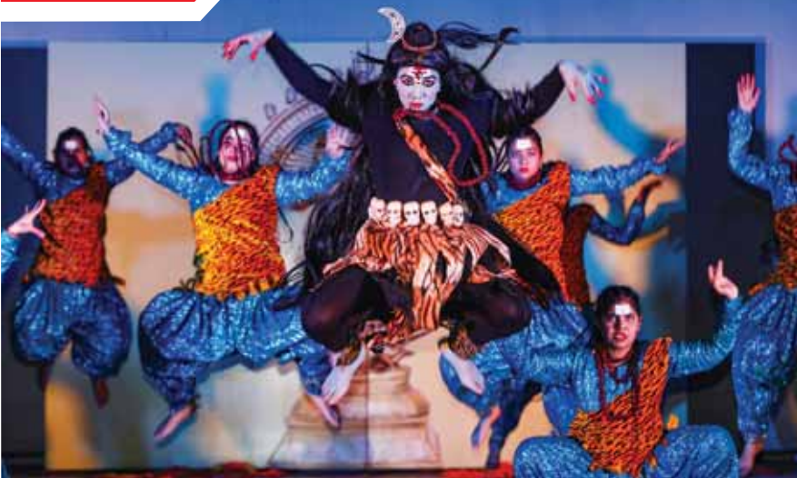
NCC Cadets perform during the full dress rehearsal for the 2024 Republic Day parade, in Jammu