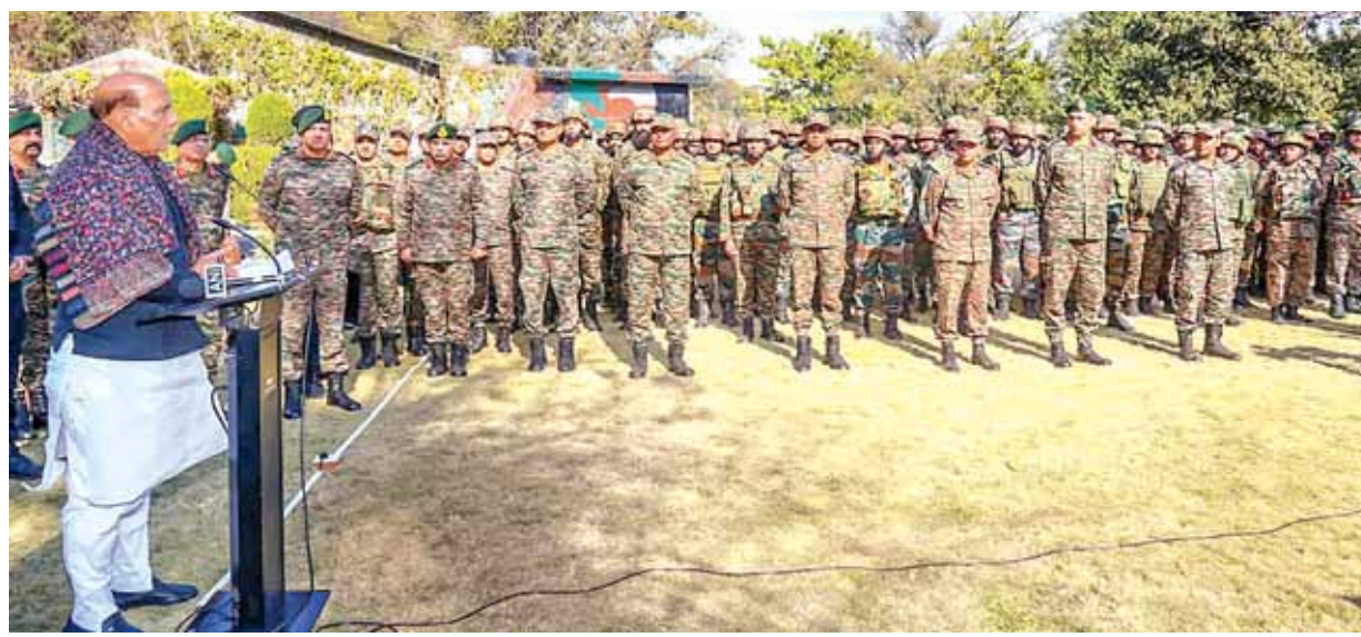
Defence Minister Rajnath Singh during an interaction with Army personnel in Rajouri on Wednesday

Defence Minister Rajnath Singh on Wednesday said that soldiers must safeguard national interests and also win the hearts of the people while discharging their duties. Addressing a gathering of troops in one of the forward locations in Rajouri, he emphasised, "The Indian Army is not an ordinary army. Soldiers are our protectors, tasked not only with safeguarding national interests but also with winning the hearts of the people."