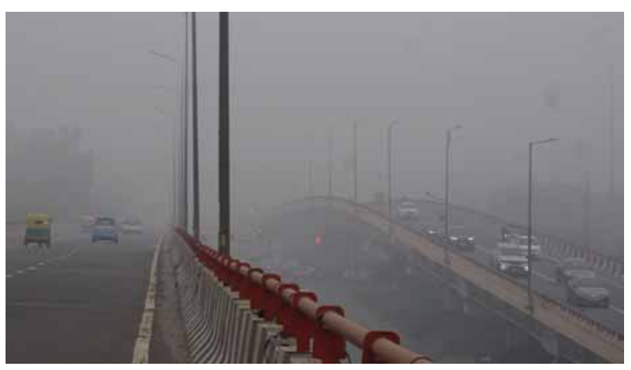
Commuters on a foggy morning in Delhi on Wednesday

Amid cold wave in Delhi and National Capital Region (NCR), with the temperature at 7.8 degrees Celsius, slightly higher than usual, visibility in various parts of Delhi was significantly affected on Wednesday morning. Dense fog enveloped the city during the early hours, causing nearly zero visibility and posing challenges for residents. An orange alert, calling for the residents to remain prepared, was issued by the India Meteorological Department (IMD) across the city at 8 am as visibility in many parts remained around 50 metres. IMD advised people to use fog lights during driving, cover up the face while going out, avoid outings unless emergency, and be in touch with airlines, railways, and State transportation ahead of the scheduled journey. IMD further advised the power department to keep maintenance teams ready as chances of tripping are high during dense fog. The IMD advisory further said dense fog contains particulate matter and other pollutants and, in case exposed, it gets lodged in the lungs, clogging them and decreasing their functional capacity which increases episodes of wheezing, coughing, and shortness of breath. This also impacts peo-