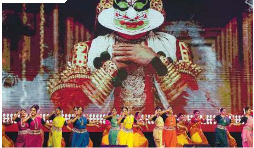
Eminent dancer Dona Ganguly's troupe performs on 29th Kolkata International Film Festival, in Kolkata