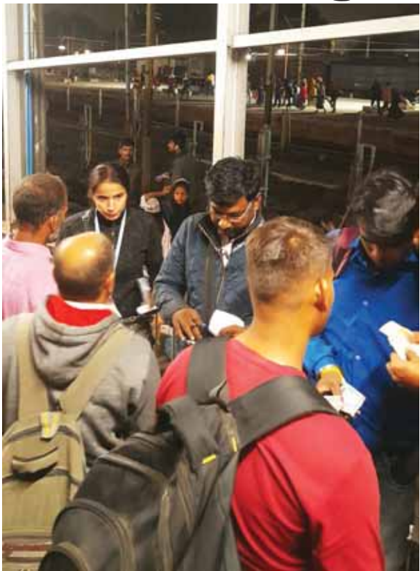
Massive ticket checking at Prayagraj Junction

MISHAP: The former head of Kodhnia village, who was returning on foot in Meja was hit by a bullet rider. Both the former head and Bullet rider were injured in the accident and were taken to the hospital where the former head died. The accident occurred in front of Manu Ka Pura village on Prayagraj-Mirzapur road. The police have sent the body for the post-mortem examination.