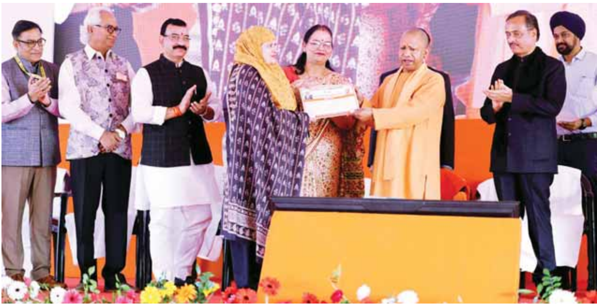
Chief Minister Yogi Adityanath with a beneficiary during the programme in Lucknow on Thursday

He noted that these schemes were now providing benefits to the eligible people without any discrimination, despite the revenue sources of the country and the government being the same as in the past. "In the last nine years, Prime Minister Narendra Modi has provided free toilets