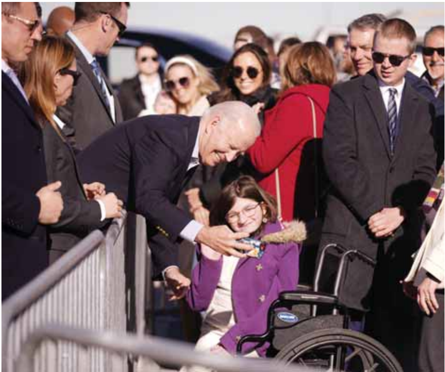
President Joe Biden takes a photo with people on the tarmac before he boards Air Force One at Denver International Airport in Denver, Wednesday, to travel to Pueblo Memorial Airport in Pueblo, Colo.

Jerusalem has been relatively quiet since the outbreak of the recent round of violence and no major skirmishes have been reported despite several calls by Hamas to Palestinians in Jerusalem to support them.