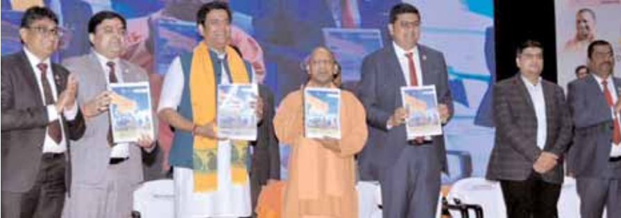
Chief Minister Yogi Adityanath releasing a book at ICAI seminar in Gorakhpur on Thursday

He stated that our work is not just about the ease of doing business, but also about achieving the ease of living goals, i.e. ensuring that no one faces any problems at any level. “For this, the Central and state governments are ready to