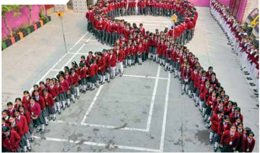
School students form 'red ribbon', Universal symbol of awareness about HIV, in Moradabad