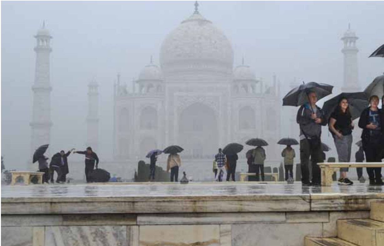
Tourists visit the Taj Mahal amid rainfall during a cold winter morning in Agra on Thursday.