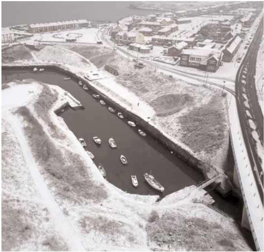
Snow blanketed Seaton Sluice in Northumberland, England, Sunday, December 3, 2023 as temperatures are tipped to plunge to as low as minus 11C (12.2 F) in parts of the UK over the weekend

"Through FAO, USAID will support strengthening AMR surveillance in animal health; strengthening of zoonotic disease surveillance; and improving biosafety and biosecurity in Nepal. In total, USAID will provide up to $6.75 million for these efforts over the next three years, subject to availability of funds," it said.