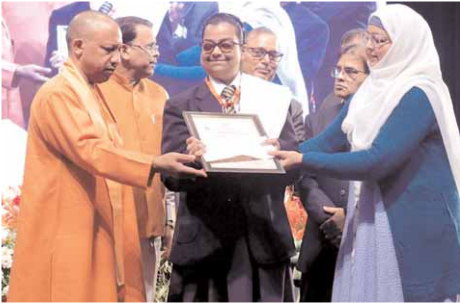
Chief Minister Yogi Adityanath honouring differently-abled students at SMNRU in Lucknow on Sunday

abled suffering from leprosy used to receive a pension of Rs 2,500 while the present state government has increased it to Rs 3,000, he added.