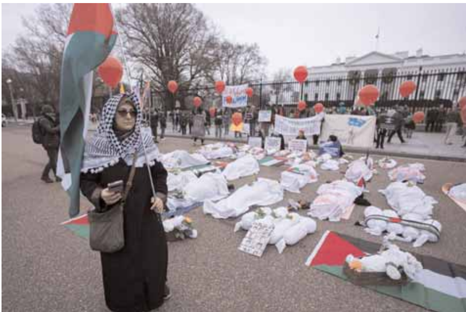
Palestinian supporters calling for an immediate ceasefire stage a mock funeral with dolls and people wrapped in white cloth smeared with red paint to resemble Palestinian victims of the Israel-Hamas war, in front of the White House in Washington, Saturday.

The main hospital in Khan Younis received at least three dead and dozens wounded Sunday morning from an Israeli strike that hit a residential building in the eastern part of the city, according to an Associated Press journalist at the hospital. Separately, the bodies of 31 people who were killed in Israeli bombardment across the central areas of the strip were taken to the Al-Aqsa