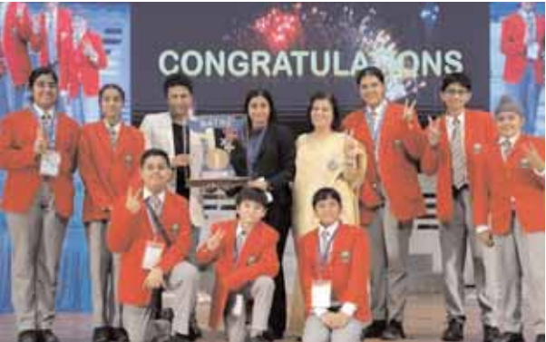
Jaycees Public School (Rudrapur, Uttarakhand) won the first runner-up trophy.

The four-day International Mathematics Olympiad, ‘Mathletics-2023’, organised by City Montessori School, Rajajipuram Campus II, concluded at Kanpur Road auditorium on Sunday. Participating students and prize-winners in various competitions from Nepal, Sri Lanka, Bangladesh and various states of India were honoured and awarded shields, medals and certificates at the closing ceremony. Students of BCM Arya International School (Ludhiana, Punjab) bagged the overall championship trophy of Mathletics-2023 whereas