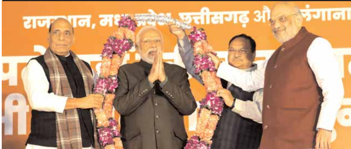
Prime Minister Narendra Modi with BJP National President JP Nadda, Defence Minister Rajnath Singh and Union Home Minister Amit Shah during celebrations after party's victory in elections to the Legislative Assemblies of Madhya Pradesh, Rajasthan and Chhattisgarh, at BJP headquarters, in New Delhi, on Sunday