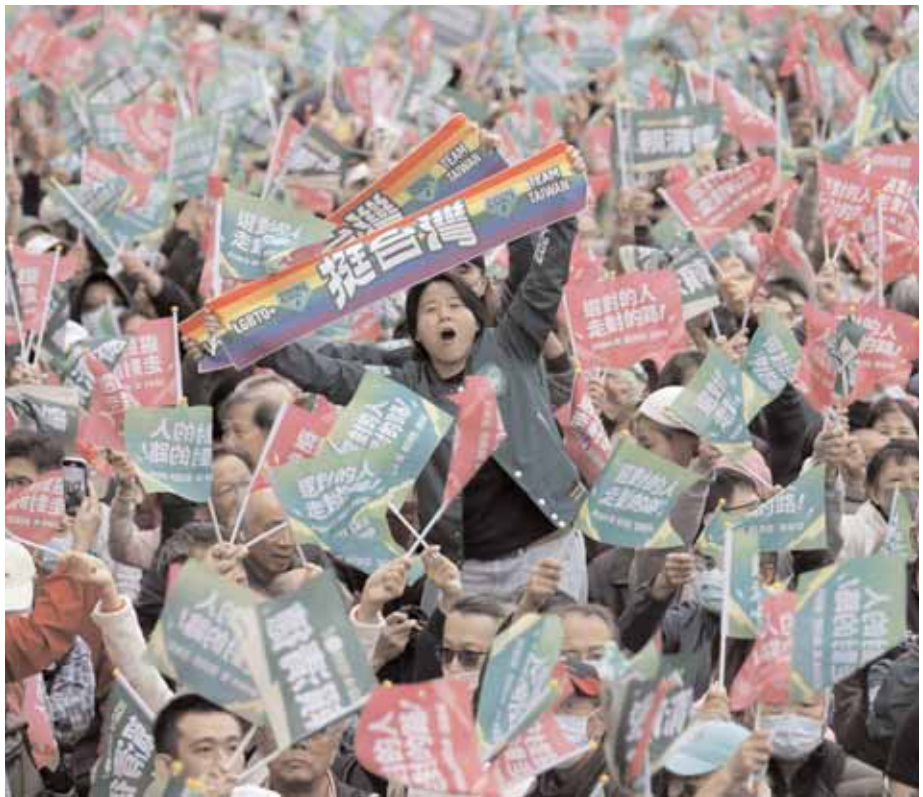
Supporters of Taiwan President and Democratic Progressive Party presidential candidate William Lai cheer as Lai launches his election campaign in Taipei, Taiwan, Sunday. Taiwan will hold its presidential election on Jan. 13 2023.

Criticism of Israel's conduct in the war has peppered much of the summit from world leaders, as well as activists who can be seen through the site wearing the traditional checkered keffiyeh, or scarf, associated with the Palestinians.