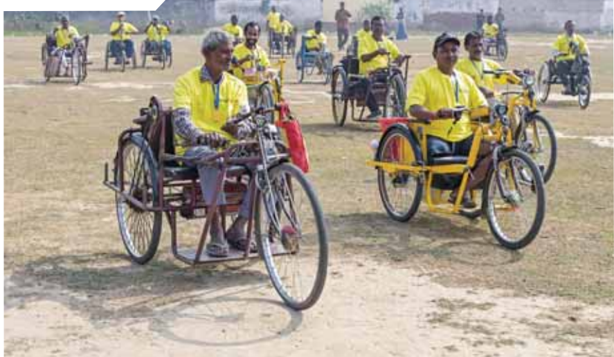
Disabled People participate in a tricycle race, on International Day of Persons with Disabilities, in Nadia