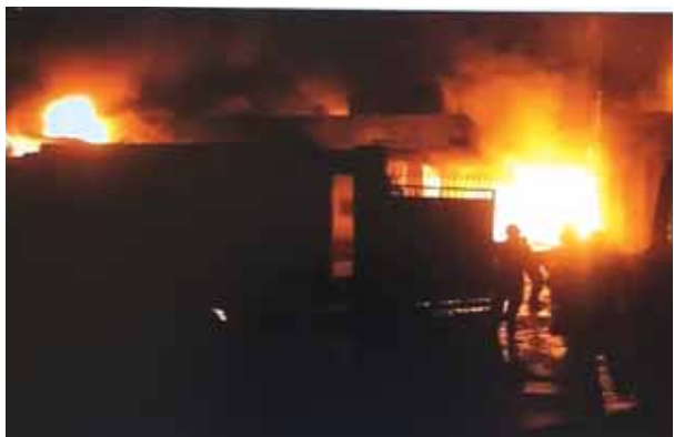
A fire broke out in an ink factory at site No.5, Panki, late on Saturday night.