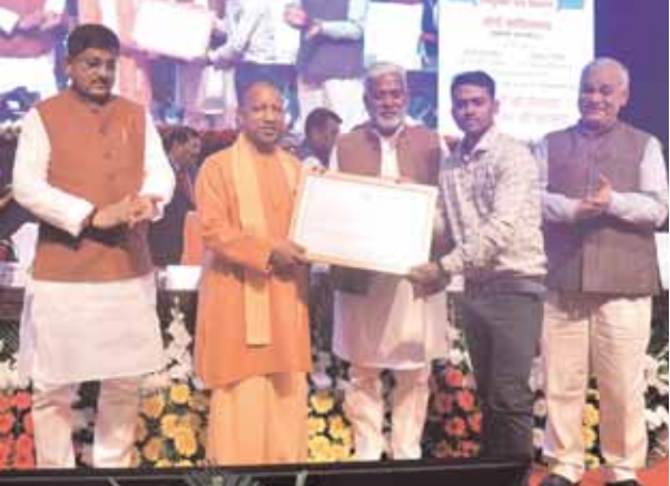
Chief Minister Yogi Adityanath distributing appointment letters to assistant boring technicians during a programme in Lucknow on Sunday

He pointed out that 70 per cent of irrigation in UP comes from groundwater and for the remaining 30 per cent, canals and other channels were spread out. He said 80 per cent of the population was supplied