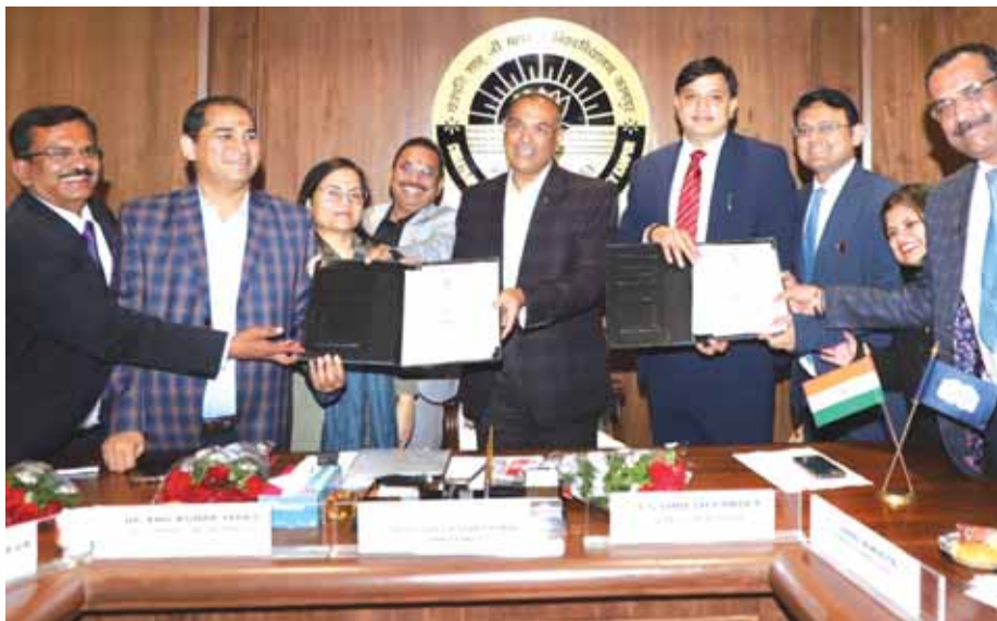
The CSJMU signing MoU with the ICSI on Saturday