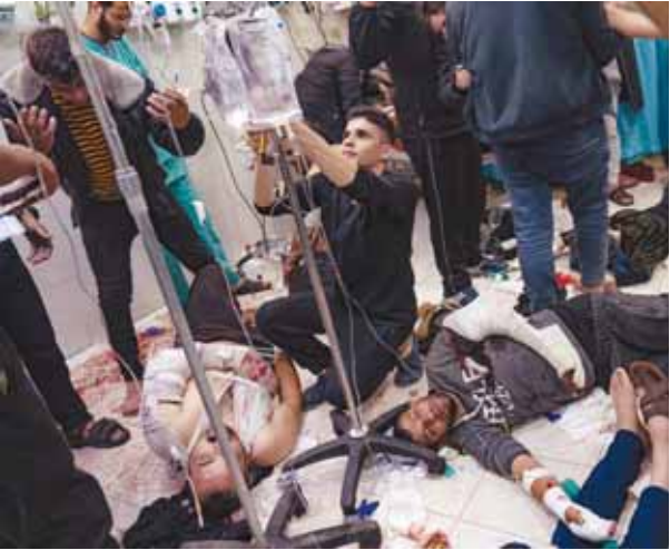
Palestinians are treated as they lie on the floor after being wounded in an Israeli army bombardment of the Gaza Strip, in the hospital in Khan Younis, Tuesday.

Israel says it must dismantle Hamas’ extensive military