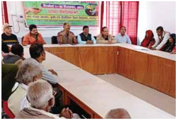
Soil testing workshop being held at CSAU&T on Tuesday.

He advised the farmers that they need to use vermicast (also called worm castings, worm humus, worm poop, worm manure, or worm faeces) the end-product of breakdown of organic matter by earthworms. He said these excreta had been shown to contain reduced levels of contaminants and a higher saturation of nutrients than the organic materials before vermicomposting. He said in addition they can also adopt NADEP method of composting which is aerobic decomposition of organic matter. He said this method takes care of all disadvantages of heaping with farm residue and cattle shed wastes in open. He said soil fertility can be further improved by incorporating cover crops that add organic matter to the soil which led to improved soil structure and promoted a healthy and fertile soil by using green manure or growing legumes to fix nitrogen from the air through the process of