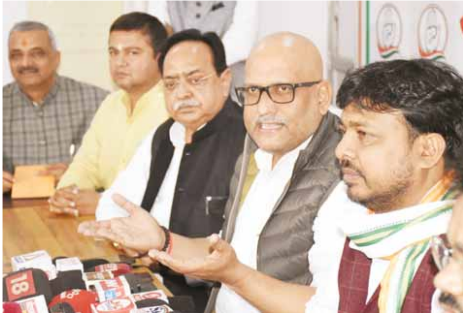
UPCC chief Ajay Rai and others during a press conference in Lucknow on Tuesday