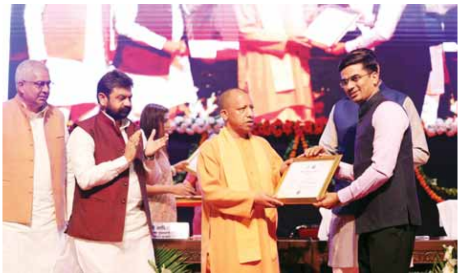
Chief Minister Yogi Adityanath on Tuesday handed over appointment letters to assistant professors, staff nurses and AYUSH teachers during a programme in Lucknow

In a testimony to transparency in recruitment process, a massive function was organised in which appointment letters were given to the new appointees in the Health Department, including assistant professors. Chief Minister Yogi Adityanath led the function in Lucknow while public representatives distributed the appointment letters in districts. On Tuesday, appointment letters were given to 278 assistant professors, 2,142 staff nurses and 48 AYUSH teachers. "It is a major accomplishment of Chief Minister Yogi Adityanath as it has increased transparency in recruitments. It is not only ensuring provision of employment to the maximum number of youths, but also appointment of the most deserving, meritorious and eligible ones on vacant positions across sectors," a government spokesman said here on Tuesday. In this sequence, the state government held an appointment letter distribution ceremony across the state. The function was led by the chief minister who distributed the appointment letters at a function held in the Lok Bhavan. Earlier on Sunday, Chief Minister Yogi Adityanath had distributed appointment letters to 242 assistant boring technicians at the Lok Bhavan. The newly-appointed youths expressed their gratitude to Chief Minister Yogi