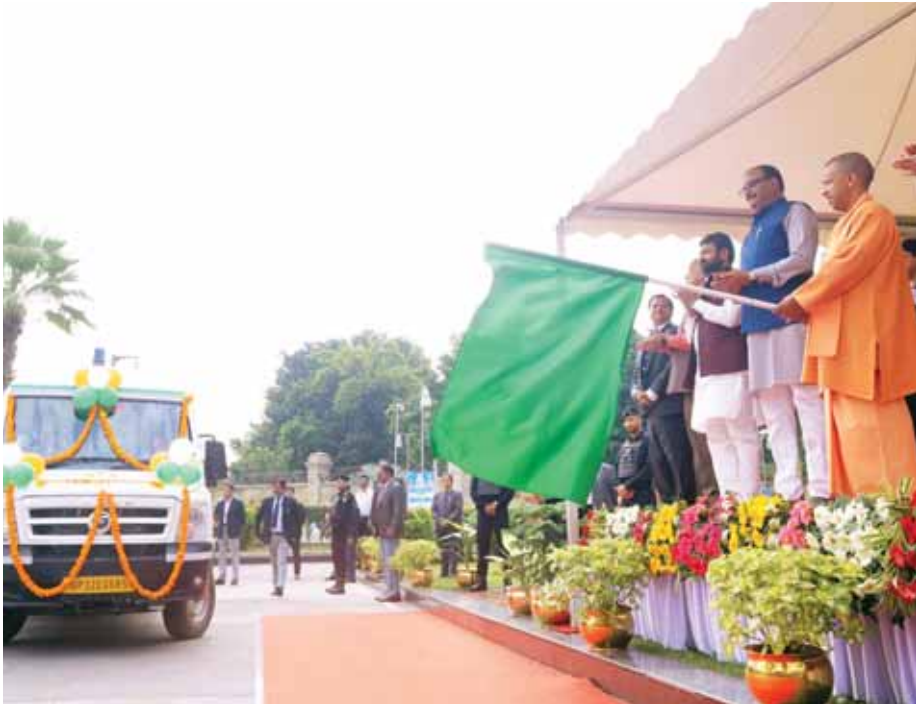
Chief Minister Yogi Adityanath flagging off an ambulance equipped with advanced life support system, at Lok Bhavan in Lucknow on Tuesday

Chief Minister Yogi Adityanath said that faculty members of medical colleges should sit in the Out Patient Department (OPD) regularly and encourage research in medical institutions by preparing case studies. Speaking at an event organised as part of Mission Rozgar at Lok Bhavan, the chief minister said on Tuesday that Uttar Pradesh was able to control encephalitis because of the efforts of health workers. "More research needs to be done on various illnesses and the professors and assistant professors of both Allopathic and AYUSH should hold OPD," he said. The chief minister highlighted the significant positive changes since 2017, stating that Uttar Pradesh, previously experiencing an identity crisis and lacking in development, has witnessed a transformation. "As a result of the government's efforts over the last six and a half years, individuals in Uttar Pradesh not only proudly express their identity, but even those who are not originally from UP proudly associate themselves with the state," he said. Chief Minister Yogi emphasised that under the guidance of Prime Minister Narendra Modi, Uttar Pradesh has significantly enhanced its healthcare services in the last six and a half years. "In the