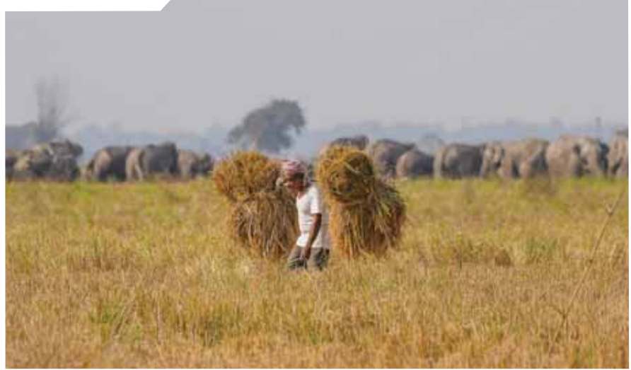
A farmer carries harvested rice as a herd of wild elephants gathers in a field in search of food, in Nagaon