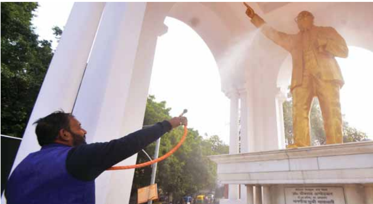
Dr Bhimrao Ambedkar's statue being cleaned on the eve of his birth anniversary, in Lucknow on Tuesday