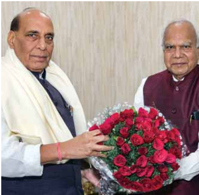
Defence Minister Rajnath Singh with Punjab Governor Banwarilal Purohit during a meeting in New Delhi on Tuesday

Referring to the Indo-Pacific, Modi said closer cooperation between India and Kenya in the region will advance common efforts.