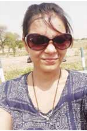
File photo of the deceased