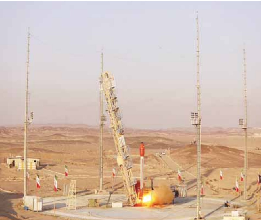
This photo released by the Iranian Defense Ministry on Wednesday claims to show a rocket with a capsule carrying animals is launched from an undisclosed location into orbit, Iran. Iran said Wednesday it sent a capsule into orbit carrying animals as it prepares for human missions in coming years.

Reports said the country's Defense Ministry built and launched the Salman rocket while the capsule was built by the Iranian civil space agency. Media reports did not say where the launch took place. Iran usually makes launches from Imam Khomeini Space Centre in northern Semnan province. It says its satellite program is for scientific research and other civilian applications. The US and other Western countries have long been suspicious of the program because the same technology can be used to develop long-range missiles.