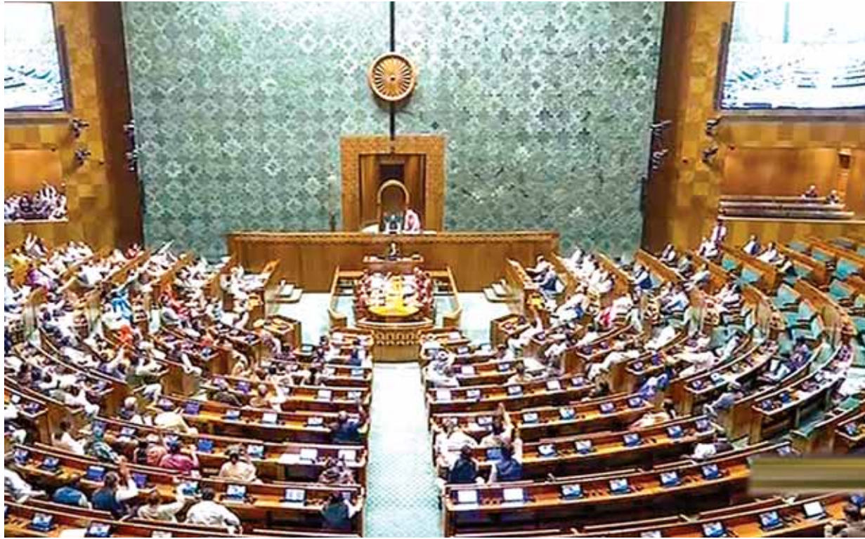
Parliamentarians in the Lok Sabha during the Winter session of Parliament, in New Delhi, on Wednesday