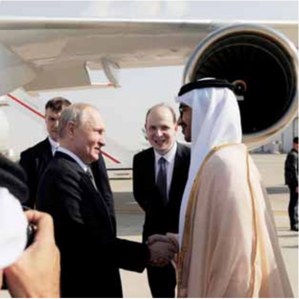
United Arab Emirates Foreign Minister Abdullah bin Zayed Al Nahyan, right, greets Russian President Vladimir Putin upon his arrival at an international airport in Abu Dhabi, United Arab Emirates, Wednesday.

Ukrainians on hand for the event expressed outrage over Putin being in the country at