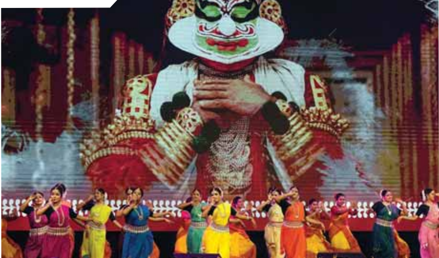
Eminent dancer Dona Ganguly's troupe performs on 29th Kolkata International Film Festival, in Kolkata