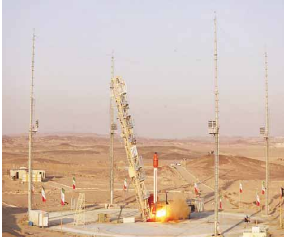
This photo released by the Iranian Defense Ministry on Wednesday claims to show a rocket with a capsule carrying animals is launched from an undisclosed location into orbit, Iran. Iran said Wednesday it sent a capsule into orbit carrying animals as it prepares for human missions in coming years.

Reports said the country's Defense Ministry built and launched the Salman rocket while the capsule was built by the Iranian civil space agency. Media reports did not say where the launch took place. Iran usually makes launches from Imam Khomeini Space Centre in northern Semnan province. It says its satellite program is for scientific research and other civilian applications. The US and other Western countries have long been suspicious of the program because the same technology can be used to develop long-range missiles.