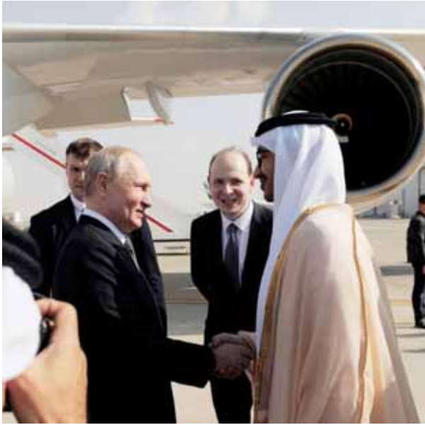
United Arab Emirates Foreign Minister Abdullah bin Zayed Al Nahyan, right, greets Russian President Vladimir Putin upon his arrival at an international airport in Abu Dhabi, United Arab Emirates, Wednesday.

Ukrainians on hand for the event expressed outrage over Putin being in the country at