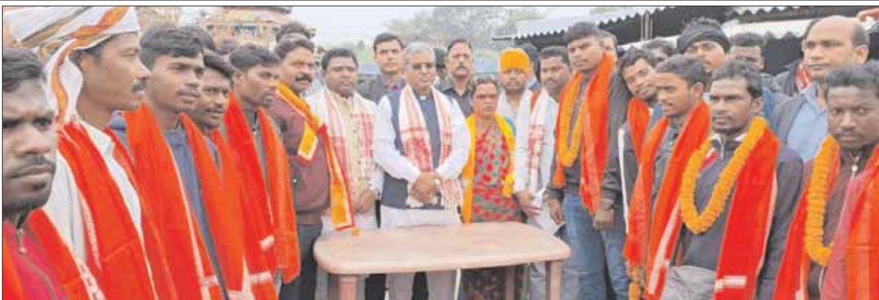
BJP State President Babulal Marandi during 'Adivasi Adhikar' rally in Pakur on Wednesday.

Deepak Prakash said that the reason behind Jharkhand's mines not opening is that a gang of organized criminals and brokers are working under the protection of the government. Illegal mining is taking place through these criminals and brokers. The revenue of the state and central government is decreasing.