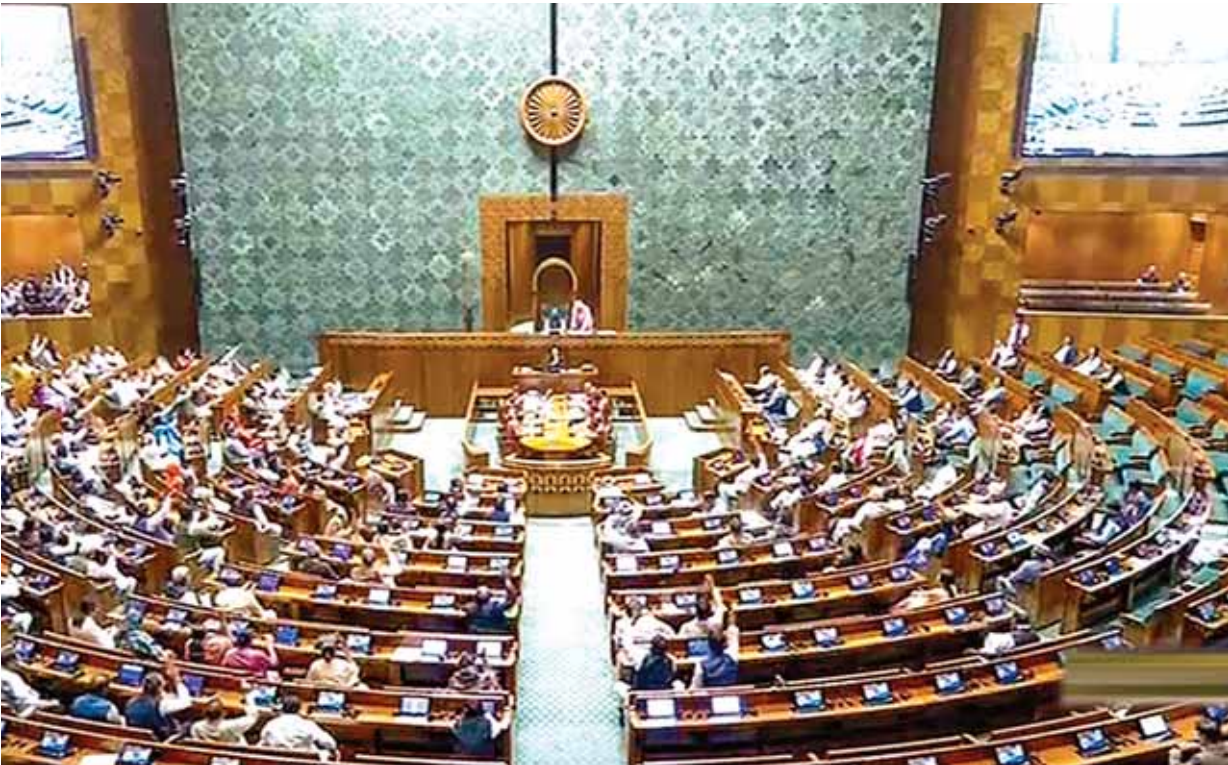
Parliamentarians in the Lok Sabha during the Winter session of Parliament, in New Delhi, on Wednesday