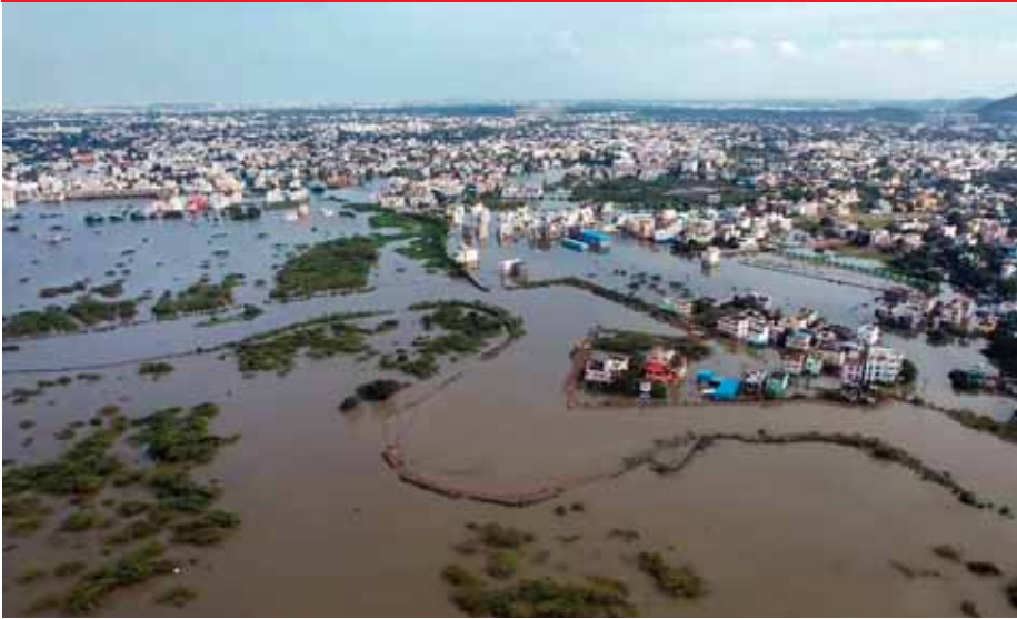
A drone visual shows an area that is flooded after the landfall of Cyclone Michaung, in Chennai, on Wednesday