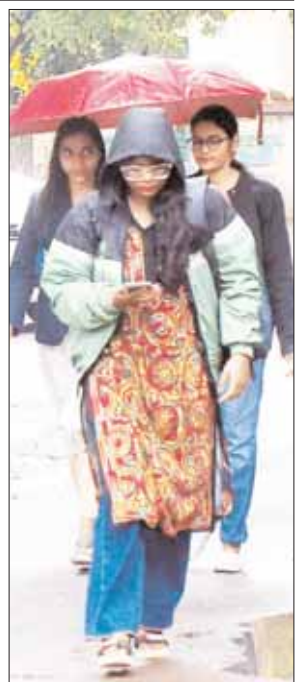
Girls used umbrellas during rain owing to Cyclone Michaung, in Ranchi on Wednesday.