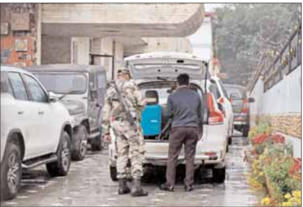
Police personnel seen as the Income Tax officials conduct a survey at the residence of Congress MP Dheraj Sahu in connection with the disproportionate asset case, in Ranchi on Wednesday.