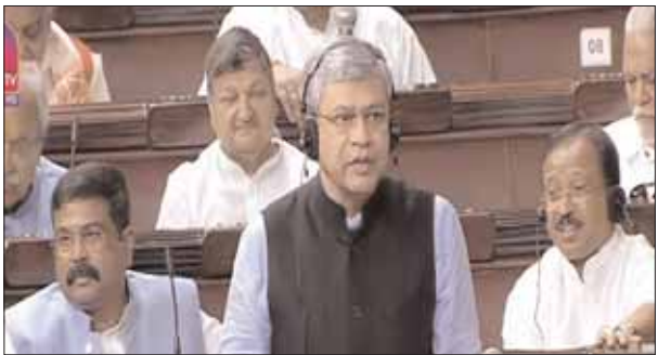
A TV grab of Railway Minister Ashwini Vaishnav in the parliament. (File)

Union Railway Minister Ashwani Vaishnav on Wednesday said that due lack of cooperation from the state government, railway projects in state is getting delayed. Vaishnav, was replying to the query raised by Ranchi MP Sanjay Seth in Lok Sabha. Seth had asked in the Lok Sabha about number of underpasses or railway over bridges being constructed by the Railways in Ranchi. The MP also sought details in Parliament about the places where underpass and railway overbridges are being constructed and the state government positivity about the projects.