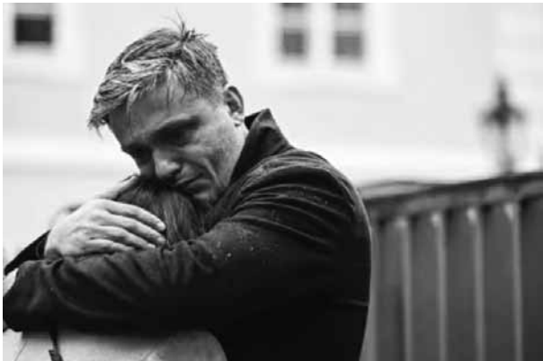
Mourners hug outside the headquarters of Charles University after a mass shooting in Prague, Czech Republic, Friday.