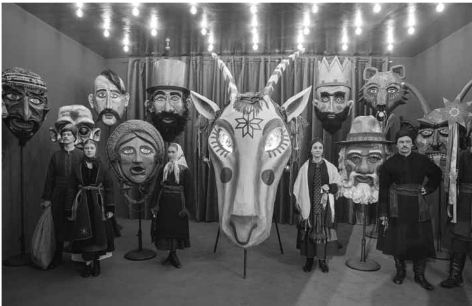
Activists dressed in national costume act in a Christmas performance a few days before Christmas at a city central railway station in Kyiv, Ukraine, on Thursday.

The withdrawal of foreign military missions is already affecting security in Niger, where the number of attacks has surged, according to Oluwole Ojewale with the Dakar-based Institute for Security Studies.