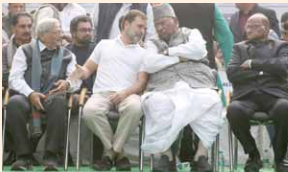
Congress president Mallikarjun Kharge talks with party leader Rahul Gandhi as CPI(M) general secretary Sitaram Yechury and NCP chief Sharad Pawar look on during a protest of INDIA bloc at Jantar Mantar in New Delhi on Friday

PIONEER NEWS SERVICE ■ NEW DELHI/PATNA/ MUMBAI/ KOLKATA