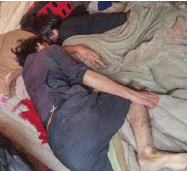
Bodies of labourers killed in Pakistan's Khyber Pakhtunkhwa province