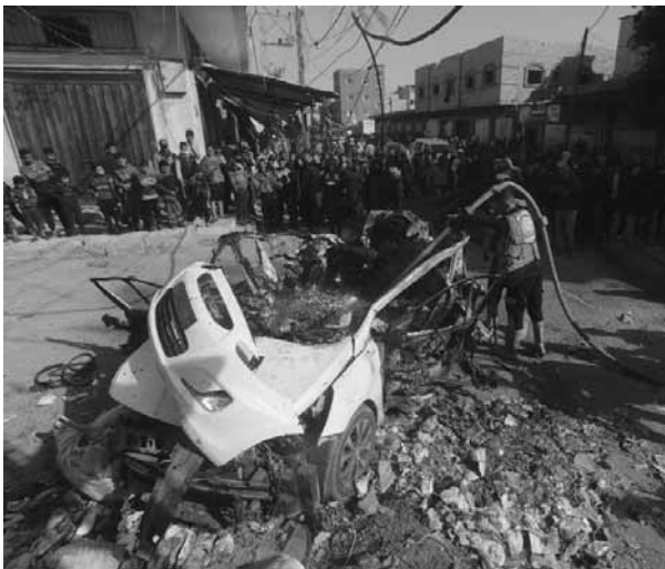
Palestinians stand around a car targeted in an Israeli airstrike on a car in Rafah, Gaza Strip on Friday.

“That such a brutal conflict has been allowed to continue