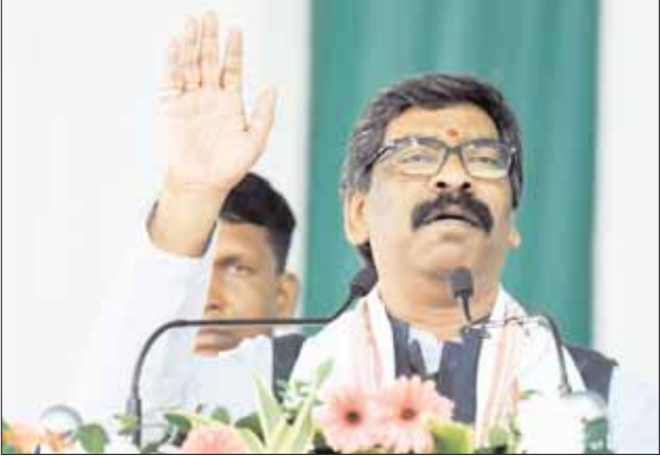
Chief Minister Hemant Soren addresses a gathering during the "Aapki Yojana - Aapki Sarkar - Aapke Dwar" programme at Modidih village of Baghmara Panchayat located in Baliapur block of Dhanbad district, on Friday.

20th camp under the program "Aapki Yojana-Aapki Sarkar Aapke Dwar" in which I myself am participating. By coming to these camps, I am trying to see what the progress of the government schemes is and how people are getting benefits from it. Our effort is to ensure that the government's schemes come to fruition in reality, so that the poor, the needy and the deprived can benefit from it.