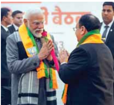
Prime Minister Narendra Modi being welcomed by BJP national president JP Nadda upon his arrival to attend BJP’s national office-bearers’ meeting at BJP headquarters in New Delhi on Friday

At the head of the 2024 Lok Sabha elections, the BJP’s national office bearers met on Friday to deliberate and chart out the party’s strategy for the upcoming polls. The two-day meeting was chaired by BJP chief JP Nadda and attended by Prime Minister Narendra Modi, BJP State presidents, incharge of different States, and organisational general secretaries of States, among others. The BJP’s national office bearers also discussed the results of the recently concluded Assembly polls in five States. Addressing the office bearers, sources said Prime Minister Narendra Modi appreciated the hard work done by workers and leading the three States to an excellent win. He mentioned that in the coming days, they have to work even harder and that not a single seat where the party contests should be taken lightly. “Each vote, each seat is valuable to maintain the momentum of growth in the nation. All should carry forward the Viksit Bharat Yatra ahead,” sources quoted Modi in the meeting. He will address the party leaders again on Saturday at the party’s national headquarters.