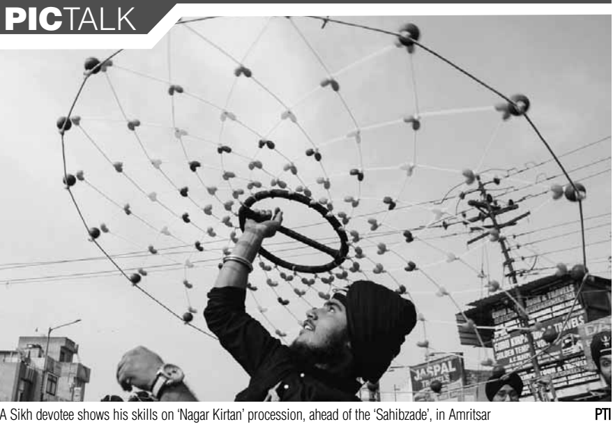
A Sikh devotee shows his skills on 'Nagar Kirtan' procession, ahead of the 'Sahibzada', in Amritsar

On the sidelines also, there was no dearth of controversies. Trinamool Congress' (TMC) suspended MP Kalyan Banerjee was seen mimicking Vice-President Jagdeep Dhankhar while Congress leader Rahul Gandhi filmed the act. Of course, it did not go down well with the ruling dispensation but then an MP cannot be suspended while under suspension. The Opposition has claimed that the Government's move was an attempt to stifle debate. The Opposition pressed for a statement on Parliament security breach but the Government, in turn, accused it of intentionally disrupting proceedings. In response, the Speaker took disciplinary action, including the suspension of members. The imposition of suspensions is a mechanism to maintain order and discipline, but it also sparks debates about the balance between freedom of expression and maintaining decorum in the hallowed halls of democracy. Amidst the political drama, Parliament managed to address a few critical legislative matters. The session's adjournment after a series of high-profile events marks a significant chapter in India's parliamentary history. As the political dynamics evolves before the general elections due next year, the last session of import of this Lok Sabha will go down in the annals of history as the most dramatic, traumatic and cryptic session ever.