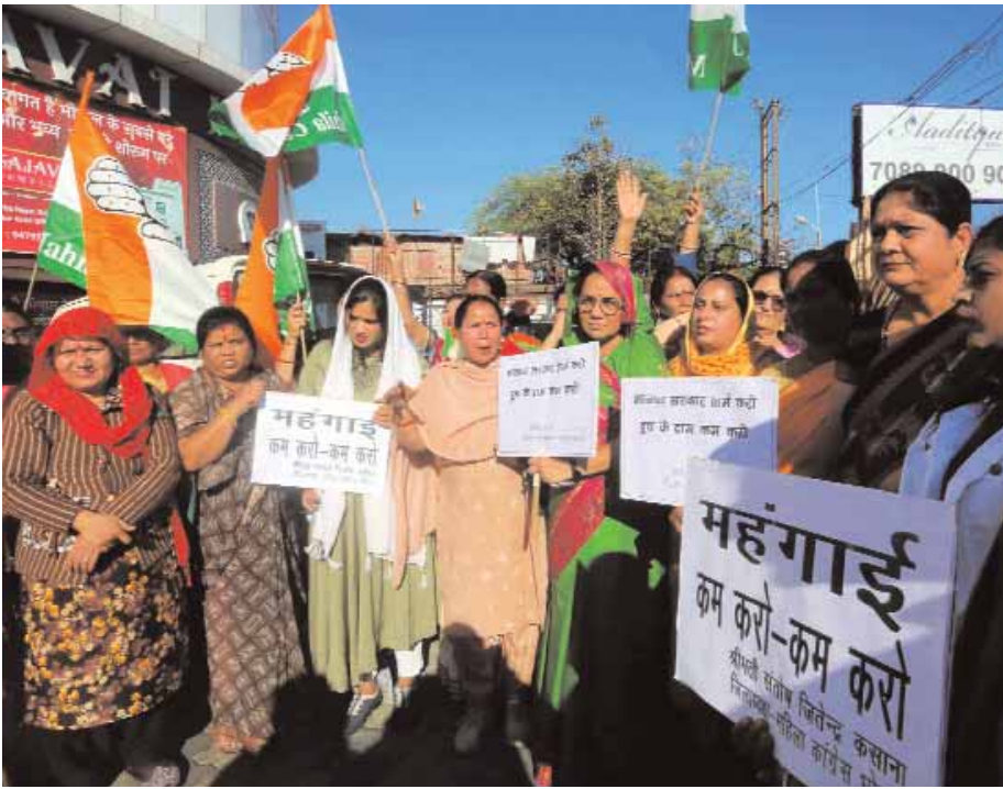
Mahila Congress workers stage a protest against inflation, in Bhopal on Friday.

youth of the state as his nephews and nieces, has now started calling them his sons and daughters. This address has now moved beyond platform slogans towards employment of youth and furthering their educational potential. Chief Minister Chouhan had started the Chief Minister's Young Professionals Development Programme last year to make the young professionals of the state partners in the state's development system. Youth associated with this scheme present in every big and small village and city of the state are contributing in good governance. With this initiative, where it made the government schemes and facilities easily accessible to the backmost person of the society, it has also developed leadership and administrative skills in the youth.