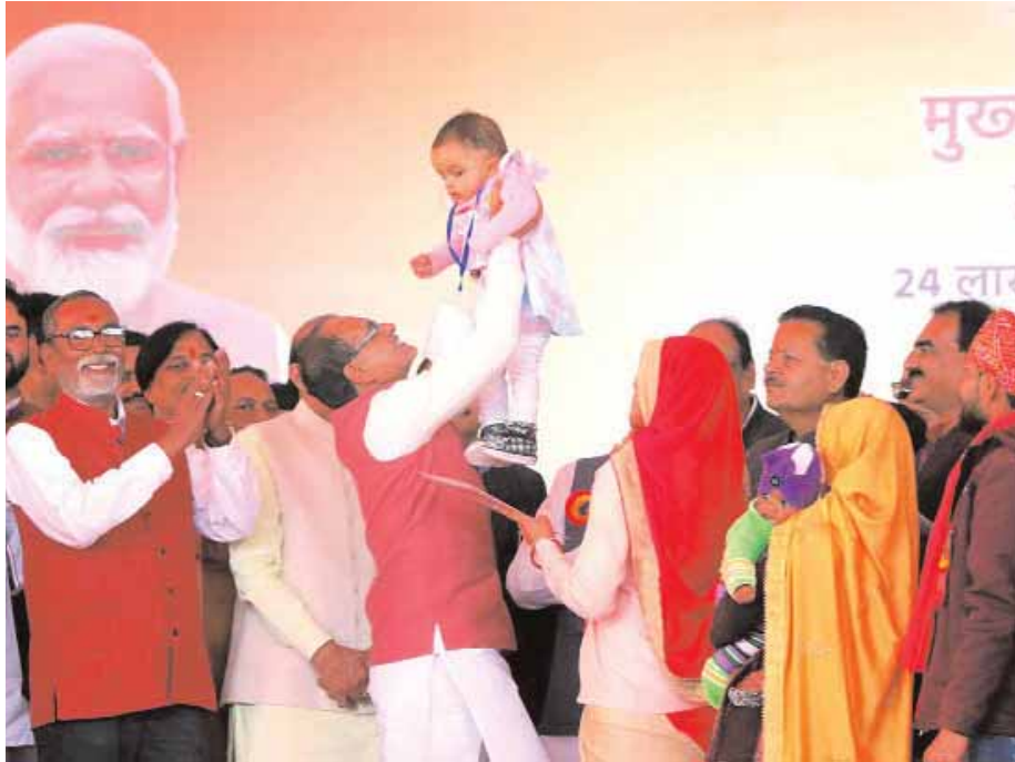
Madhya Pradesh Chief Minister Shivraj Singh Chouhan plays with a child while distributing acceptance letters to the beneficiaries under a public service campaign in Vidisha, Madhya Pradesh on Friday.

Kalyan Yojana. Now these farmer families will also get Rs 12 thousand under the Ladli Behna Yojana. This way, the farmer's family will start receiving Rs 22 thousand annually in a year. He informed that Rs 12 thousand crore will be spent every year and Rs 60 thousand crore in 5 years in Ladli Behna Yojana. Chouhan said that the state government is running several schemes for the welfare of the poor and to make their lives better. A Maha Yagya is in progress for arranging ration, education, medicines and accommodation for the poor. Housing for the poor is being built after getting the government land from the land mafia. Cardholder families are also being given treatment facility up to Rs 5 lakh in a year under the Ayushman Yojana.