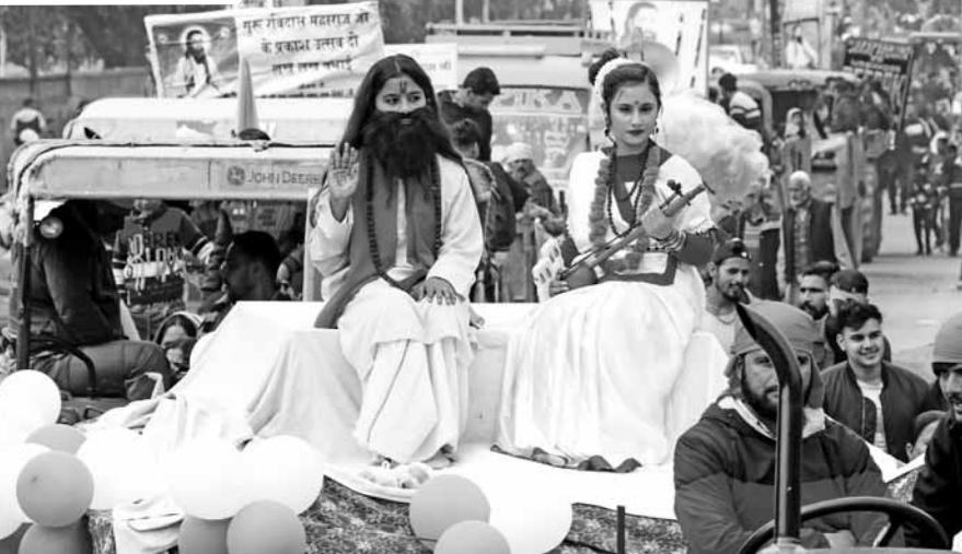
Devotees take part in a religious procession ahead of Ravidas Jayanti, in Jammu