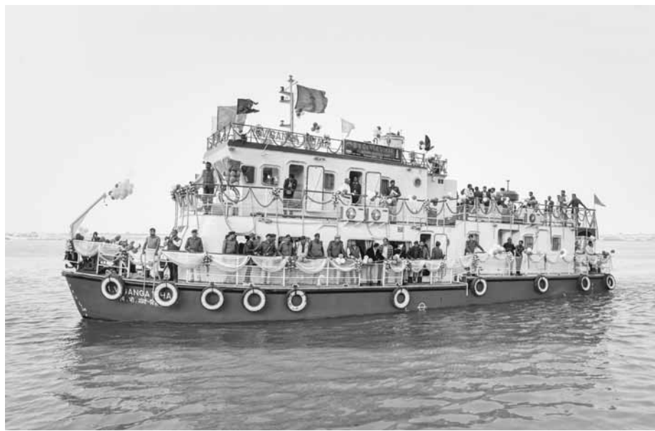
The floating restaurant 'MV Ganga Vihar' that was inaugurated by Bihar Deputy Chief Minister Tejashwi Yadav, in Patna on Friday

Kerala Finance Minister K N Balagopal on Friday presented the Left government's budget for the fiscal 2023-24. Leader of Opposition V D Satheesan said the Left government was hiding the critical financial situation of the state and has increased the tax burden on the people. "The budget is hiding the critical financial situation faced by the State Government and the proposals amount to looting the people. The decision to impose cess on liquor will lead to more people shifting towards drugs."