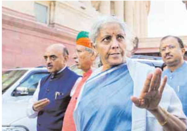
Union Finance Minister Nirmala Sitharaman leaves after addressing BJP members on Union Budget at Parliament House complex in New Delhi on Friday. Union Ministers of State Bhagwat Kishanrao Karad, V Muralaeeharan and Arjun Ram Meghwal are also seen