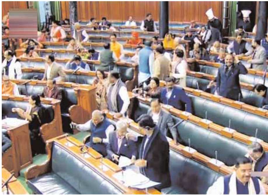
Opposition members in the Lok Sabha during Budget Session of Parliament in New Delhi on Friday

Prior to the ruckus in Parliament, leading to the adjournment of both Houses for the second day, Opposition