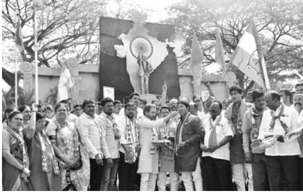
Congress, NCP and Shiv Sena (UBT) workers celebrate their candidates' victory on the Graduates and Teachers constituency seats, in Solapur on Friday

The electoral defeat in the MLC poll from Nagpur Division Teachers' constituency is being seen as a personal setback for Maharashtra's deputy chief minister Devendra Fadnavis and Union Minister Nitin Gadkari, both of whom