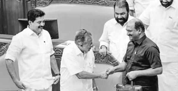
Kerala Chief Minister Pinarayi Vijayan welcomes Finance Minister KN Balagopal as he arrives to present the State Budget 2023-24 in the Assembly, in Thiruvananthapuram on Friday

While presenting the Budget which shows a revenue deficit of ₹24,000 crore, Balagopal blamed the Centre for all ills faced by the State. He said that the BJP-ruled Union Government's measure to restrict the borrowings by the State has upset Kerala's dreams of emerging as the numero uno in the country.