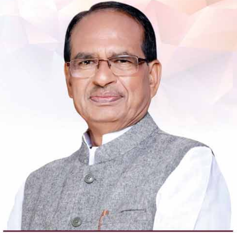
शिवराज सिंह चौहान, मुख्यमंत्री