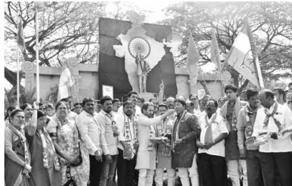
Congress, NCP and Shiv Sena (UBT) workers celebrate their candidates' victory on the Graduates and Teachers constituency seats, in Solapur on Friday

The electoral defeat in the MLC poll from Nagpur Division Teachers' constituency is being seen as a personal setback for Maharashtra's deputy chief minister Devendra Fadnavis and Union Minister Nitin Gadkari, both of whom