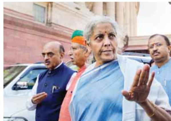
Union Finance Minister Nirmala Sitharaman leaves after addressing BJP members on Union Budget at Parliament House complex in New Delhi on Friday. Union Ministers of State Bhagwat Kishanrao Karad, V Muralidharan and Arjun Ram Meghwal are also seen