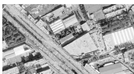
AP ■ DUBAI (UAE)

Satellite photos analysed by The Associated Press on Friday showed damage done to what Iran describes as a military workshop attacked by Israeli drones, the latest such assault amid a shadow war between the two countries.