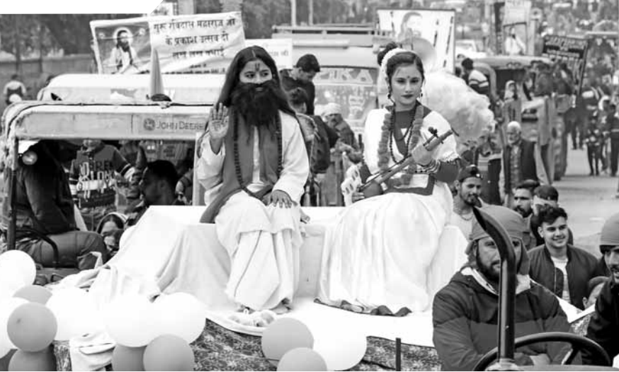
Devotees take part in a religious procession ahead of Ravidas Jayanti, in Jammu