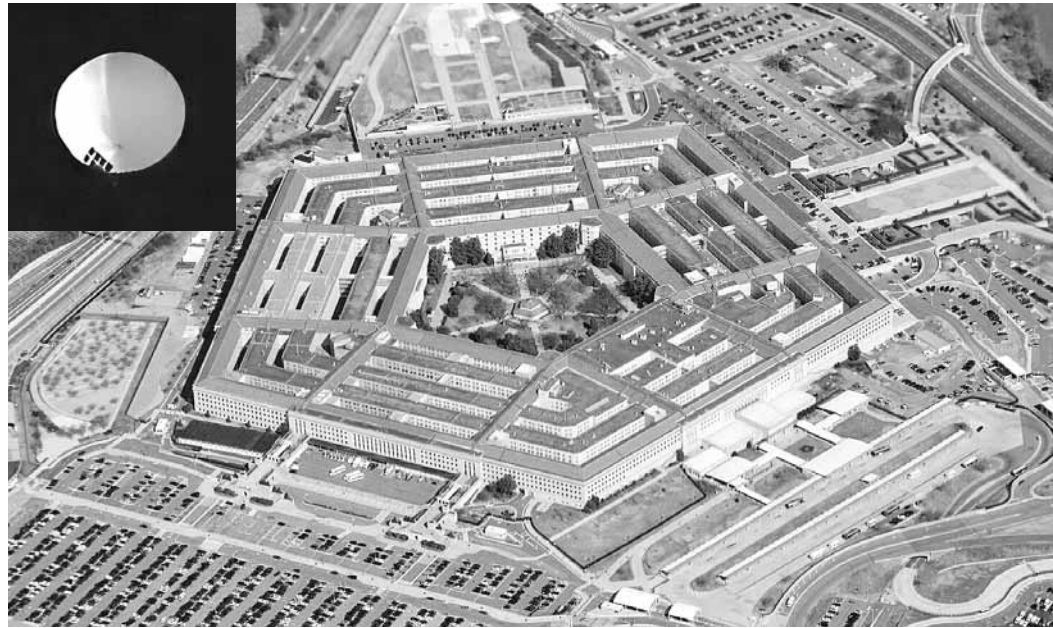
regrets the unintended entry of the airship into US airspace due to force majeure," the statement said.

"Affected by the Westerlies and with limited self-steering capability, the airship deviated far from its planned course. The Chinese side