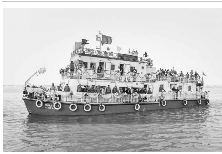
The floating restaurant 'MV Ganga Vihar' that was inaugurated by Bihar Deputy Chief Minister Tejashwi Yadav, in Patna on Friday