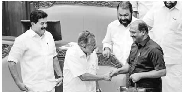
Kerala Chief Minister Pinarayi Vijayan welcomes Finance Minister KN Balagopal as he arrives to present the State Budget 2023-24 in the Assembly, in Thiruvananthapuram on Friday PTI

While presenting the Budget which shows a revenue deficit of ₹24,000 crore, Balagopal blamed the Centre for all ills faced by the State. He said that the BJP-ruled Union Government's measure to restrict the borrowings by the State has upset Kerala's dreams of emerging as the numero uno in the country.