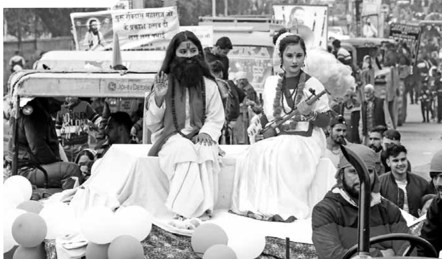
Devotees take part in a religious procession ahead of Ravidas Jayanti, in Jammu