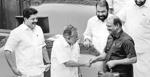
Kerala Chief Minister Pinarayi Vijayan welcomes Finance Minister KN Balagopal as he arrives to present the State Budget 2023-24 in the Assembly, in Thiruvananthapuram on Friday

While presenting the Budget which shows a revenue deficit of ₹24,000 crore, Balagopal blamed the Centre for all ills faced by the State. He said that the BJP-ruled Union Government's measure to restrict the borrowings by the State has upset Kerala's dreams of emerging as the numero uno in the country.