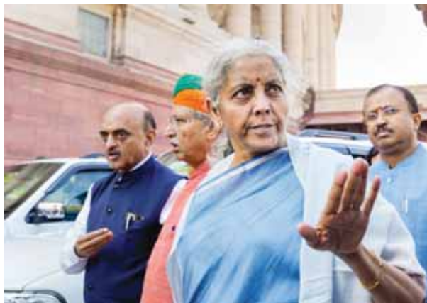
Union Finance Minister Nirmala Sitharaman leaves after addressing BJP members on Union Budget at Parliament House complex in New Delhi on Friday. Union Ministers of State Bhagwat Kishanrao Karad, V Muralaeeharan and Arjun Ram Meghwal are also seen