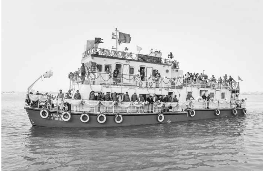
The floating restaurant 'MV Ganga Vihar' that was inaugurated by Bihar Deputy Chief Minister Tejashwi Yadav, in Patna on Friday

Kerala Finance Minister K N Balagopal on Friday presented the Left government's budget for the fiscal 2023-24. Leader of Opposition V D Satheesan said the Left government was hiding the critical financial situation of the state and has increased the tax burden on the people. "The budget is hiding the critical financial situation faced by the State Government and the proposals amount to looting the people. The decision to impose cess on liquor will lead to more people shifting towards drugs."