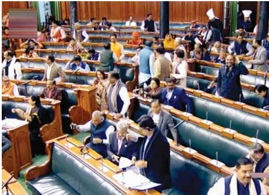
Opposition members in the Lok Sabha during Budget Session of Parliament in New Delhi on Friday

Prior to the ruckus in Parliament, leading to the adjournment of both Houses for the second day, Opposition