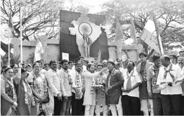
Congress, NCP and Shiv Sena (UBT) workers celebrate their candidates' victory on the Graduates and Teachers constituency seats, in Solapur on Friday

The electoral defeat in the MLC poll from Nagpur Division Teachers' constituency is being seen as a personal setback for Maharashtra's deputy chief minister Devendra Fadnavis and Union Minister Nitin Gadkari, both of whom