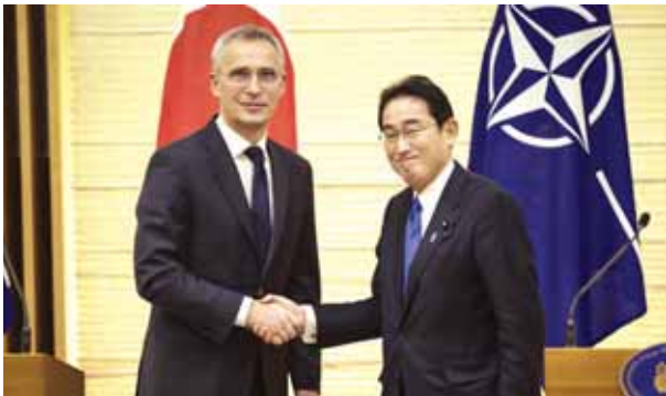
Prime Minister Fumio Kishida.

“China is watching closely and learning lessons that may influence its future decisions,” Stoltenberg said at a joint news conference with Japanese