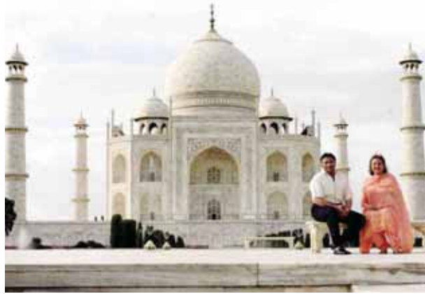
In this Sunday, July 15, 2001 file photo, Pakistan's then President Pervez Musharraf poses with his wife Begum Sehba at Taj Mahal in Agra.

In June last, he was hospitalised in Dubai for three weeks. "Going through a difficult stage where recovery is not possible and organs are malfunctioning. Pray for ease in his daily living," his family said at the time in a statement after the news of his demise had started