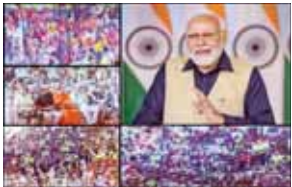
Prime Minister Narendra Modi speaks during the 'Khel Mahakumbh' being held in Jaipur, via video conferencing, in New Delhi on Sunday

He said that today's youth does not want to remain confined to just one field due to their multi-talented and multi-dimensional capabilities. "We are encouraging youngsters to pursue a career in sports. Initiatives like TOPS (Target Olympic Podium Scheme) are benefiting youngsters in preparing for major sporting events," he said.