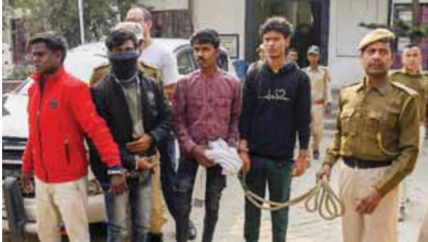
Morigaon at 224.

Dhubri registered the highest number of FIRs against child marriages at 374 cases, followed by Hojai at 255 and