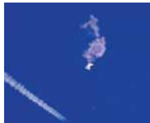
the remnants of a large balloon drift above the Atlantic Ocean, with a fighter jet and its contrail seen below it.

At the direction of President Joe Biden, the US military at 2.39 PM EST on Friday shot down the Chinese surveillance balloon in the Atlantic Ocean, some six miles (9.65 kms) away from the US shores in South Carolina, with no damage to the life and properties of Americans, a senior Defence official told