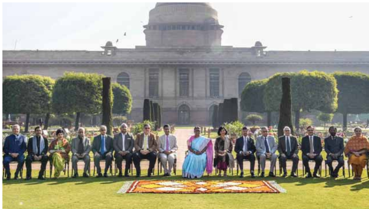
President Droupadi Murmu with Chief Justice of India Justice D.Y. Chandrachud and judges of the Supreme Court during their visit to Amrit Udyan on the premises of Rashtrapati Bhavan, in New Delhi, on Sunday