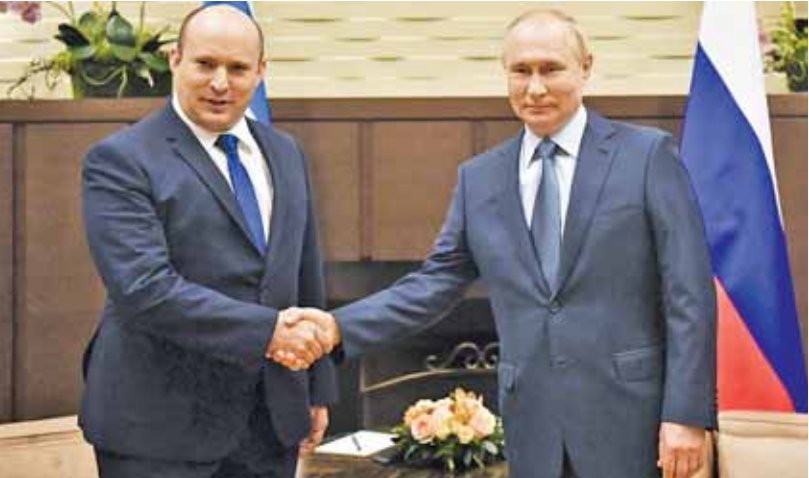
TEL AVIV

Former Israeli prime minister who served briefly as a mediator at the start of Russia's war with Ukraine says he drew a promise from the Russian president not to kill his Ukrainian counterpart. Former Prime Minister Naftali Bennett became an unlikely intermediary in the war's first weeks, becoming one of the few Western leaders to meet President Vladimir Putin during the war in a snap trip to Moscow last March.