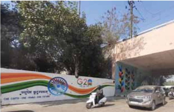
Delhi walls get murals as the city is decorated ahead of the forthcoming G-20 Summit, in New Delhi on Sunday

NDMC has invited 29 countries to participate in the Food Festival, to be held on February 11 and 12. "The main purpose of the Food Festival is for the public to enjoy food delicacies of G-20 member countries and guest countries. All the G-20 member nations and guest countries are invited to participate in this food festival," the