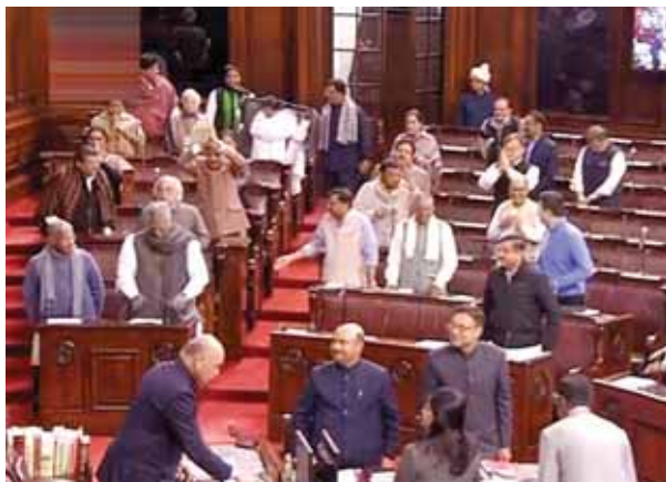
A file photo of Opposition members in the Rajya Sabha during the ongoing Budget Session of Parliament, in New Delhi, on Friday.

With the Opposition being adamant on demanding a Joint Parliamentary Committee (JPC) probe into the Hindenburg report and the Adani Group, no business took place due to the