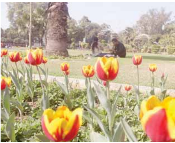
A Delhi garden decorated with the Tulip flowers for G-20 Summit, in New Delhi on Sunday

Many government complexes, public buildings and offices have already displayed posters, banners and standees in their premises, bearing logo, and theme of the G20 under India's presidency — 'Vasudhaiva Kutumbakam' or 'One Earth, One Family, One Future'. SR