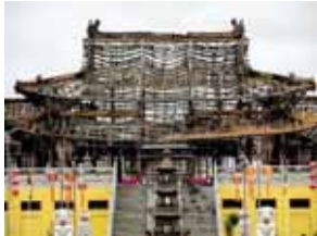
The damaged structure is seen at the scene of a fire at the Bright Moon Buddhist Temple in Springvale South, Melbourne on Monday. The Buddhist temple in Melbourne was extensively damaged by fire Sunday. About 80 firefighters fought the blaze at the temple. Fire investigators haven't yet determined the cause. No injuries were reported.

“Not only is it a place of worship, it's a place of gathering for the local Buddhist community, and at all times, we were engaging with members from