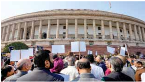
Opposition parties' MPs stage a protest over Adani row in the Parliament complex, in New Delhi on Monday

During the meetings, leaders across party lines were of the view that discussions should be held on the Motion of Thanks on the President's address. Opposition sources