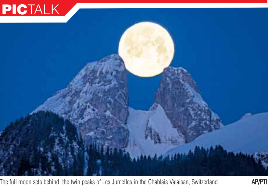
The full moon sets behind the twin peaks of Les Jumeilles in the Chablais Valaisan, Switzerland

The RSS believes that such revisionism would help it fight the cultural and political wars. The AIMPLB also seems to be gearing up for the battle with the votaries of Hindutva. It has opposed the implementation of the Uniform Civil Code and the demolition of people’s properties. In a recent resolution, it said the UCC “is neither relevant nor beneficial for a multi-religious, multicultural and multilingual country like India.” The AIMPLB’s stand over the subject is not new but its reiteration at this point of time has political undertones. It is a well-known fact that the Bharatiya Janata Party has always regarded the UCC as one of its three ‘core issues,’ the other two being the Ram Temple in Ayodhya and the abrogation of Article 370. So, the UCC is the only core issue left that the BJP would like to address, especially in the oncoming nine state Assembly polls and the general elections next year. Like the other two ones, it is also an emotive issue. It would, however, be a pity if the saffron establishment focuses on an emotive issue, even though the Narendra Modi Government has started doing better on the economic front. Another dose of sentimentalism in politics will do no good to our democracy.