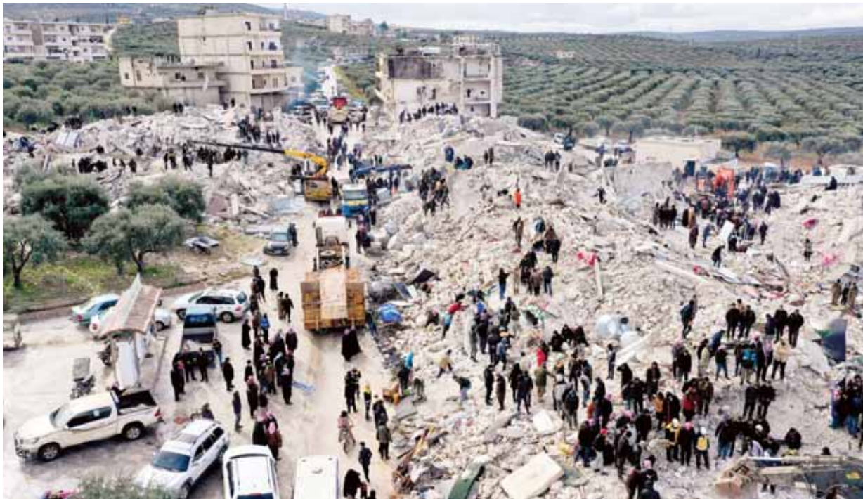
Civil defense workers and residents search through the rubble of collapsed buildings in the town of Harem near the Turkish border, Idlib province, Syria on Monday

The region sits on top of major fault lines and is frequently shaken by earthquakes. Some 18,000 were killed in similarly powerful earthquakes that hit northwest Turkey in 1999. The U.S. Geological