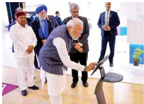
Prime Minister Narendra Modi during the inauguration of the 'India Energy Week 2023' in Bengaluru on Monday. Karnataka Governor Thaaavar Chand Gehlot and Union Minister HS Puri are also seen