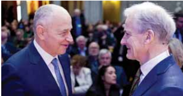
NATO's Deputy Secretary General Mircea Geoana, left, and Norway's Prime Minister Jonas Gahr Store, speak at the Leangkollen Security Conference 2023 in the university hall in Oslo, Norway, on Monday.

Oil-rich Norway is looking to donate 75 billion kroner (USD 7.3 billion) to Kyiv as part of a five-year support package that would make the Scandinavian country one of the world's biggest donors to war-torn Ukraine, the Norwegian government said Monday. Prime Minister Jonas Gahr Store said the money would be split evenly between military and humanitarian assistance over five years, broken down to 15 billion kroner