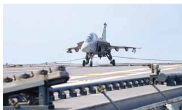
In a major milestone, the Naval variant of the indigenous Light Combat Aircraft (LCA) undertook maiden landing onboard the country's first Indigenous Aircraft Carrier INS Vikrant