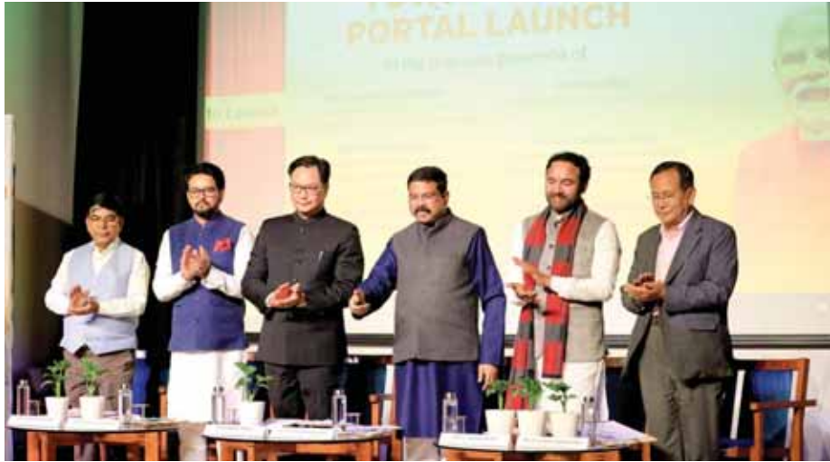
Union Education Minister Dharmendra Pradhan launched the Yuva Sangam portal in the presence of Union Law and Justice Minister Kiren Rijiju, Union Culture, Tourism DNER Minister G Krishan Reddy, Union Youth Affairs & Sports and I&B Minister Anurag Thakur, Minister of State for Education Subhas Sarkar and Minister of State for Education, Rajkumar Ranjan Singh. Members of Parliament from the North-Eastern States also attended the event.

December 2022 "shall have precedence over the two names recommended presently for appointment to the Supreme Court."