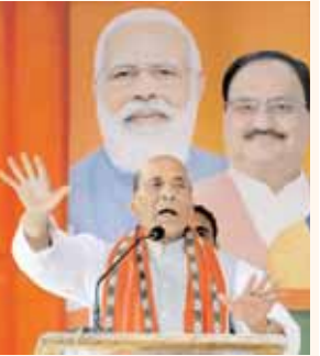
Defence Minister Rajnath Singh speaks during an election campaign meeting ahead of Tripura State Assembly elections at Agartala, on Tuesday

Singh, who arrived on a two-day visit to the poll-bound state on Monday, said the BJP brought development to the state, which had poor infrastructure during the CPI(M)'s rule. "Now, electricity, water connections and roads are available as the BJP government is taking all possible steps to speed up development.