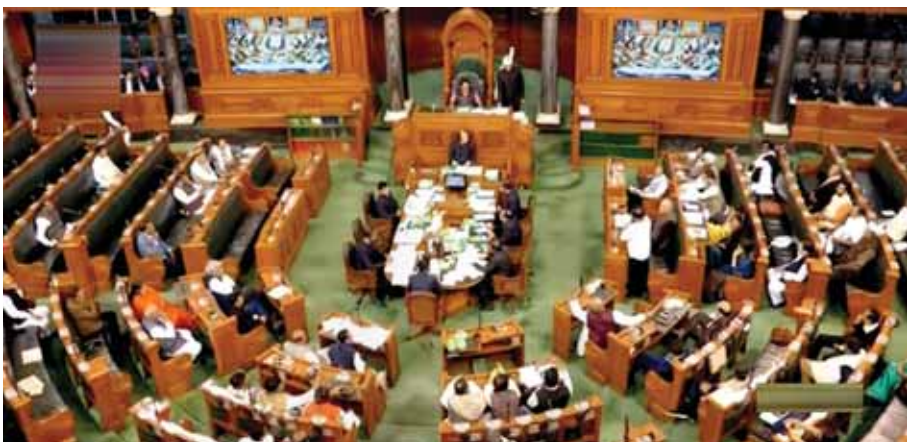
View of the Lok Sabha during Budget Session of Parliament in New Delhi on Tuesday

After three days of Budget session washout over the Adani row, the Congress and most of the Opposition parties resolved to participate in the debate on the Motion of Thanks to the President's Address. The Opposition has been demanding a joint parliamentary committee (JPC) probe or a Supreme Court-monitored investigation into the Hindenburg Research report against Adani's companies that