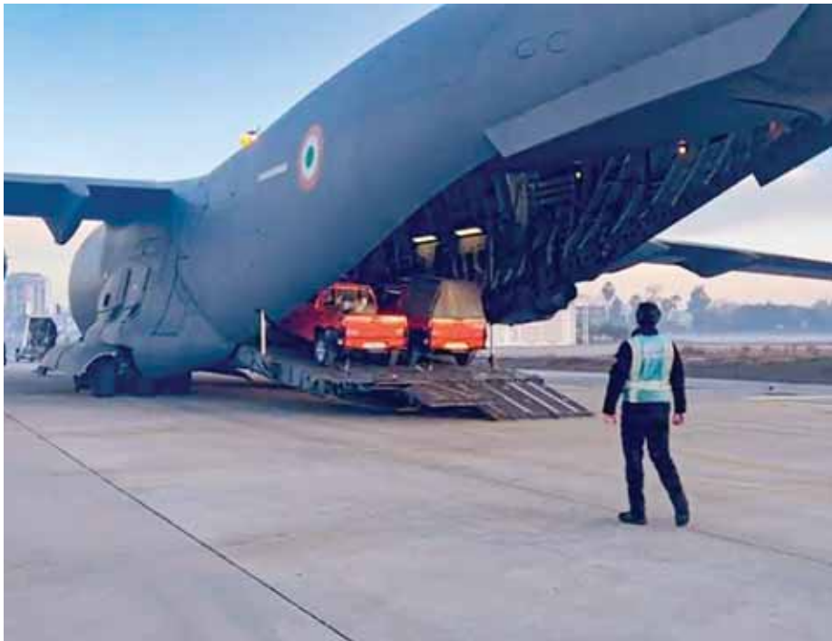
IAF's first C-17 Globemaster III heavy lift aircraft carrying NDRF rescue teams and relief material arrives in Adana to support rescue and search efforts in earthquake-hit Turkey