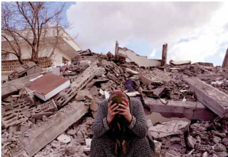
A woman sits on the rubble as emergency rescue teams search for people under the remains of destroyed buildings in Nurdagi town on the outskirts of Osmaniye city southern Turkey on Tuesday