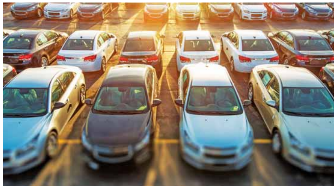
table demand for parking, using up large tracts of the scarce land, even as real estate development has gone vertical.

CARS OR TWO-WHEELERS ACCOUNT FOR 85 PER CENT OF PARKING SPACE USAGE BUT PROVIDE FOR ONLY 4-5 PER CENT OF TRAVEL DEMAND. IN CONTRAST, CABS ACCOUNT FOR 4-5 PER CENT OF PARKING AND ON AN AVERAGE CARRY 15-20 TIMES MORE PASSENGERS THAN A PRIVATE CAR