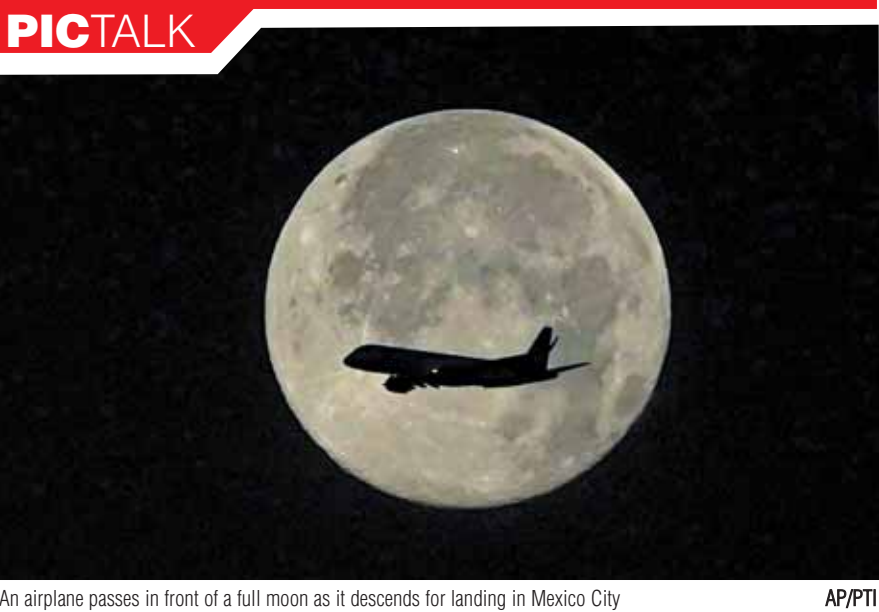
An airplane passes in front of a full moon as it descends for landing in Mexico City